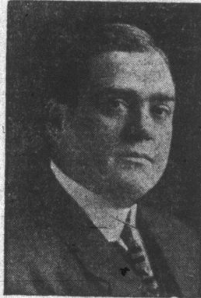
The Red Sox manager who has been re-appointed.