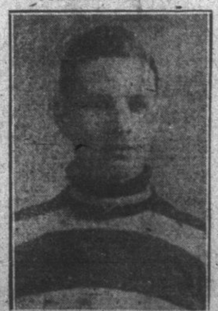
Released from Royal Air Force. He will play with Ottawa.