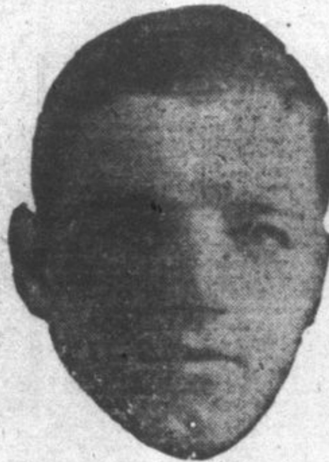
Former celebrated Wanderer to play with Canadians.

If Charles Chaplin adheres to his stand not to allow International League baseball in Rochester next season, it will hurt the new league. It is true that Rochester has not had a great deal of success in baseball the past few years, but give that city a good team and a good manager and things would hum.