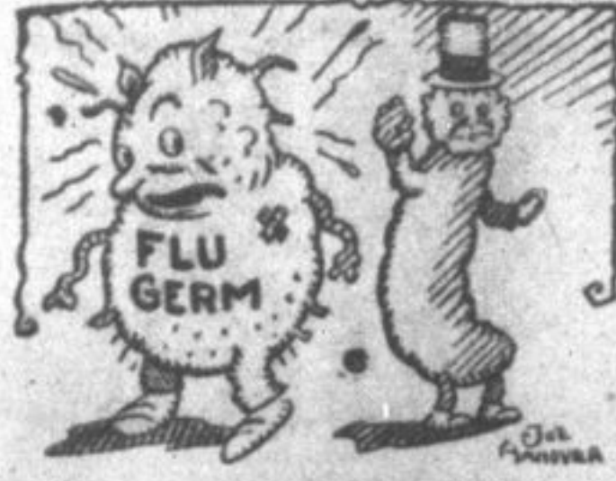
THE MEANEST EVER Microbe—Go 'way from here! I'm a perfectly respectable germ, and don't want anything to do with you!