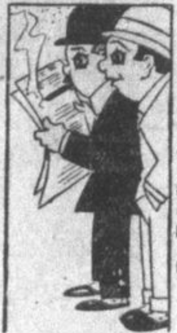
WOODEN A man's face is visible at 200 yards, but you can't distinguish his features. At 800 yards a man looks like a post. And some at less distance.