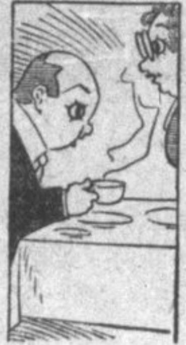
IN THE MAKING Boarder—This tea is very weak. Landlady—I buy only the best tea, sir. Board—Doubtless! Its weakness is wholly structural, I believe.