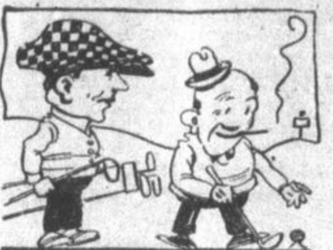
ORPHANED "So your wife has taken up golf, too?" "Yes, our children are now golf orphans."