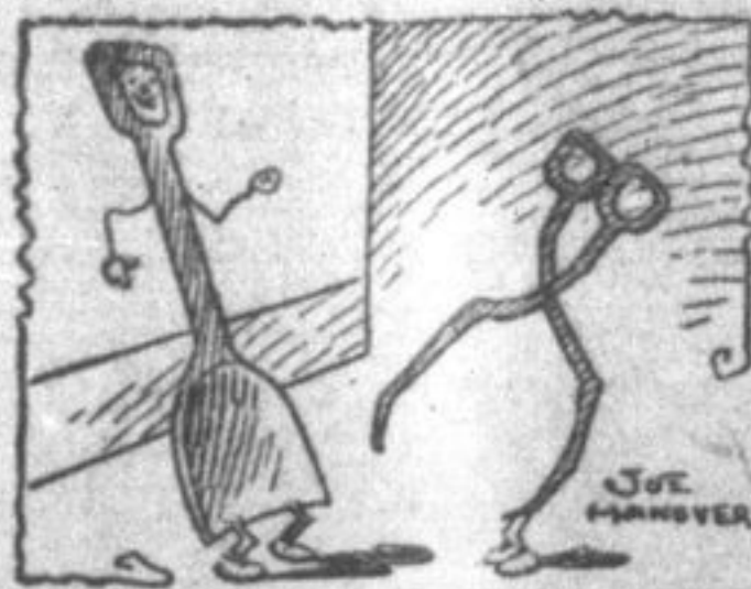
SUCH IS LIFE Coal Shovel (to the Tongue)—Well, old chap, here's where you step out and I step in!