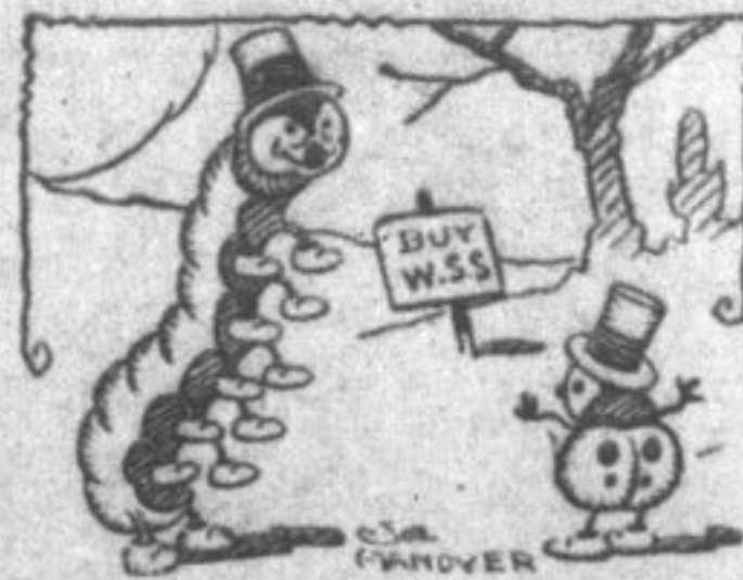
GOOD NEWS FROM HIM Bug—You're happy. Centipede—Sure. The government is going to lower the price of shoes.