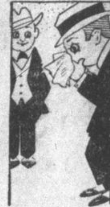
WARNING Don't be a human atomizer. Think of others and be wiser; Smother your sneezes in your hanky and your fellow citizens will thankee.