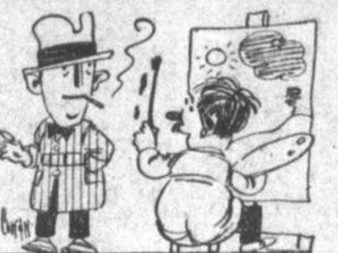
DIDN'T LOOK GOOD TO HIM "I am wedded to my art." "Then me for the single life."