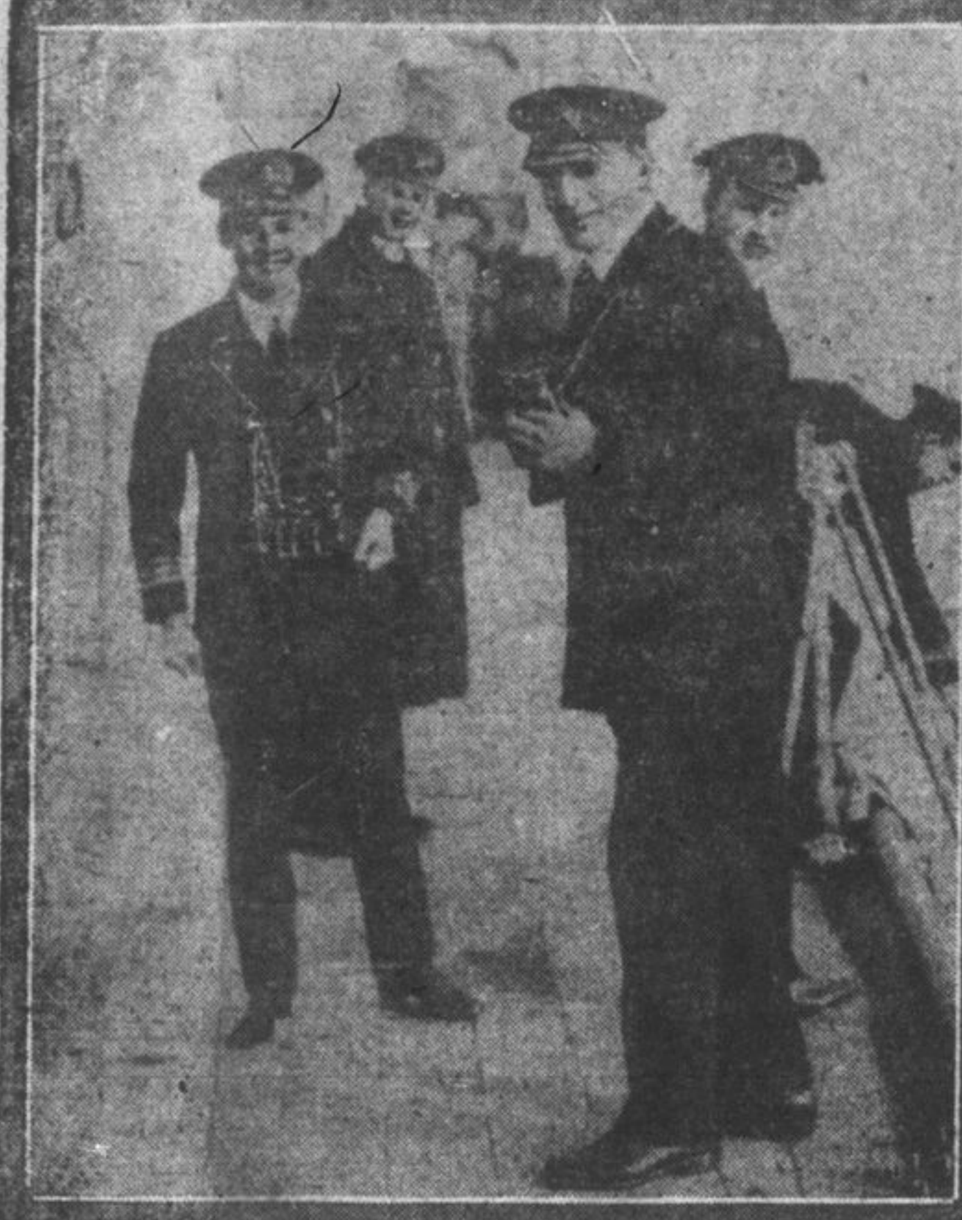
The smile on the face of Admiral Tyrwit shows that he was not altogether displeased over receiving the surrender. The picture was taken at Harwich, Nov. 20, on his flagship, the Curacao.