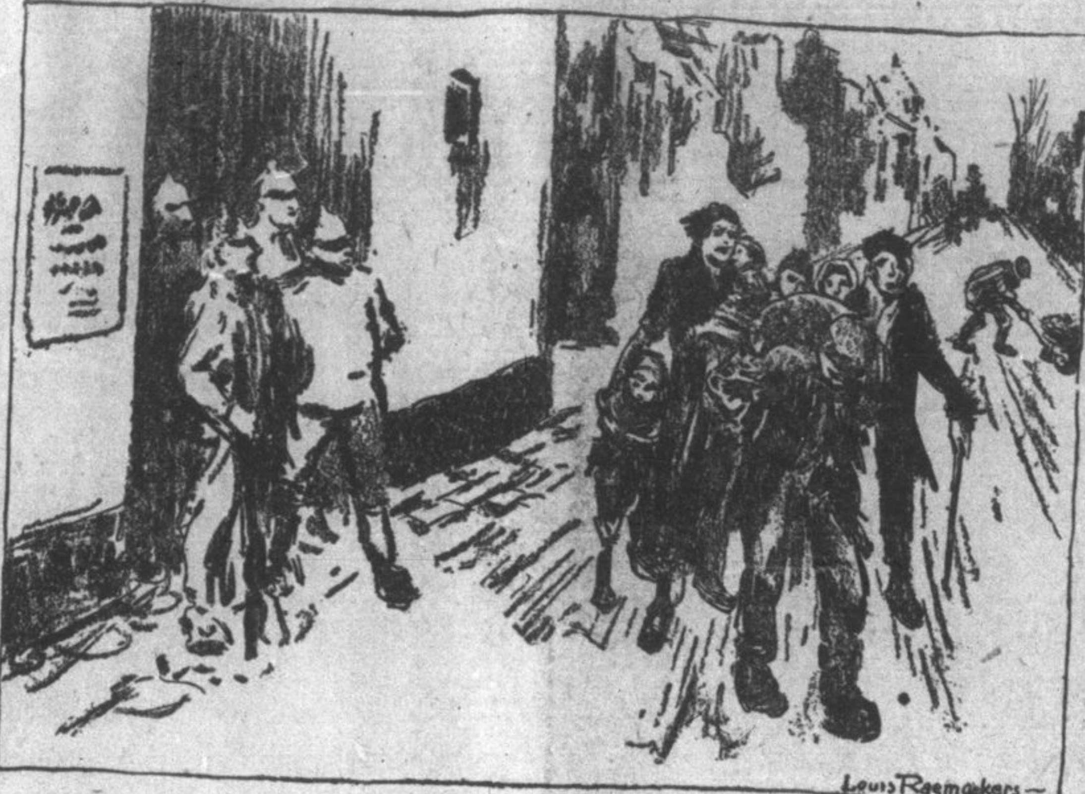
The same people are now returning to their devastated homes. They need your help.