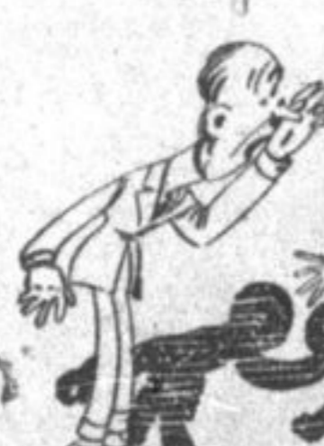
DASHING HIS HOPE

"That is a lovely gown, but haven't I seen it before." "No, I think not; I have only worn it at a very few smart affairs this season."