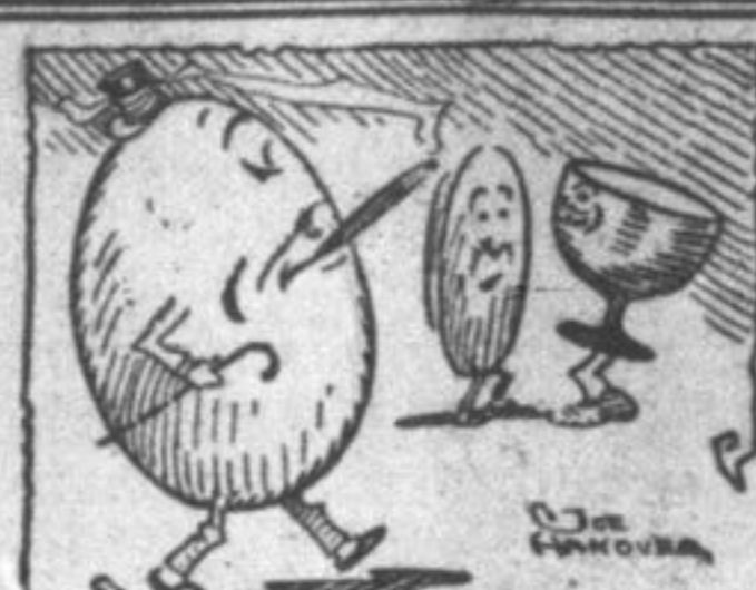
CAUSE FOR PRIDE

Spider—Hey you fool bug, what do you think I am, a target?