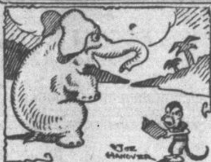
A SIMPLE TASK

Monk (reading jiu jitsu book)—Grasp your opponent's wrist and throw him over your shoulder.