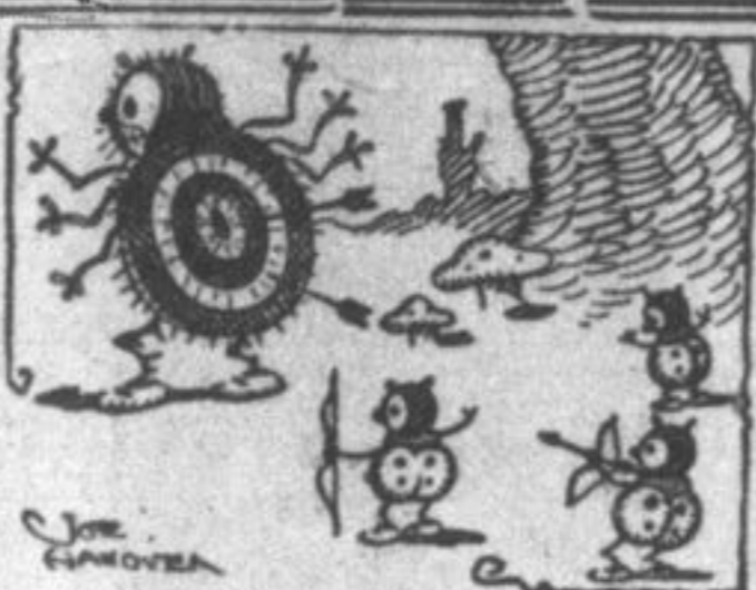
LOOKED LIKE IT

Monk (reading jiu jitsu book)—Grasp your opponent's wrist and throw him over your shoulder.