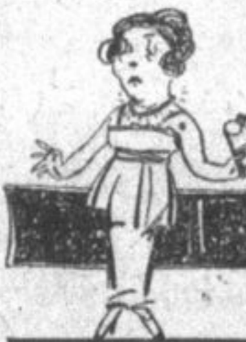
A HOT ONE

Her Dad—What am I to presume your income will be at the time you expect to marry? Suitor—Well—I hardly like to put a figure on your generosity, sir.