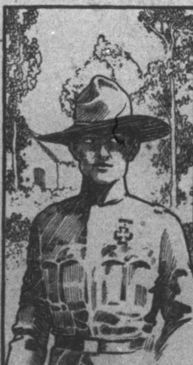
FRENCH WAR CROSS WAS CONFERRED

Upon 15 Americans for gallantry one year ago today, November 26, 1917. Find a Frenchman.