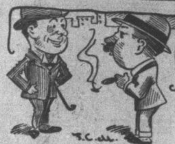
NOTHING DOING "Going to have a new overcoat this winter?" "I thought I was, but my wife decided yesterday that it is a non-essential."