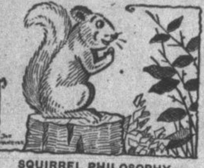
SQUIRREL PHILOSOPHY Hungry Squirrel—"I'll bet no great oak will grow from this acorn."