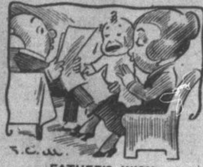
FATHER'S WISH Mother—My! How the tears stream down baby's cheek when he cries.