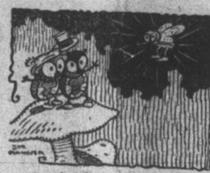
A MEAN TRICK Firefly—Hey, you give me a dime or I'll stay here and light up the whole place.