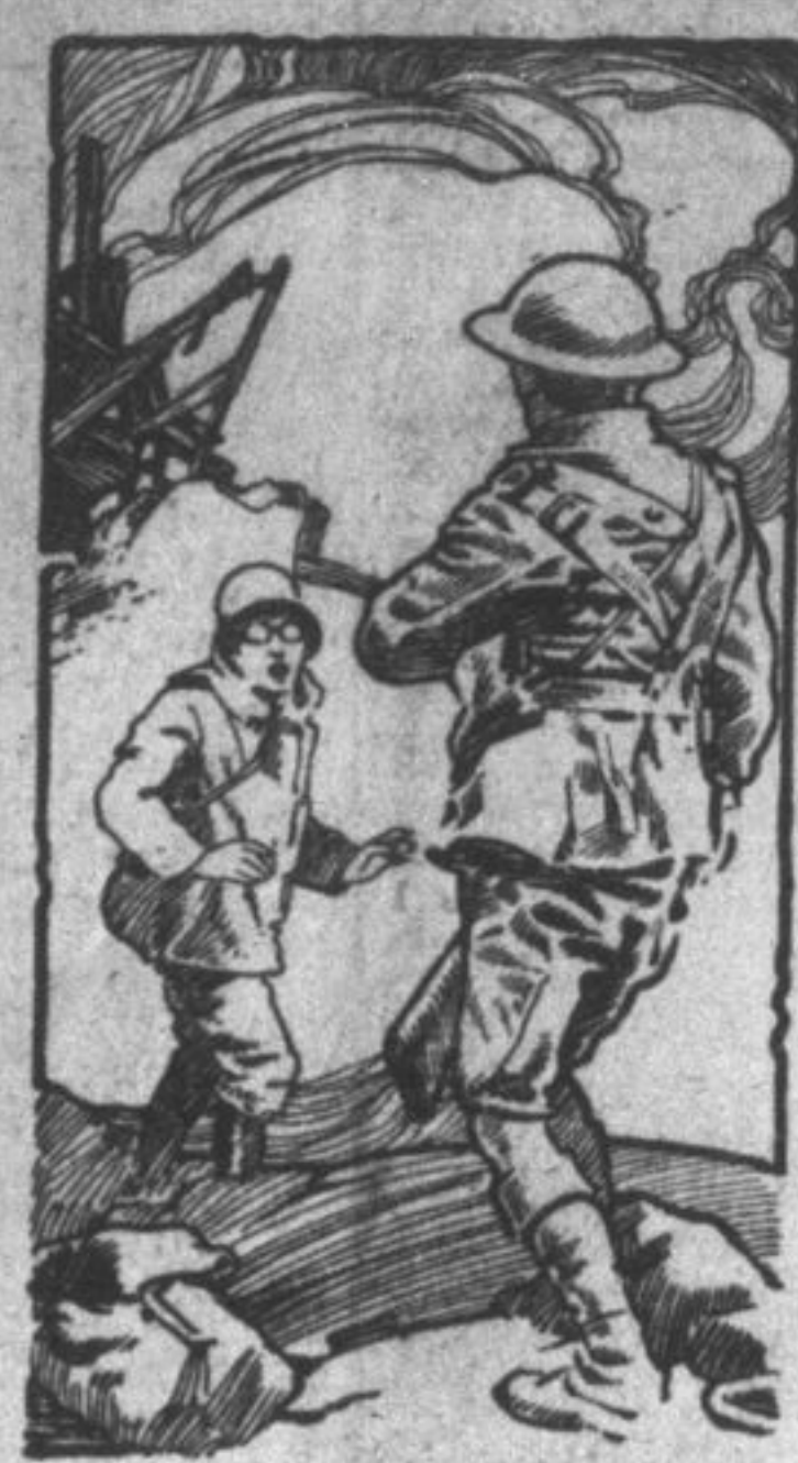
BRITISH SURPRISED GERMANS Taking 3,000 prisoners and two towns, two years ago today, November 13, 1916.

Find another prisoner. YESTERDAY'S ANSWER Right side down in front of officer.