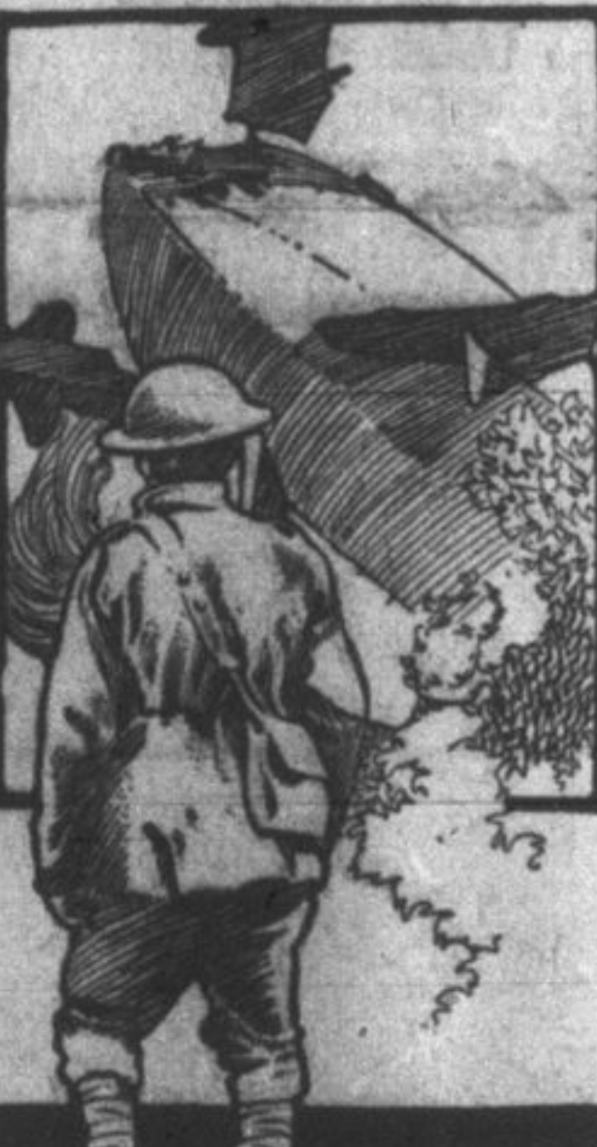
FOUR GERMAN ZEPPELINS DESTROYED

By French on return from raid on England, one year ago today, October 19, 1917.