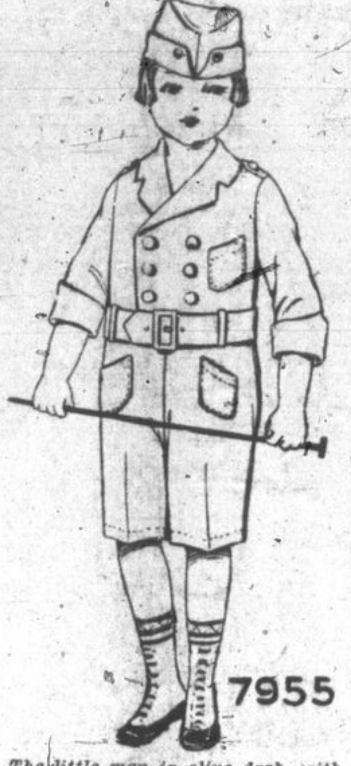
The little man in olive drab, with top to match his suit. The double-breasted waist is made with open neck finished with round collar.

The clothes that Johnny's elects to wear all have a military note. Pacific parents may discourage the inclination, but their pleadings meet a deaf ear. A natty suit in olive drab made upon this model makes a strong appeal to the small boy. The double-breasted waist is made with open neck, finished with a round collar, while the side closing trousers are trimmed with patch pockets. Straps of the material are stitched on the trousers to slip the belt through. In medium size the suit and cap require 2 1/2 yards 44-inch material.