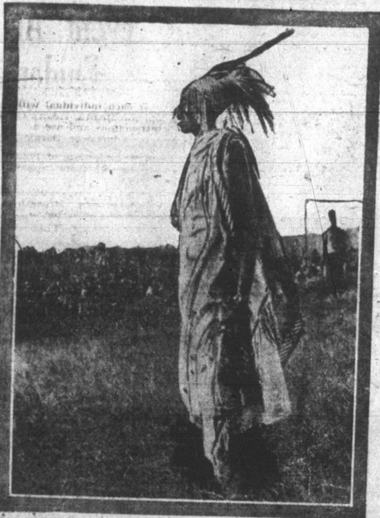
King Mustang, who rules over two million East African subjects. He is seven feet in height.