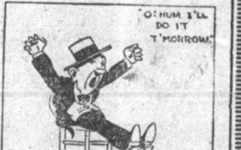
He who stalls around and mopes, Will fall, a-hangin' On the ropes.

C. W. LINDSAY, Limited 121 Princess Street Kingston Canada's Premier Piano House. Montreal, Ottawa, Quebec, Belleville, Brockville and Three Rivers