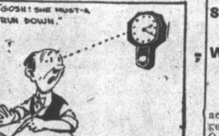
He who lifts his ivory dome, Will never bring The bacon home.