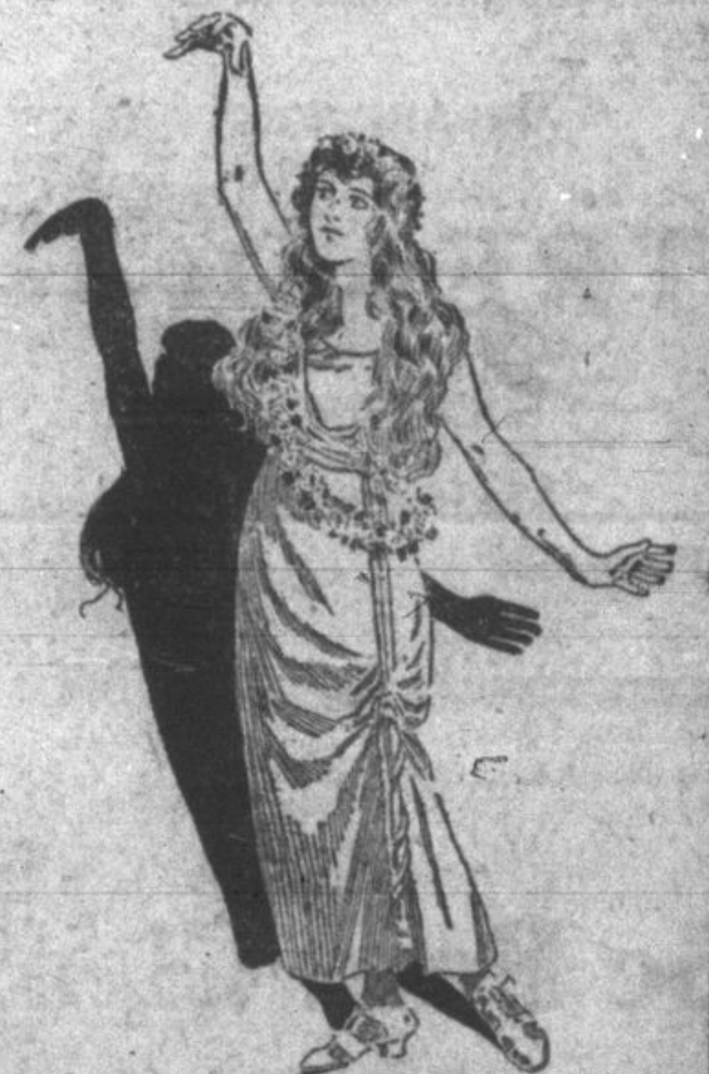
YOUTH IN HENRY W. SAVAGE'S ELABORATE MUSICAL SPECTACLE EVERYWOMAN