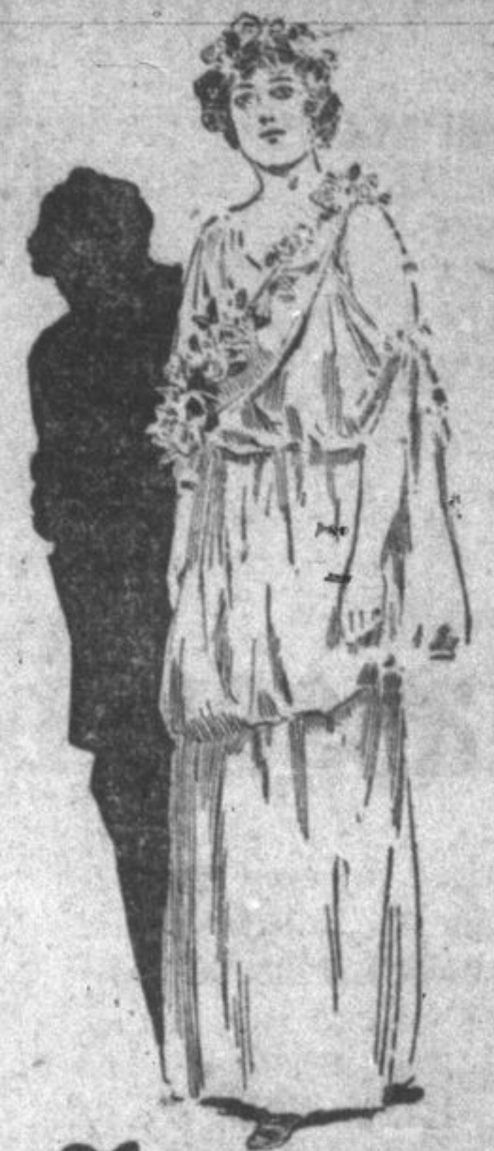
MODESTY IN HENRY W. SAVAGE'S ELABORATE MUSICAL SPECTACLE EVERYWOMAN