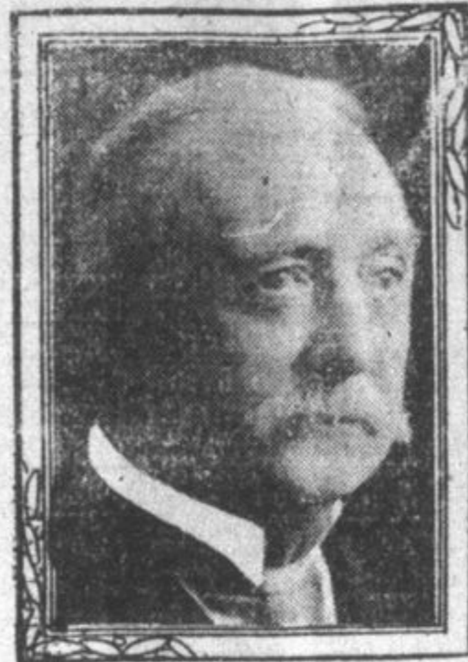
One of the senior members of the Montreal Stock Exchange.