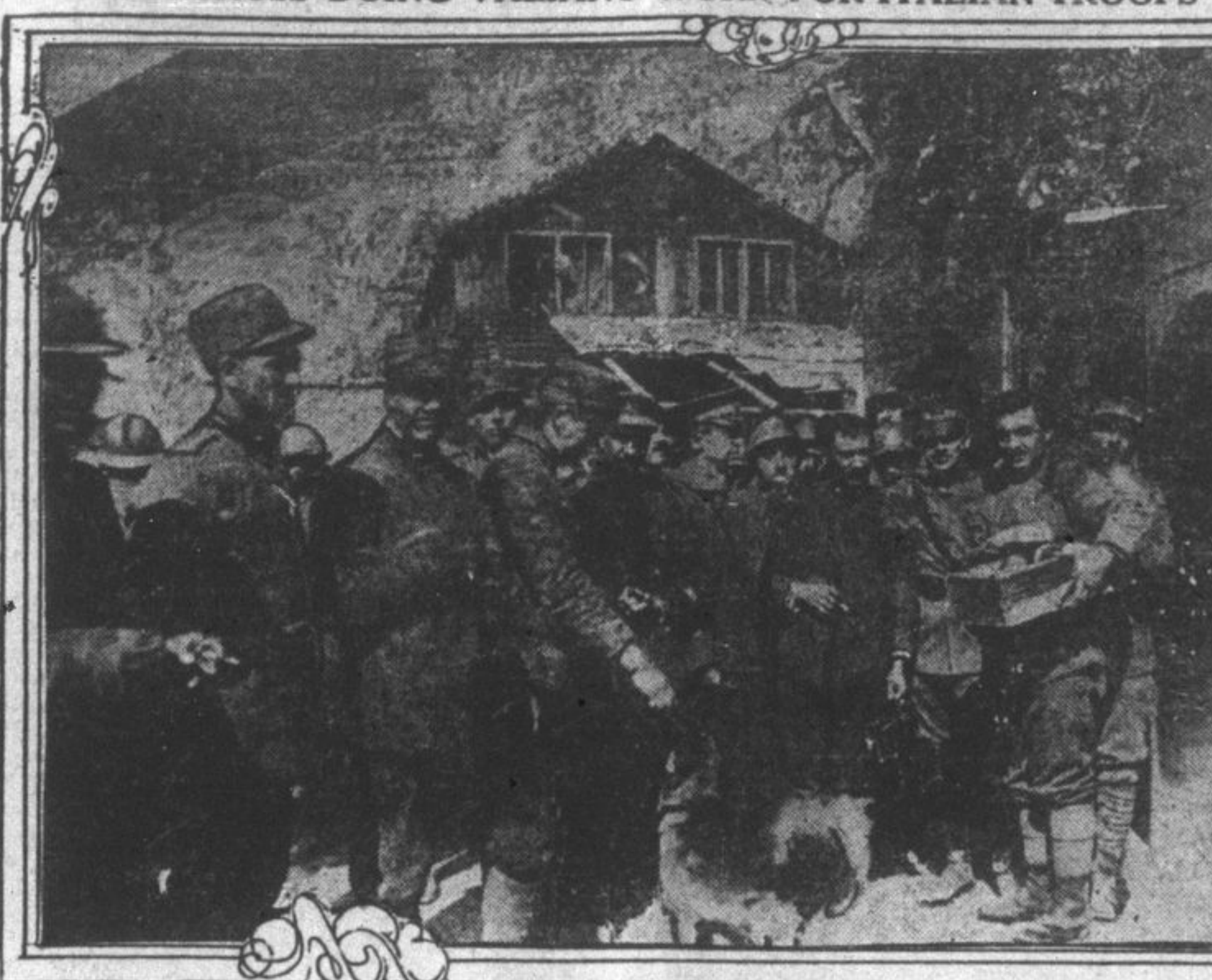
THE AMERICAN RED CROSS ROLLING CANTEENS IN ITALY. The American Red Cross has done valiant work for the Italian troops who have been so busily occupied in behalf of the allied cause.

directed shots, is illustrated by the facts that these Canadian beginners have cut down the regulation time allowance issued by the War Council to less than one-half. Speed in shooting is the essential impressed upon every rifleman, reasonable accuracy to be sure, but above all, speed. That is what counts in stemming a rush of Hunns. The targets are not so small then.