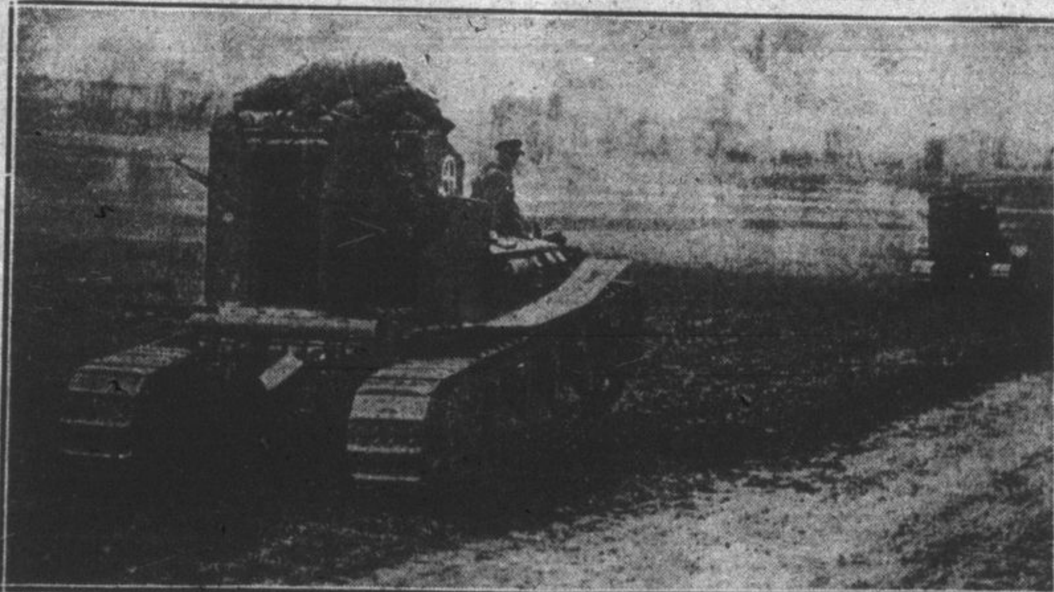
This photograph, the first to reach this country, shows the new model of light British tank, which is scoring very effective results in the latest battles. It is much lighter, faster and more easily navigated than the old type, and is being put into the field in large quantities. This official photograph is taken showing the tanks going forward into battle to assist in checking a recent German attack.