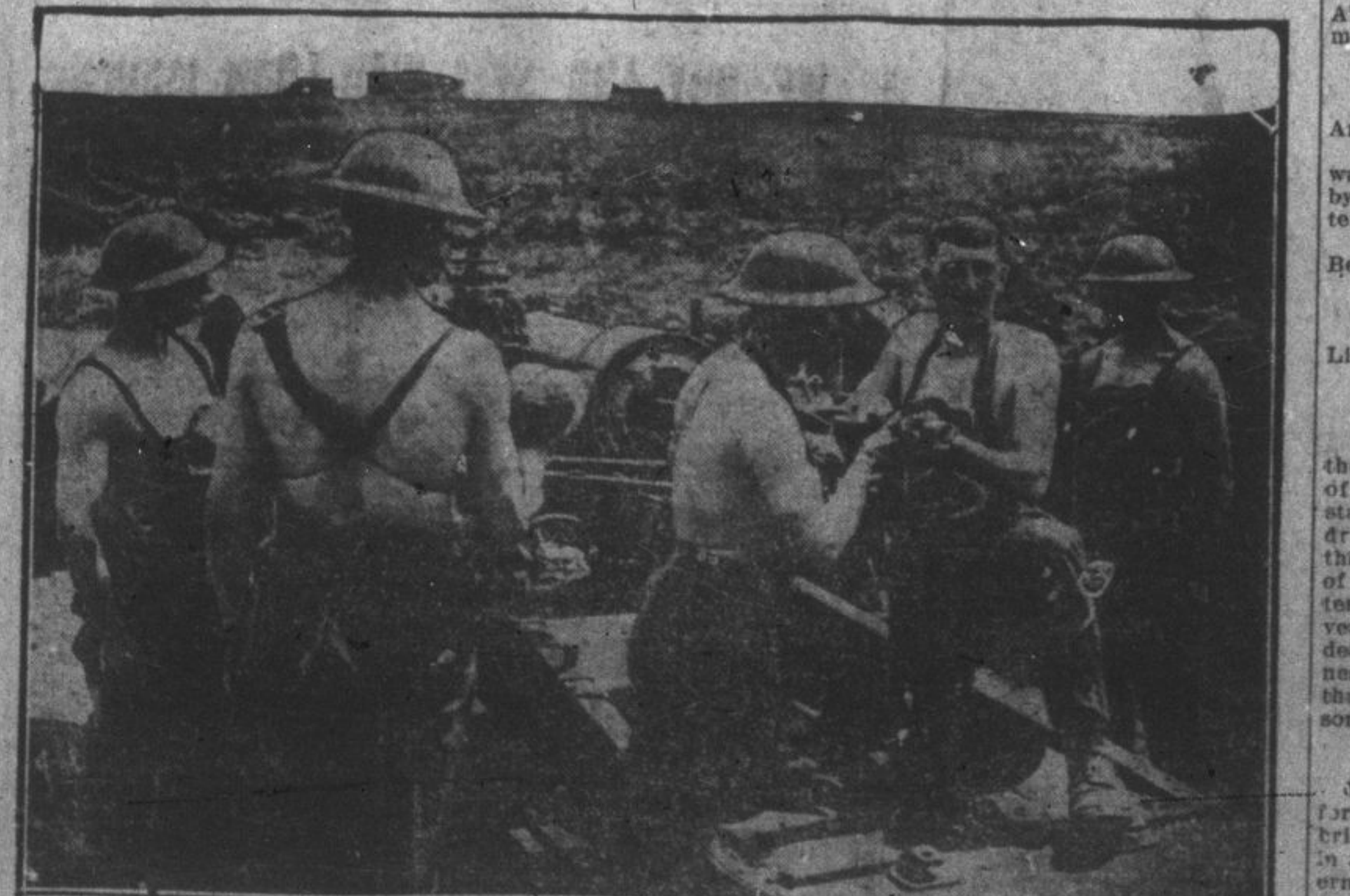
Gunners of a British 6-in. howitzer battery work half naked in the sweltering heat of summer, but always keep their gas masks hanging around their necks.