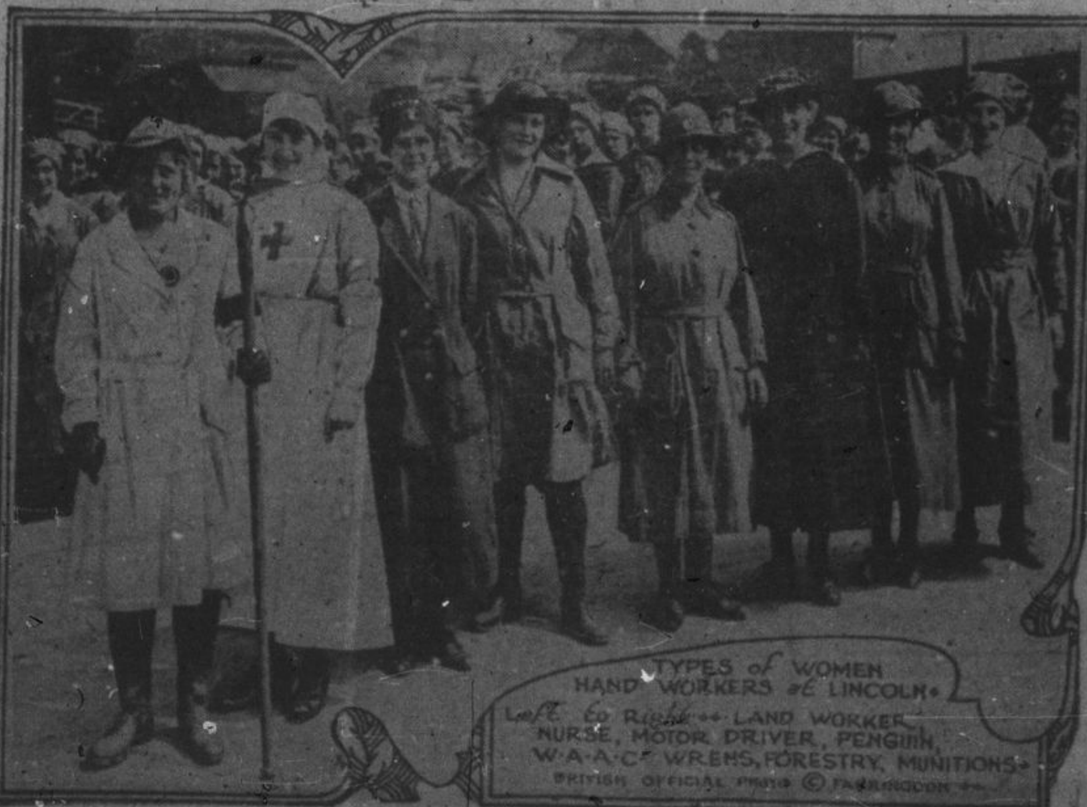
TYPES OF WOMEN HAND WORKERS OF LINCOLN: L.A. & R. ROAD, LAND WORKER, NURSE, MOTOR DRIVER, FENGIN, W.A.A.C.F. WRENS, FORESTRY, MUNITIONS.