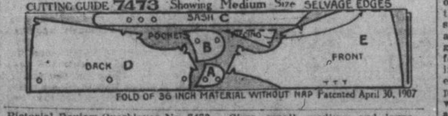
Pictorial Review Overbouse No. 7473. Sizes, small, medium and large. Price, 15 cents.

Running along in fashion's race with the sleeveless sweater for the