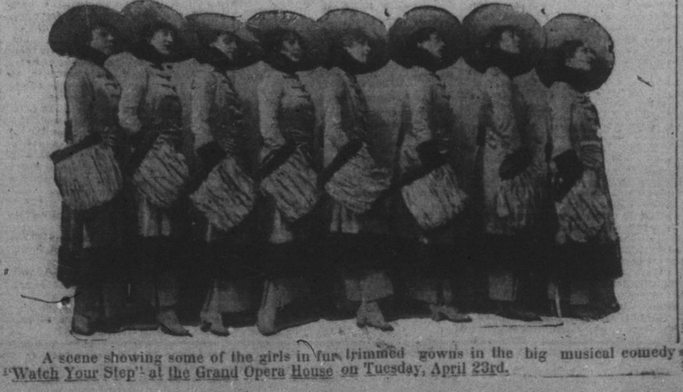
A scene showing some of the girls in fur-trimmed gowns in the big musical comedy 'Watch Your Step' at the Grand Opera House on Tuesday, April 23rd.