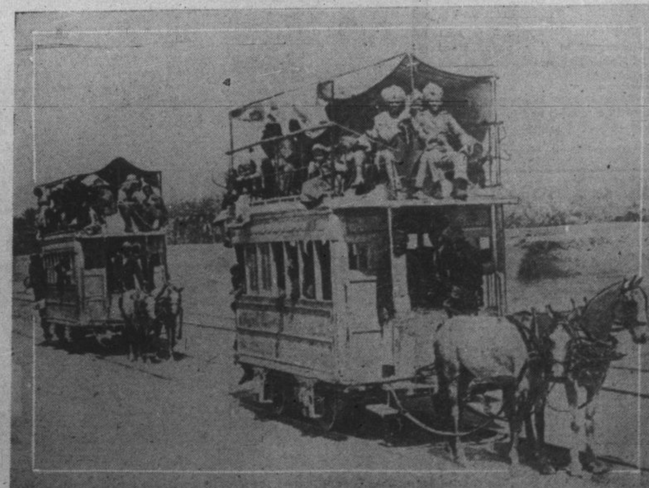
INDIAN NATIVE TROOPS IN MESOPOTAMIA Soldiers from the British forces enjoying a ride on the Bagdad-Kadhima tramway.