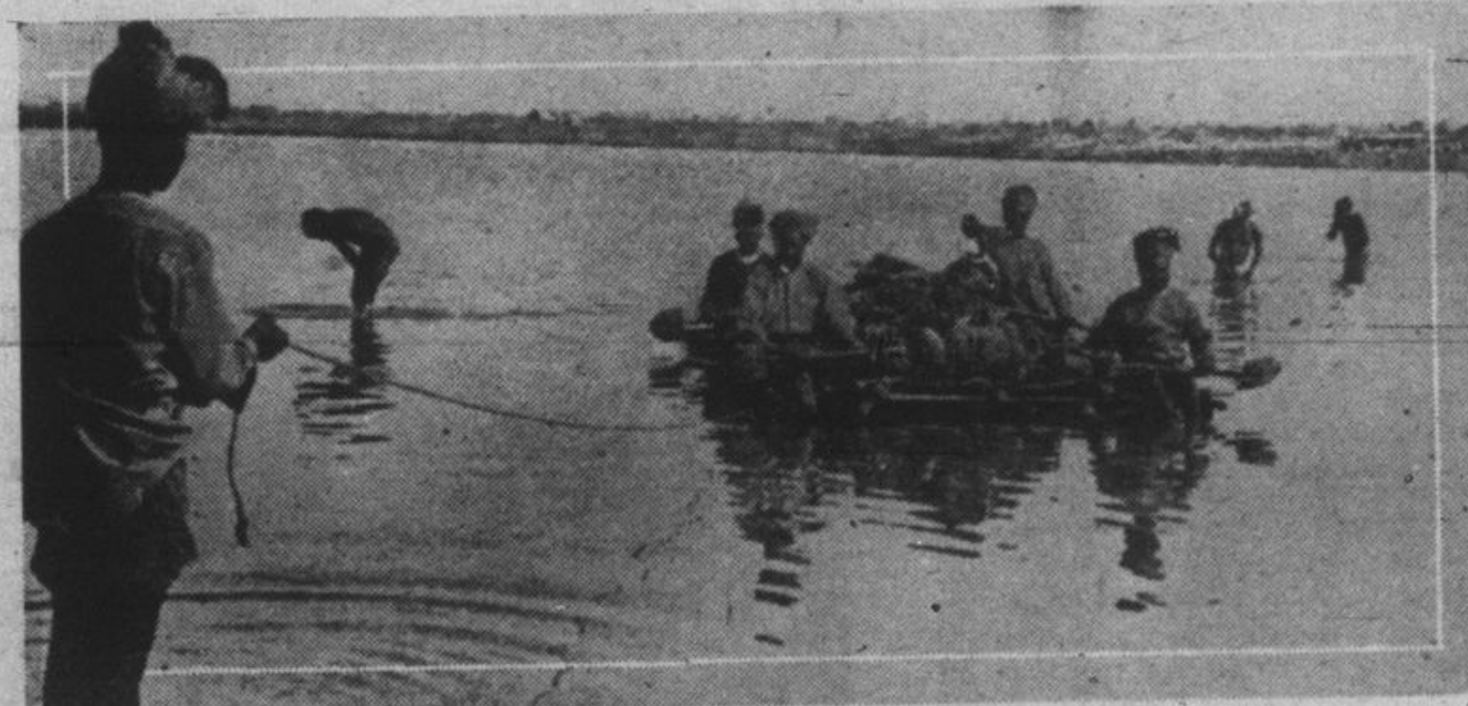
CAMPAIGNING IN MESOPOTAMIA Special rafts have been constructed for carrying Indian troops.