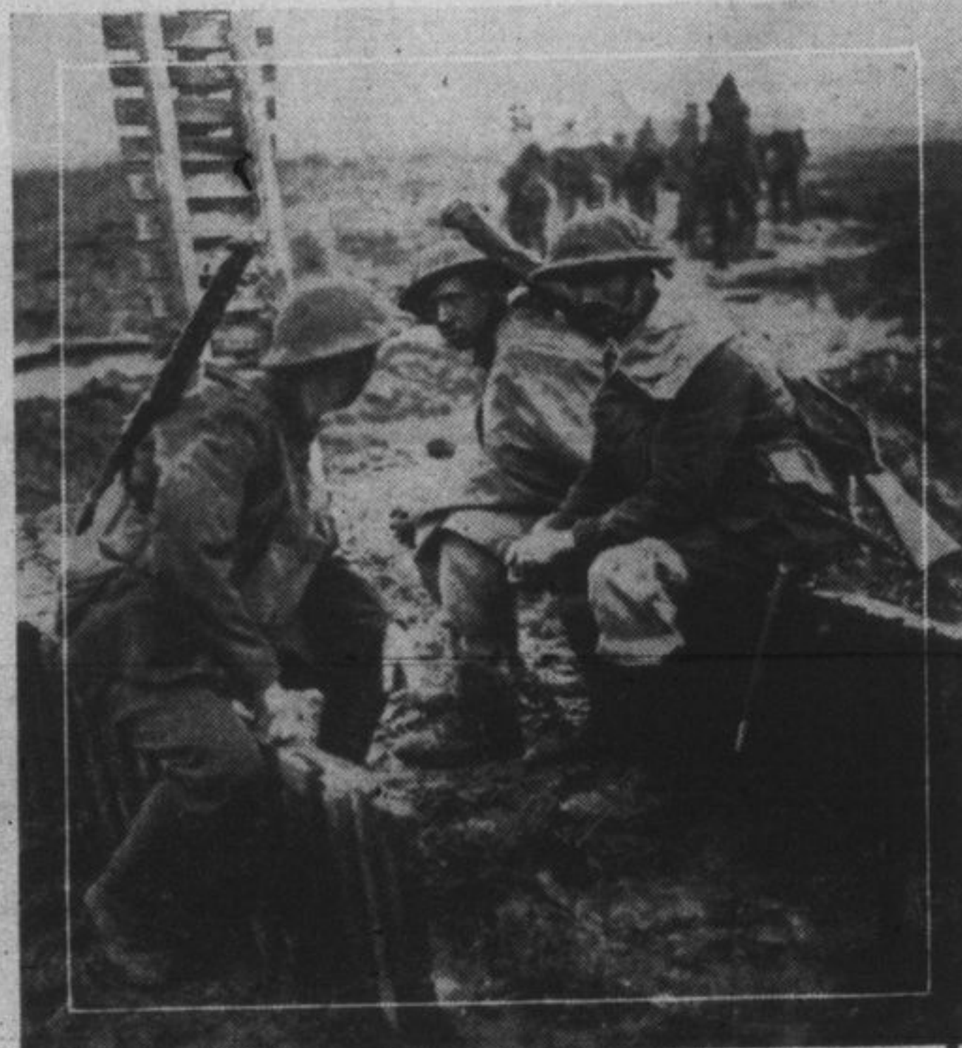
AT A BATTLE OF THE RIDGES Irish Guardsmen taking up duckboards to make track over newly-captured ground.