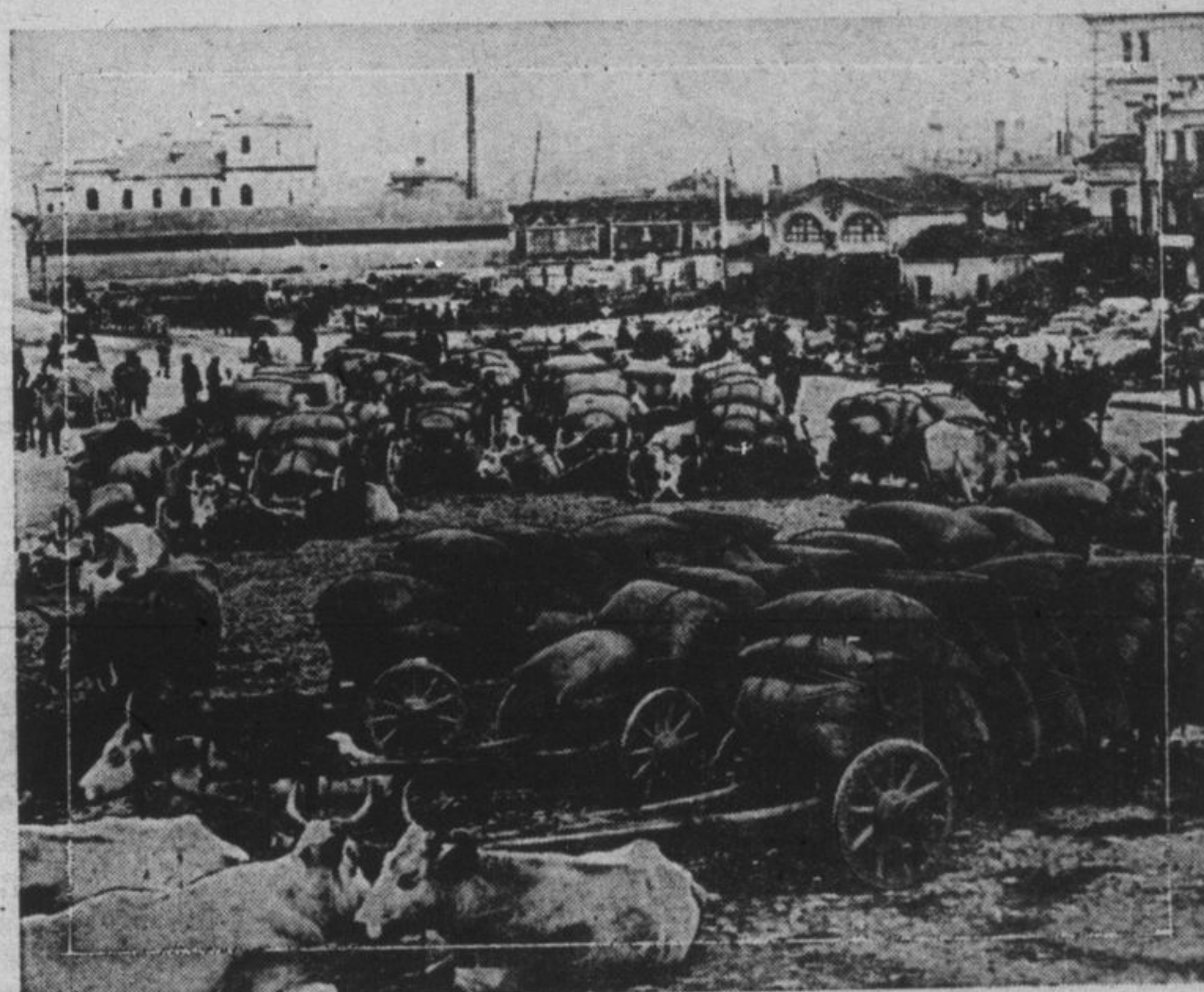
GREAT BLACK SEA PORT COVETED BY THE GERMANS Waterfront at Odessa, where there are six separate harbors forming the "Back-door" of Russia and a gateway to Persia and Central Asia.