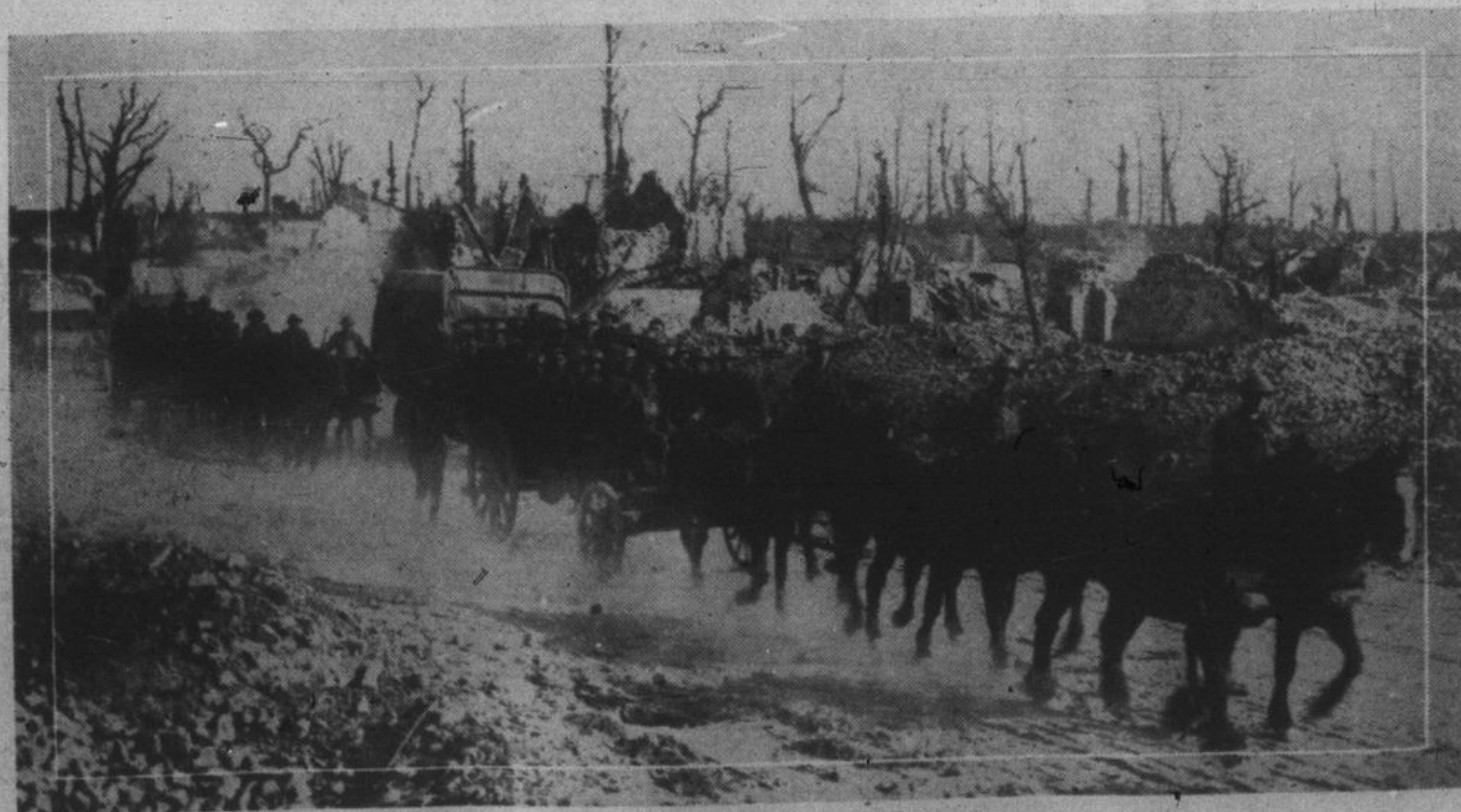
TROOPS ON THEIR WAY TO THE FIRING LINE France is now the scene of many such processions, as soldiers are being rushed towards the firing line.