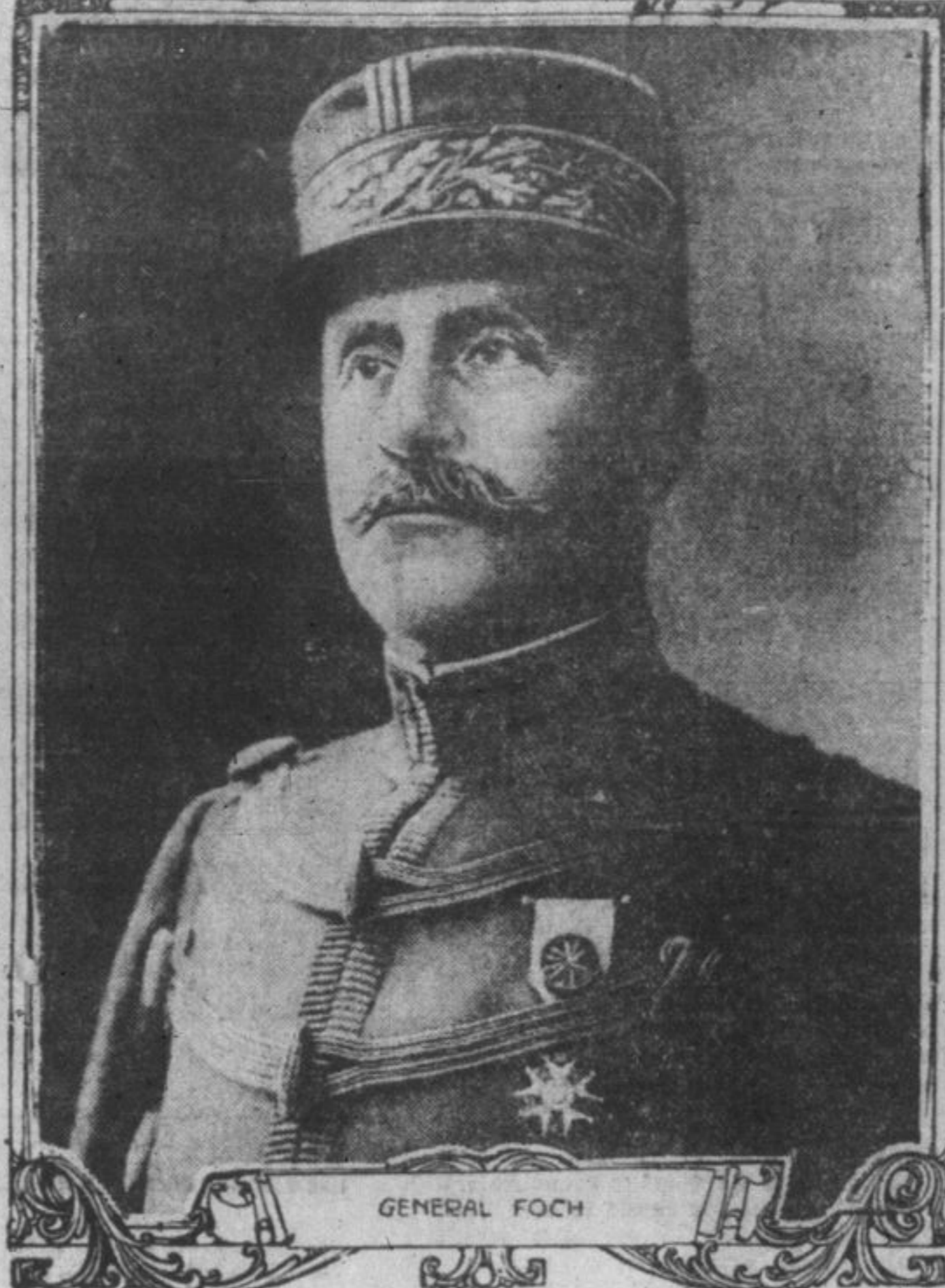
General Foch, Chief of Staff of the French army and commander of the forces that hurled the Germans back from the Marne, has been appointed generalissimo of all the allied armies in France, including the American forces. Hereafter all the forces opposing the Germans on the western front will be united under the supreme command of General Foch. French and American authorities and their delegates to the War Council have urged this step strongly.