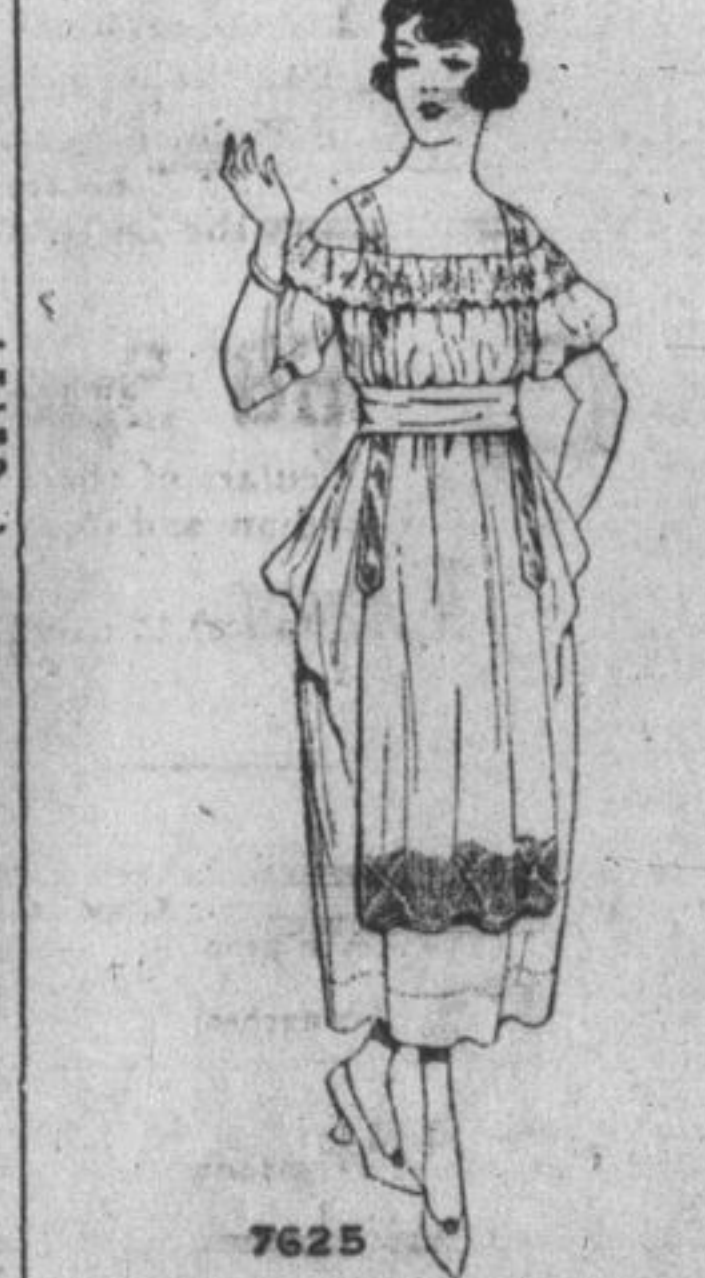
For the jeune fille there is this lovely frock of satin and lace. The lower edge of the front panel is trimmed with beading.

A charming model for an evening dress is given here and it need not be expensive, for there are many pretty silks and satins of American make for the girl who cannot afford to spend much on frocks for formal wear. The skirt is draped and trimmed with a panel at the front. The waist is cut in square effect and has straps over the shoulders, with short one-piece puff sleeves gathered to a lining and sewn to the armholes under the arms. A ruffle of lace finishes the neck. In medium size the costume requires 5 yards 36-inch material, with 1 1/2 yard lace 4 1/2 inches wide for the ruffle and 2 3/4 yards ribbon 2 inches wide for the straps. In addition there will be needed 1 1/2 yard 36-inch lining for the waist, sleeves and foundation back. To begin properly, take the lining and close the under-arm seam as notched. Turn hem in back at notches. Large "O" perforations indicate center-back. Flat lower edge creasing on slot perforations, bring folded edges to corresponding small "O" perforations and stitch 1/4 inch from folds. Adjust 2-inch belting underneath lining at lower edge for a stay. Then, take the outer waist and close under-arm seam as notched. Turn hem in back at notches. Gather upper and lower edges between "T" perforations and gather 2 inches above lower edge. Arrange on lining with center-fronts, center-backs, under-arm seams and corresponding edges even; slash gathers at upper and lower edges to position.