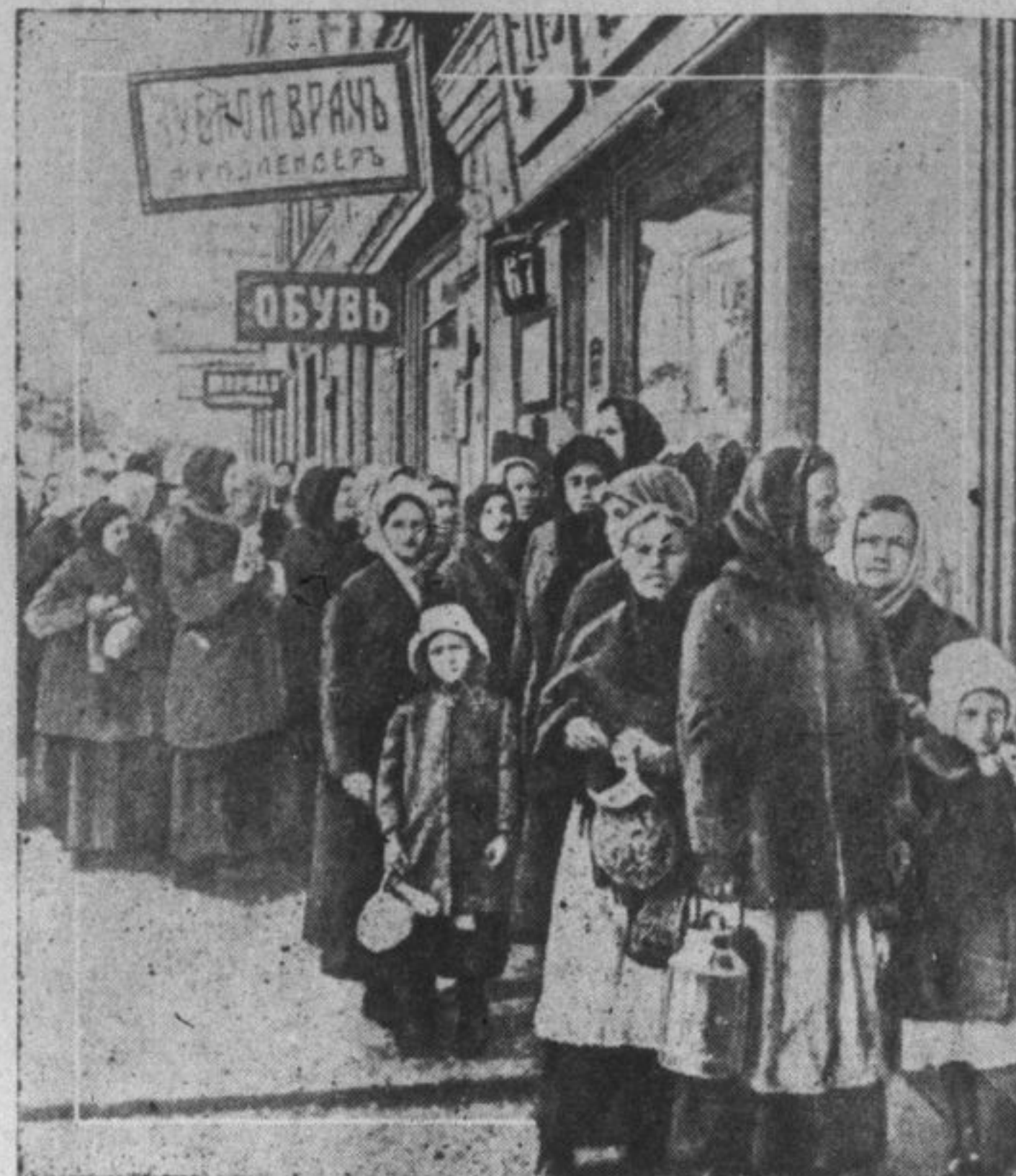
MILK QUEUE IN PETROGRAD. Women in line to secure bare necessities of life.