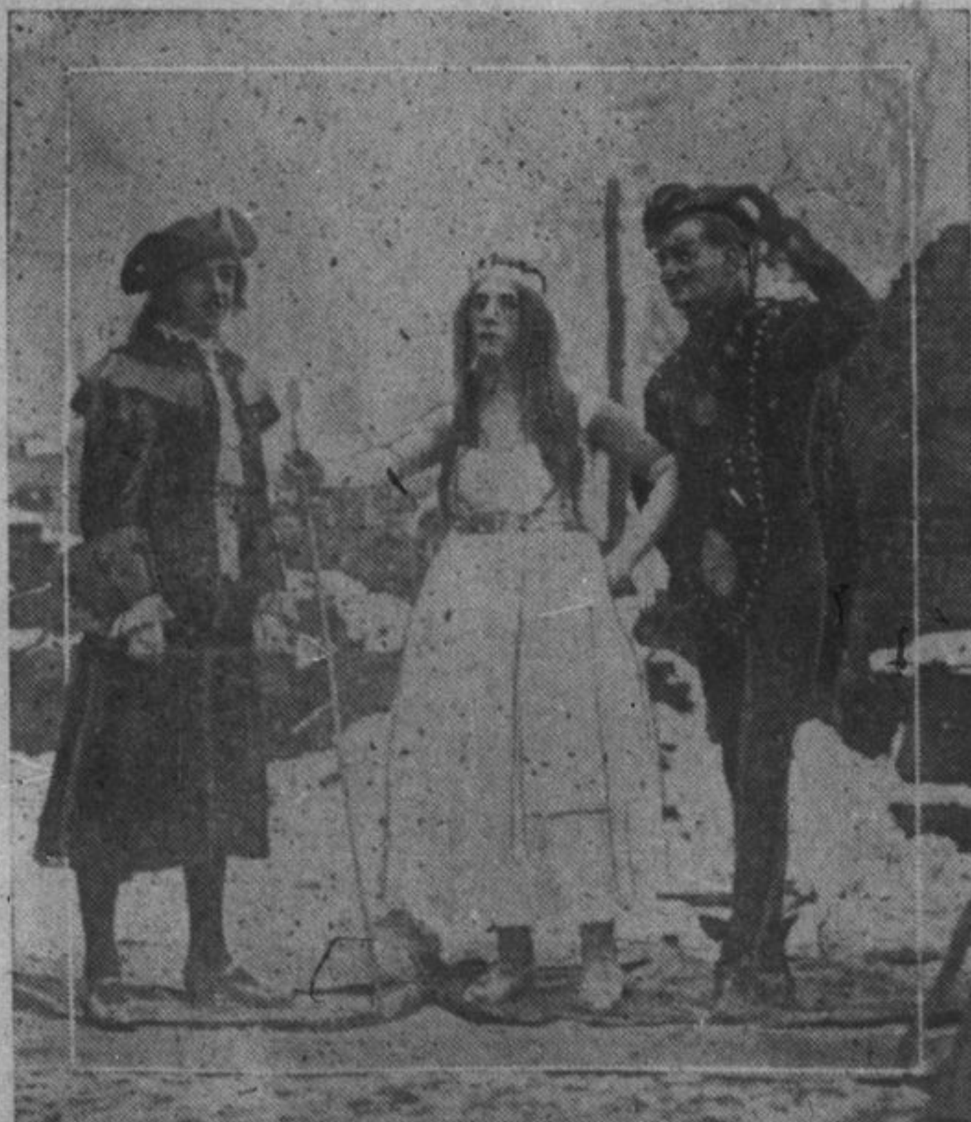
PANTOMIME ON WEST FRONT. Soldiers rehearsing "Cinderella" in the snow.

A British official picture from France, showing soldiers being conveyed by canal barges toward the fighting front.