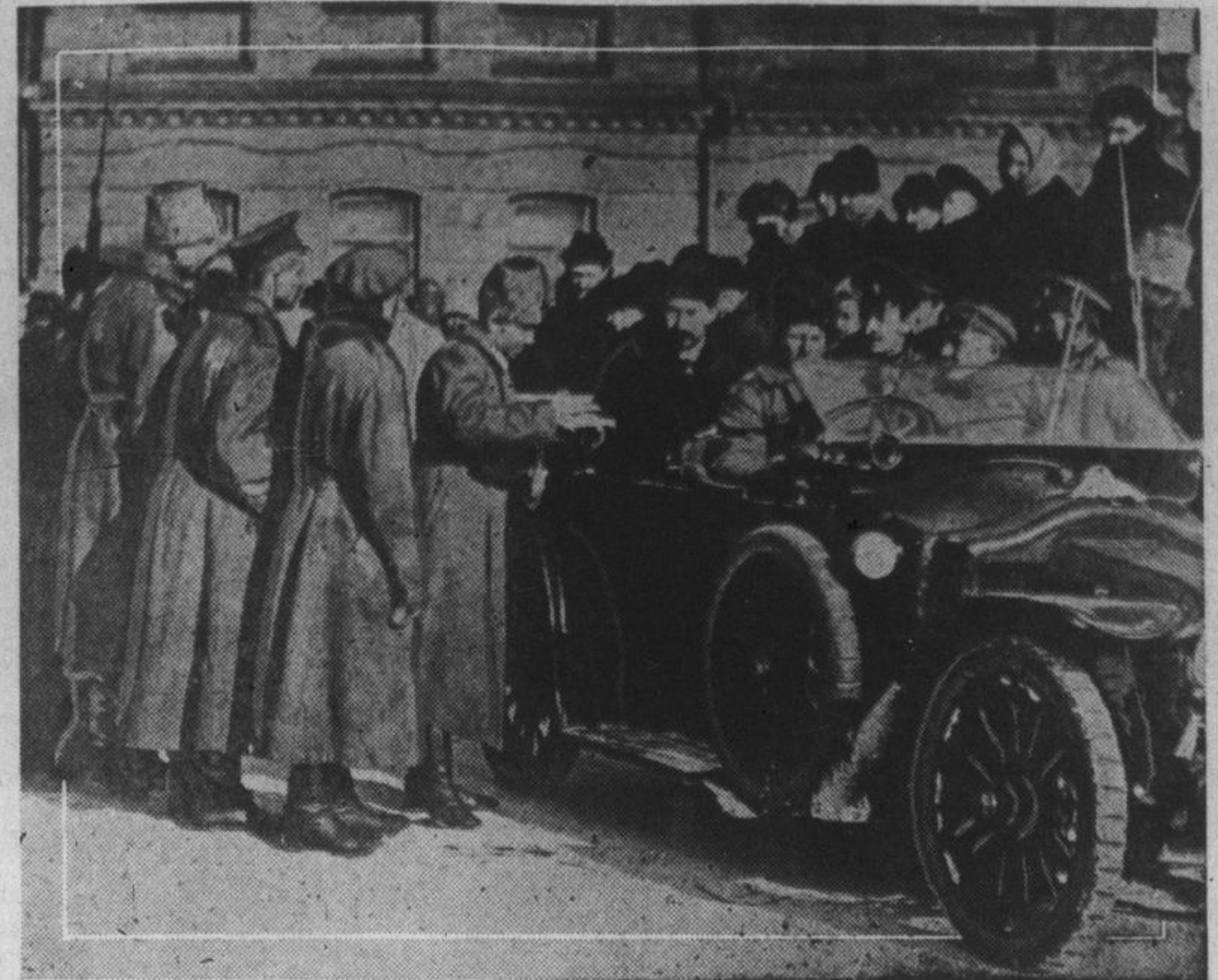
LEON TROTSKY LEAVING A COUNCIL MEETING. Trotsky, the Russian Foreign Minister, seated in the rear seat of the automobile, is receiving a report from several officers. It is reported that Nikolai Lenine, the Bolsheviki Premier, is jealous of Trotsky, who is said to be "the brains" of the Bolsheviki.