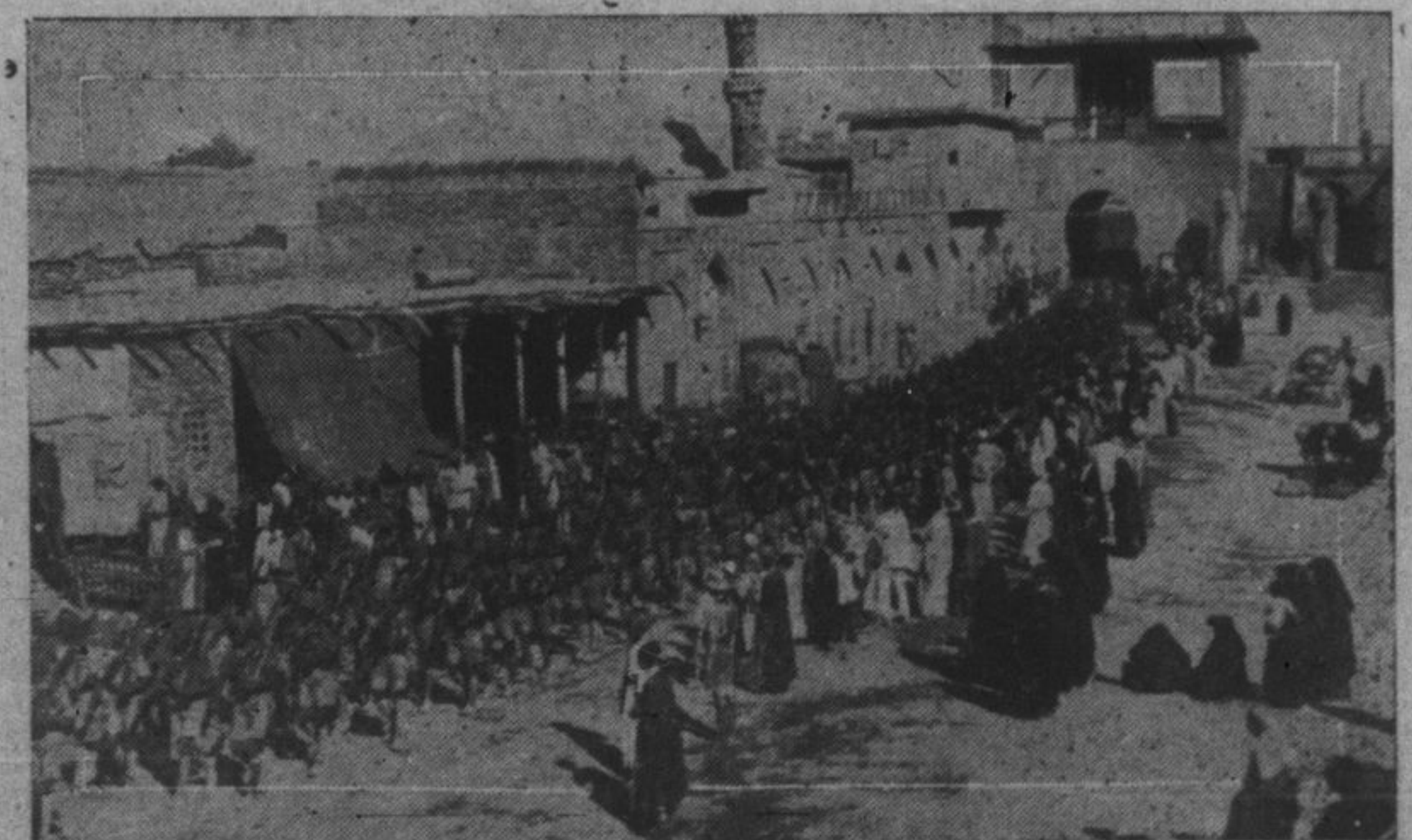
NATIVE TROOPS PASSING THROUGH BAGDAD.

The Bridge of Sighs, a historic spot in ancient Venice, celebrated in song and story. Hun aviators during the last few days have dropped many bombs on Venice.