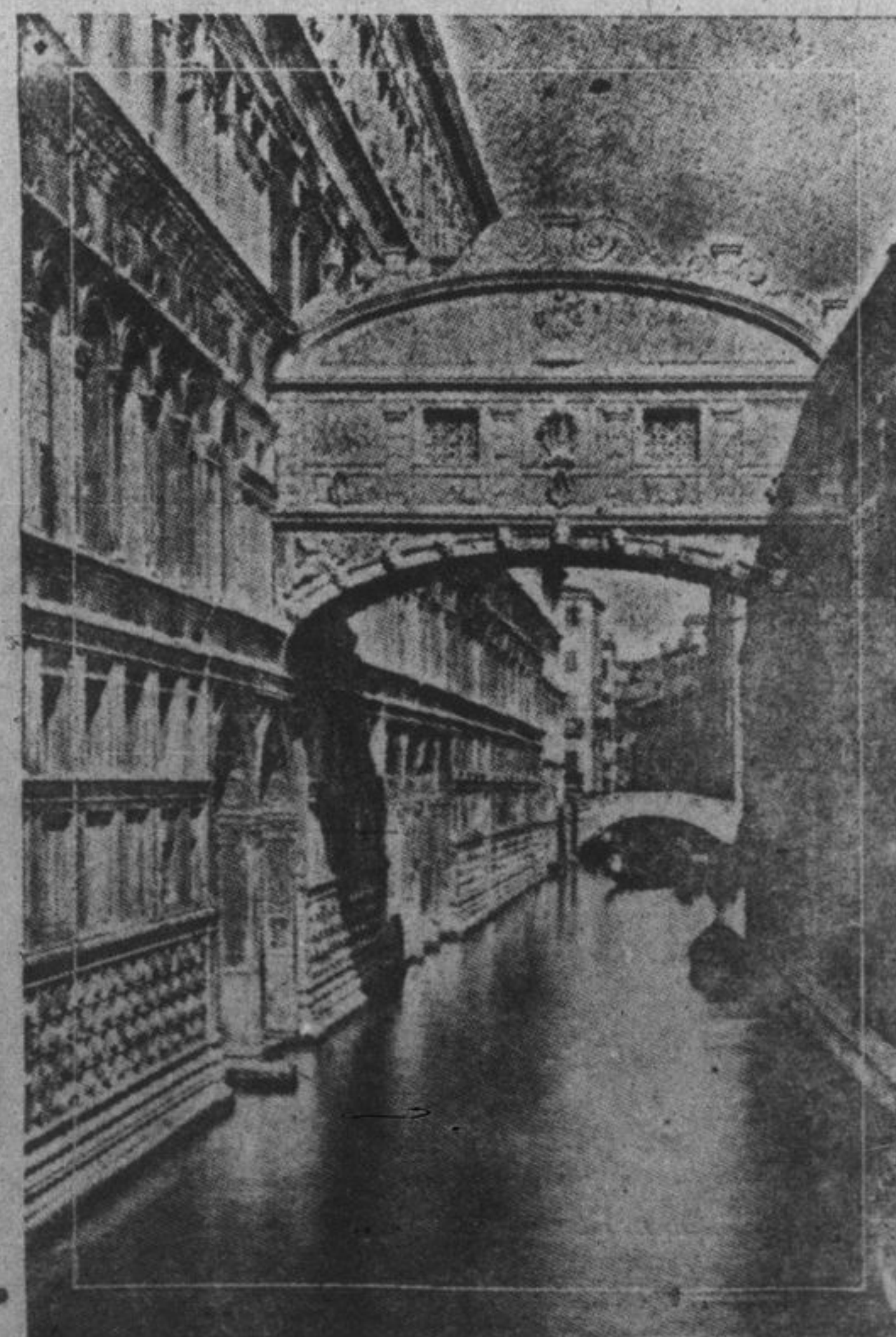
WORLD SHRINE ENDANGERED.

The Bridge of Sighs, a historic spot in ancient Venice, celebrated in song and story. Hun aviators during the last few days have dropped many bombs on Venice.