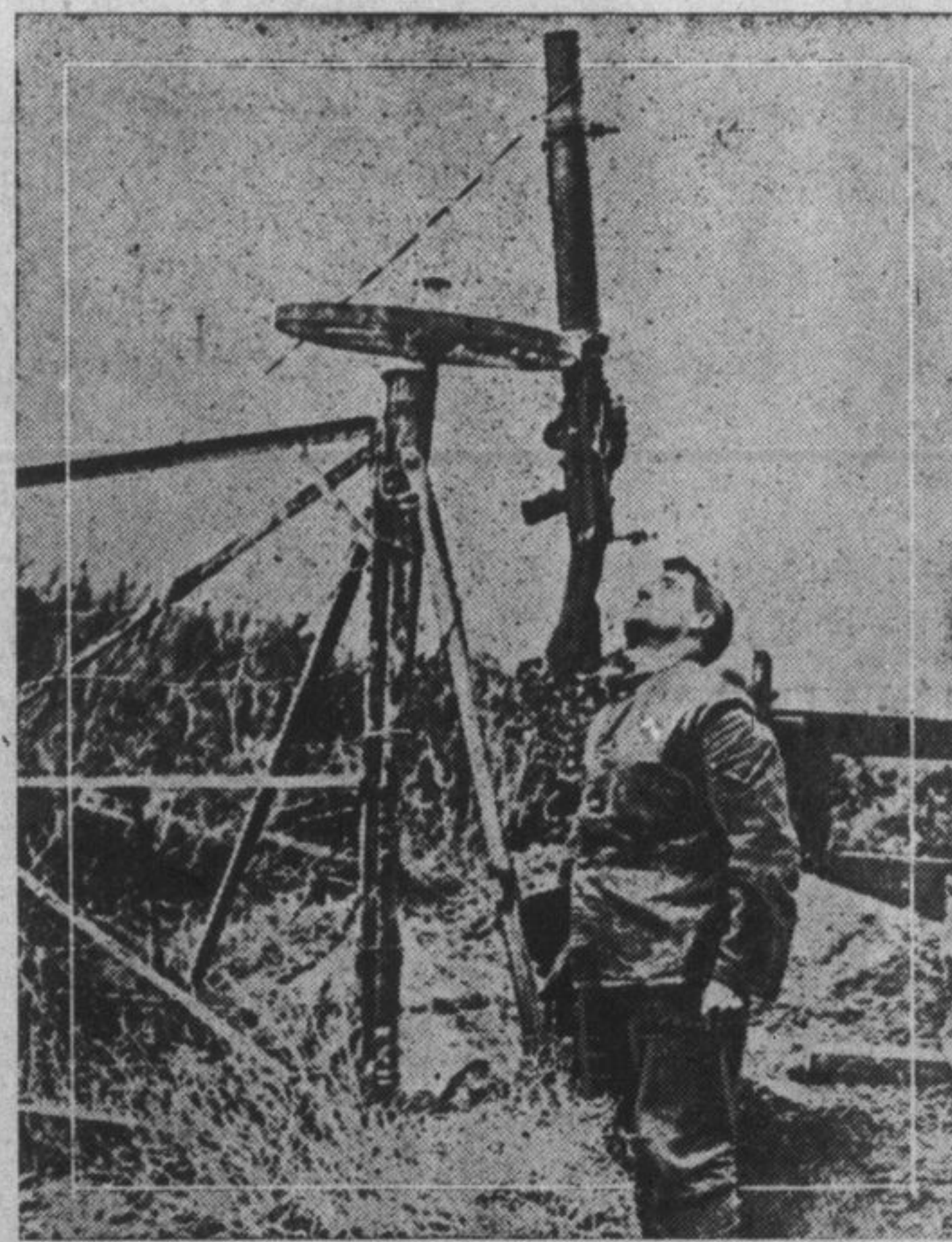
TO FIGHT AIRPLANES.

This picture, from a British official photo shows a novel adaptation of the light machine gun to anti-aircraft work. A wheel is fixed to a pole driven into the ground. The gun is then attached to the rim of the wheel so that it points almost straight up, and can be speedily swung around to any position to keep the speeding enemy plane in range.