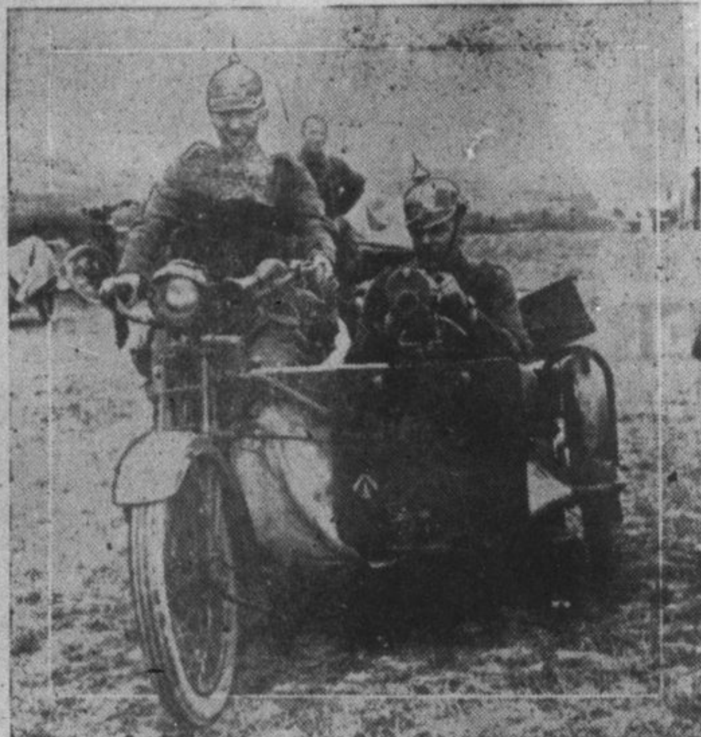
THE SPOILS OF WAR.

British motor machine gunners wearing helmets captured during engagements with the Huns.