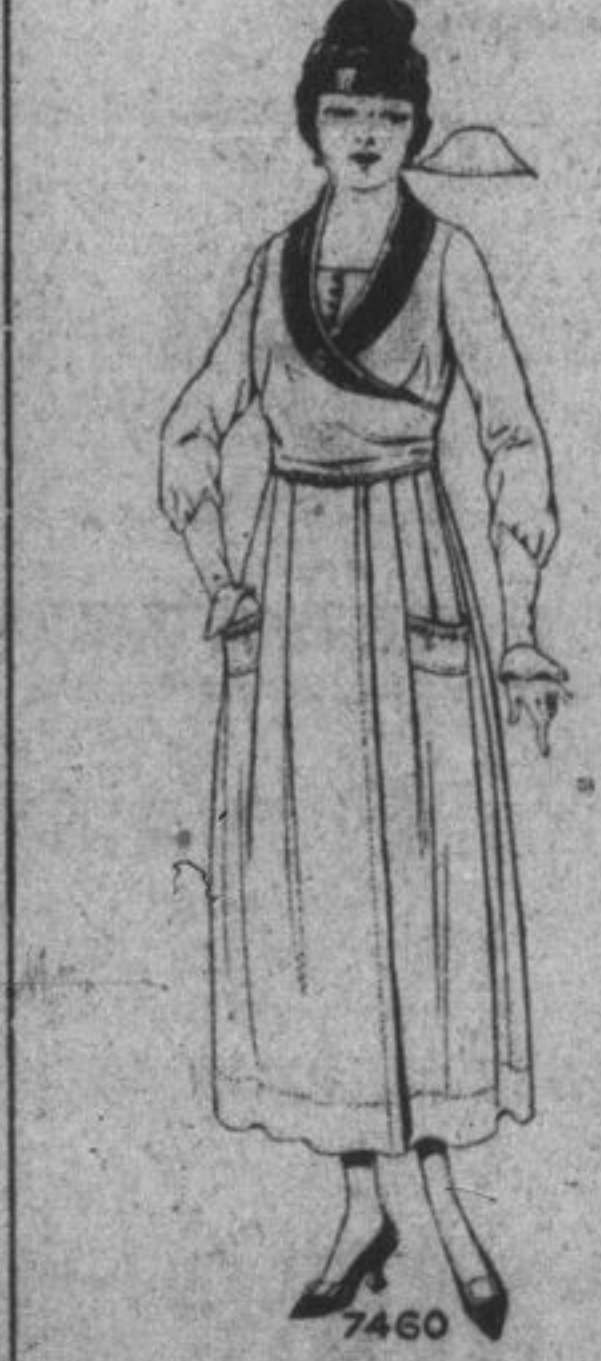
A smart little frock in blue wool poplin with deep shawl collar of aia. Attached to the draped waist is a plaited skirt trimmed with p....

This frock may be smartly carried out in blue wool poplin, the deep collar being in satin of self or contrasting color. White or cream color chiffon should be used for the vest, trimmed with tiny buttons. In medium size the costume requires 4 1/2 yards 44-inch material, with 3/4 yard satin for the collar.