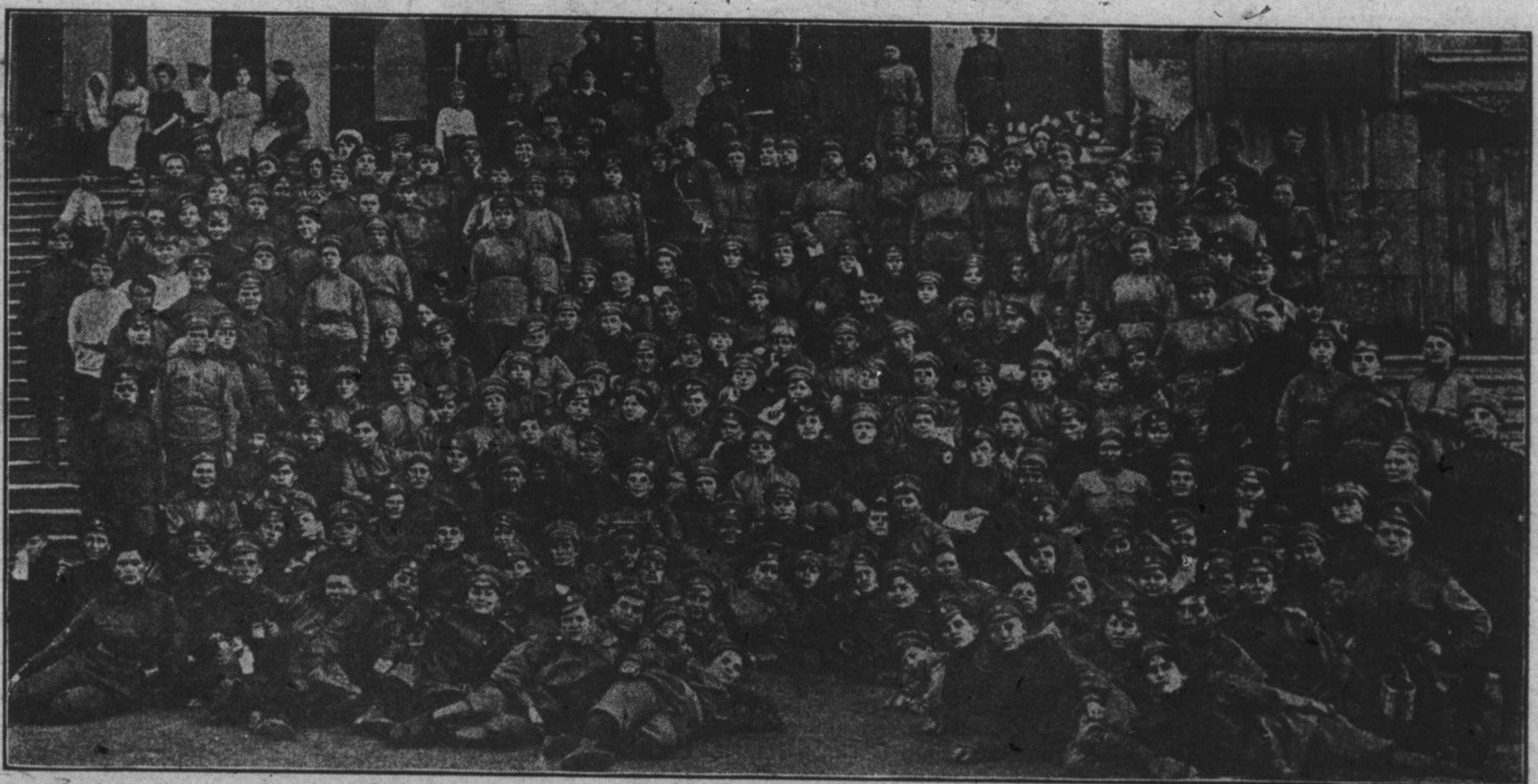
Russian girl soldiers of the "Battalion of Death" assembled in front of their barracks at Tsarakoo Selo, fifteen miles south of Petrograd, the seat of two former Imperial palaces. The "Battalion of Death" remained loyal to the last to the Kerensky Provisional Government and the Allies, has never been disbanded, and is still counted as an effective military unit.