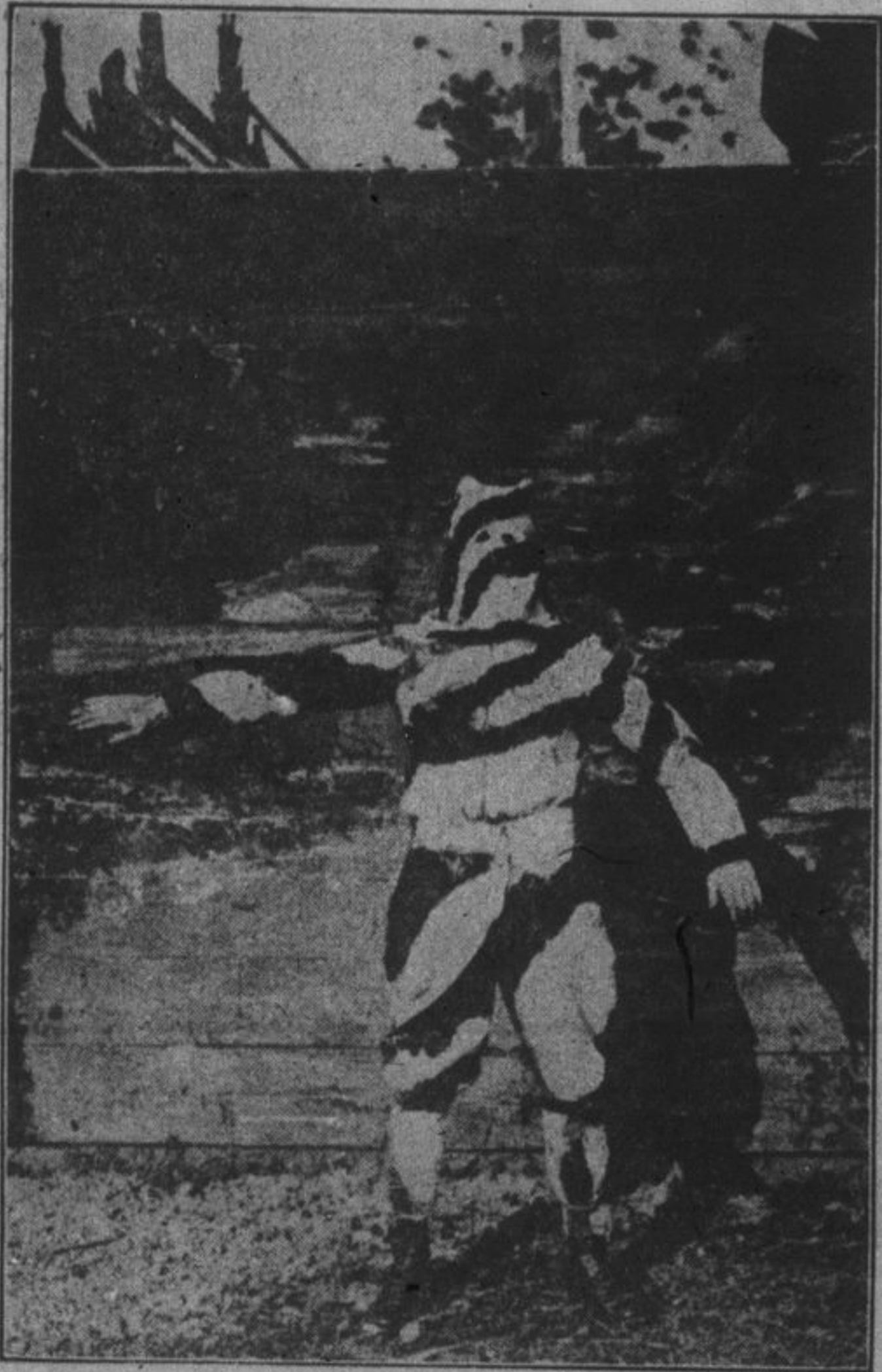
Uniform adopted for American military observers when tree climbing. A camouflage study in black and white.