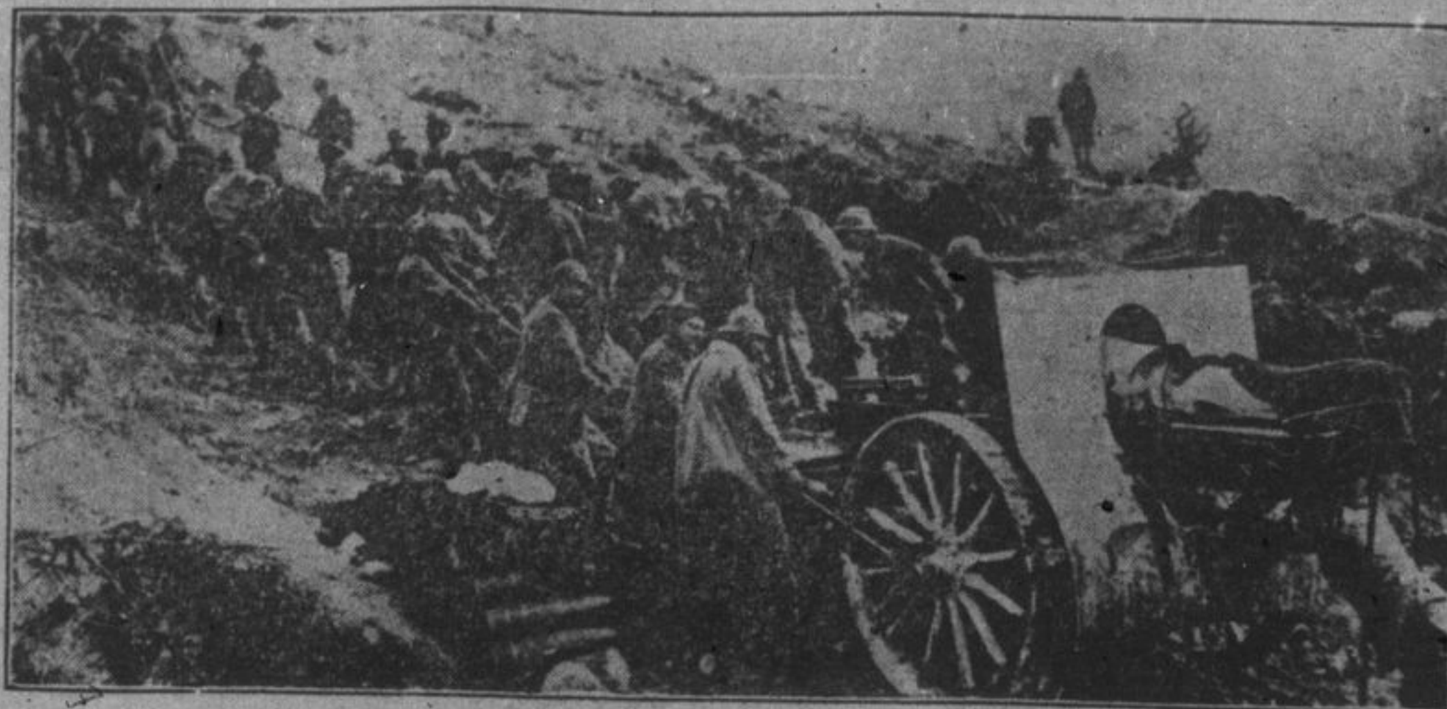
French soldiers in force dragging into position one of their heavy field pieces, military critics attributing the French victory in the Battle of Chemin des Dames to the rapidity with which guns of this and even larger calibre were brought into action.