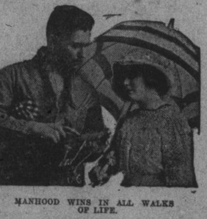
MANHOOD WINS IN ALL WALKS OF LIFE.

completely develop or mature this same vigorous strength, no matter what his past may have been, provided he is willing to REALLY MAKE THE EFFORT, and down by extreme old age or is not incurably diseased. To my mind, the road of the one who wants manly strength is perfectly plain, but it is a road that any man MUST travel if he attains the highest ideals in this respect. See information in my free book. As to the SANDEN Vitalizer, previously mentioned, will say it is a little device, which you wear at night. This Vitalizer generates and sends forth a certain soft, penetrating force which I call Vitality. It drives this Vitality into your nerves, blood, muscles, and organs as you sleep. It is quieting to the nervous system—or, at least, so users say. Men write that it takes pain out of the back often at once, and restores vitality strength in 90 days. Remember, the general information of the free book is independent of this Vitalizer, and you are not expected to get one of these little appliances unless you want to. You can write me later as to that, if you so desire. With special women as well as men for rheumatism, kidney, liver, stomach, bladder disorders, etc. If you live in or near this city I should be most pleased to have you call in person at my office, where you may see the Vitalizer free of charge, and receive my book sealed, by return mail. If you live elsewhere, please do not fail to write for the free booklet. Satisfaction guaranteed in every case.