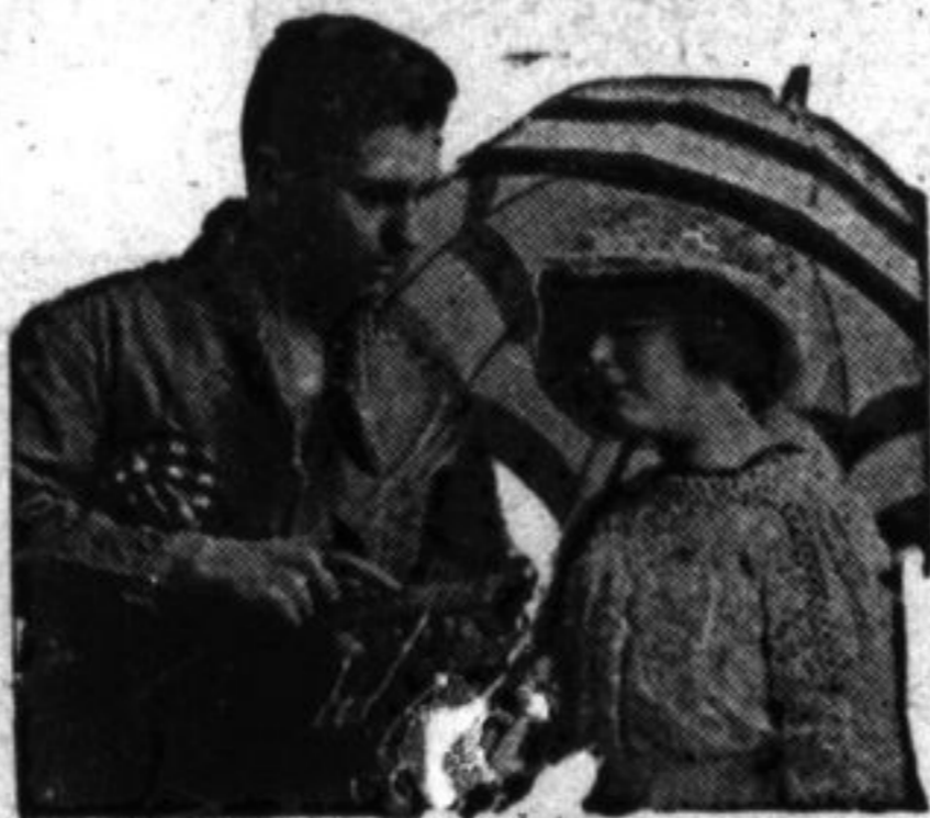
MANHOOD WINS IN ALL WALKS OF LIFE.

MR. READER: Here is something we have to offer you absolutely for nothing—a little private book of special information about the legitimate uses and unusual abuses of manly strength; about the preservation and its possible self-restoration, an illustrated pocket compendium of 8,000 words, 72 pages and 20 half-tone photographs, reproductions—which I am very pleased to send by mail, absolutely free of charge, in a plain sealed envelope, to any man, young or elderly, single or married, who writes for it.