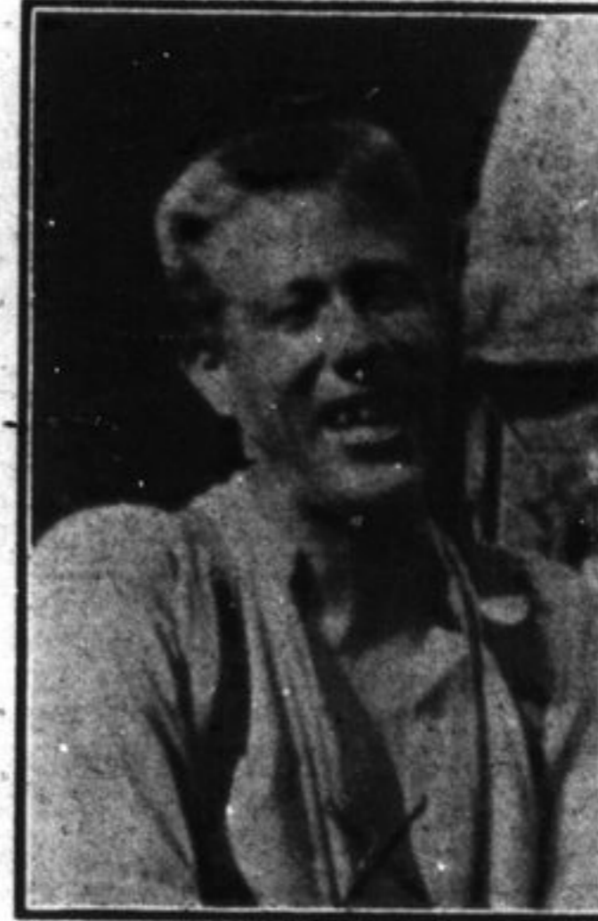
A photo of German prisoners taken at the Somme. This photo was in possession of a German when captured. He was not then wearing the same smile. The picture was brought home by a Kingston soldier.