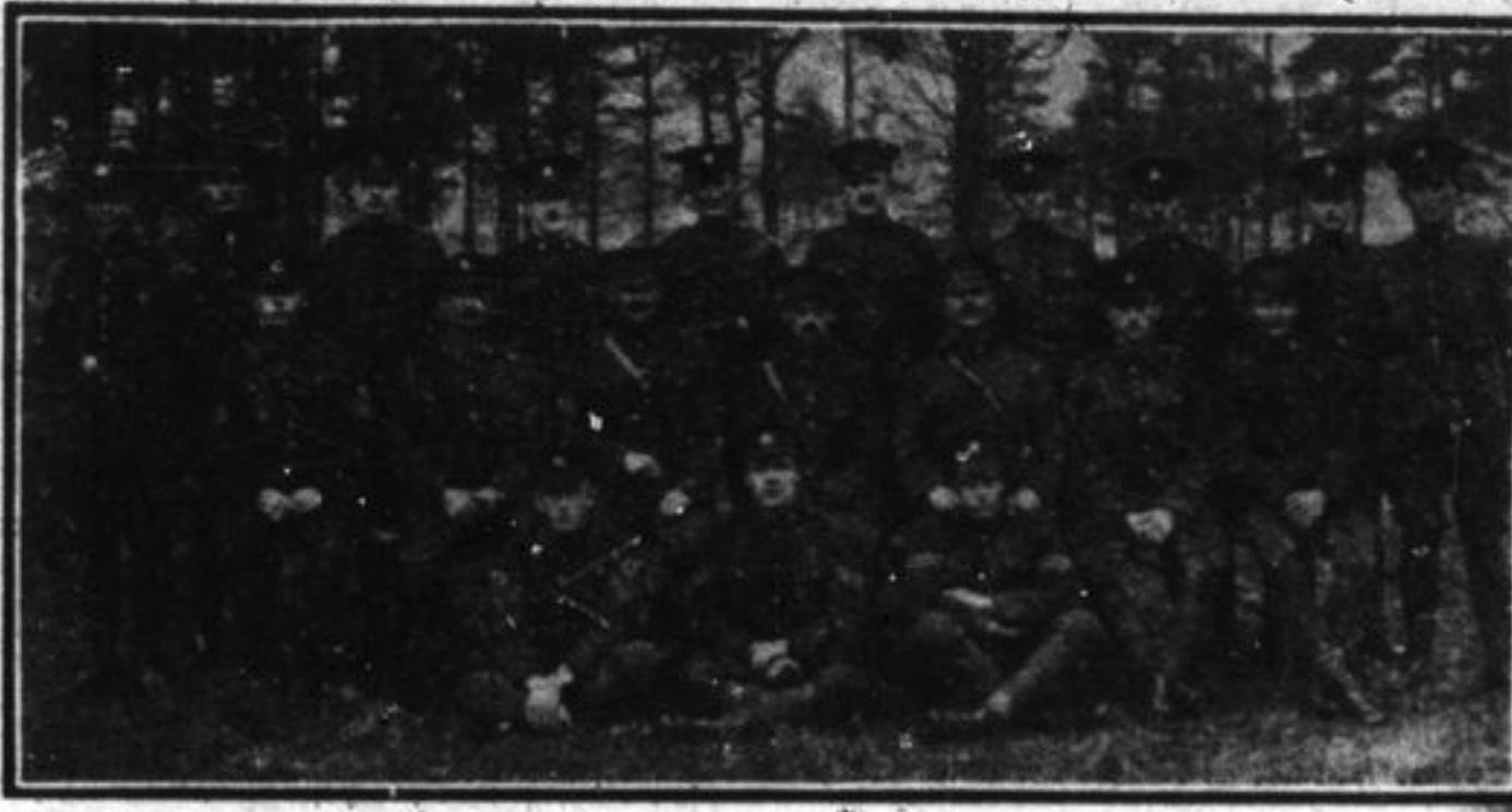
Sergeants' Mess, 15th Canadian Field Ambulance (Queen's) now on active service in France.