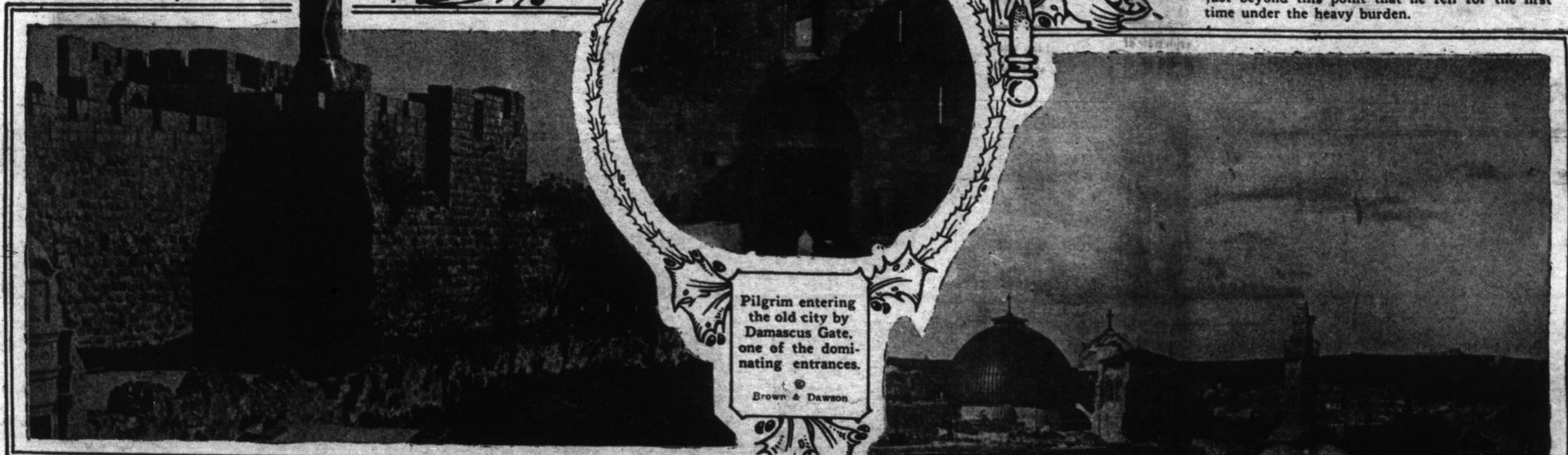
Pilgrim entering the old city by Damascus Gate, one of the dominating entrances.