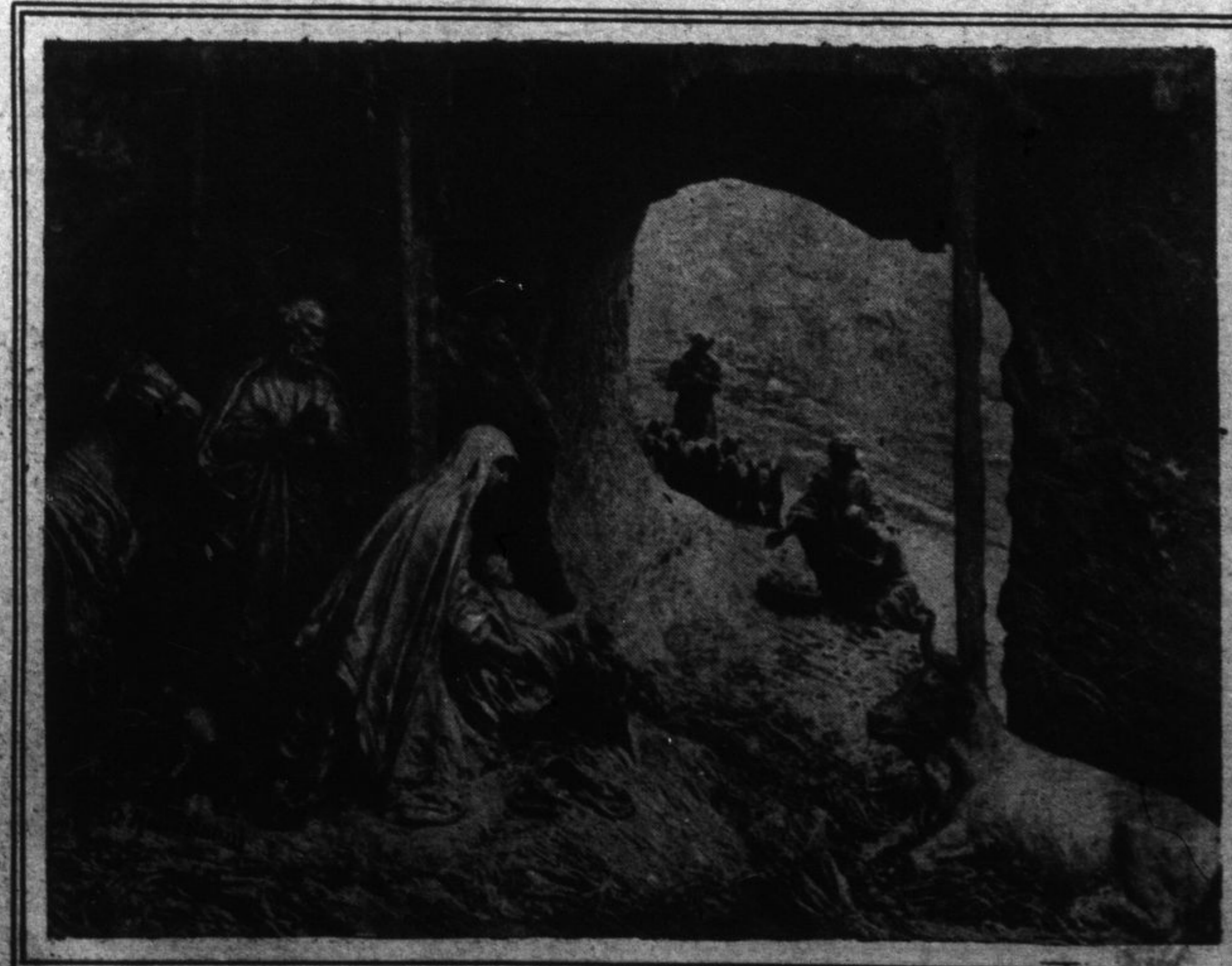
The shepherds at the manger in Bethlehem—"and the angel said unto them, * * * And this shall be a sign unto you. Ye shall find the babe wrapped in swaddling clothes, lying in a manger." St. Luke, ii. 10, 21, 22.