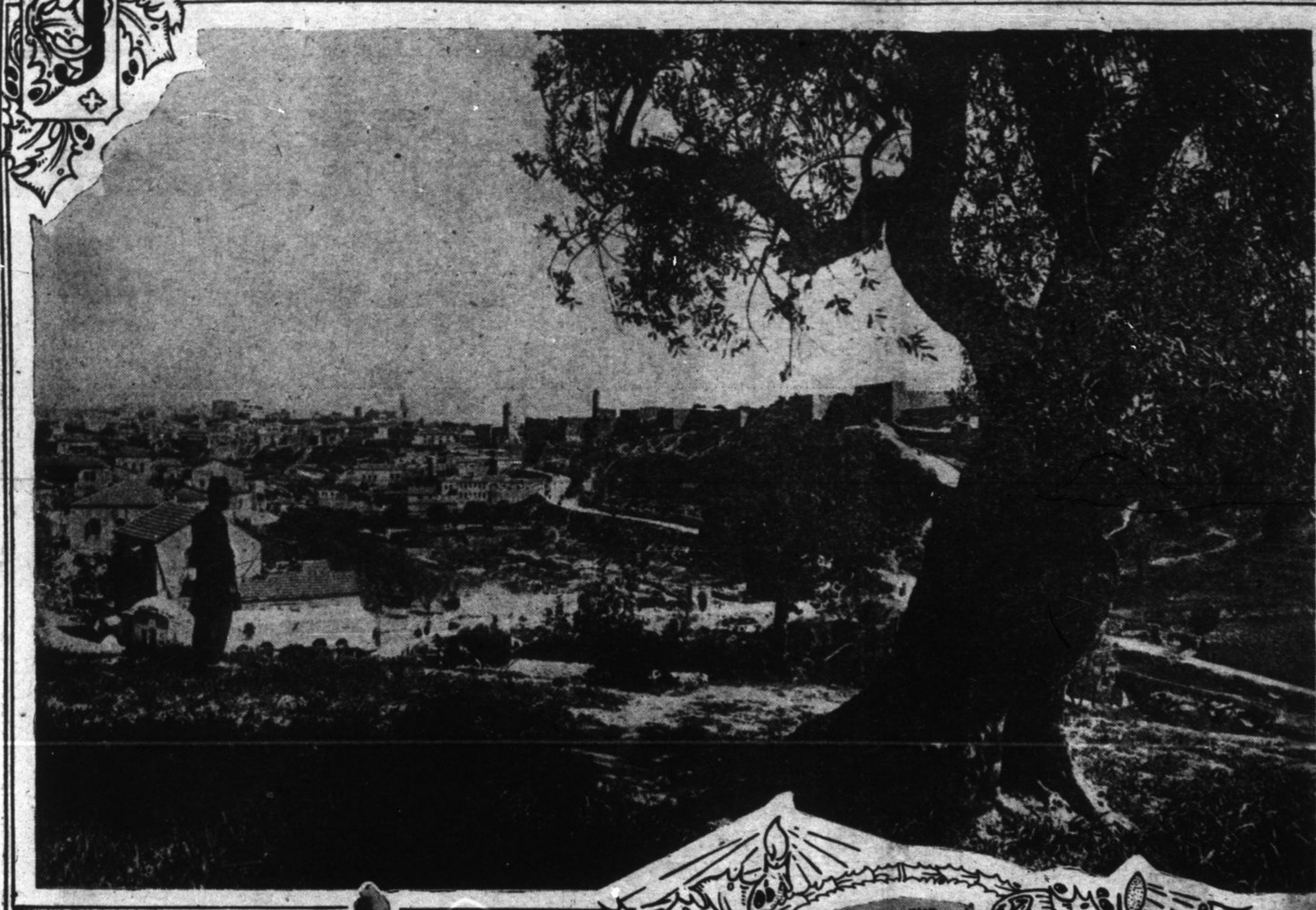
The Holy City as seen from the Mount of Olives, looking across the Kedron Valley, with the city wall showing to the right.