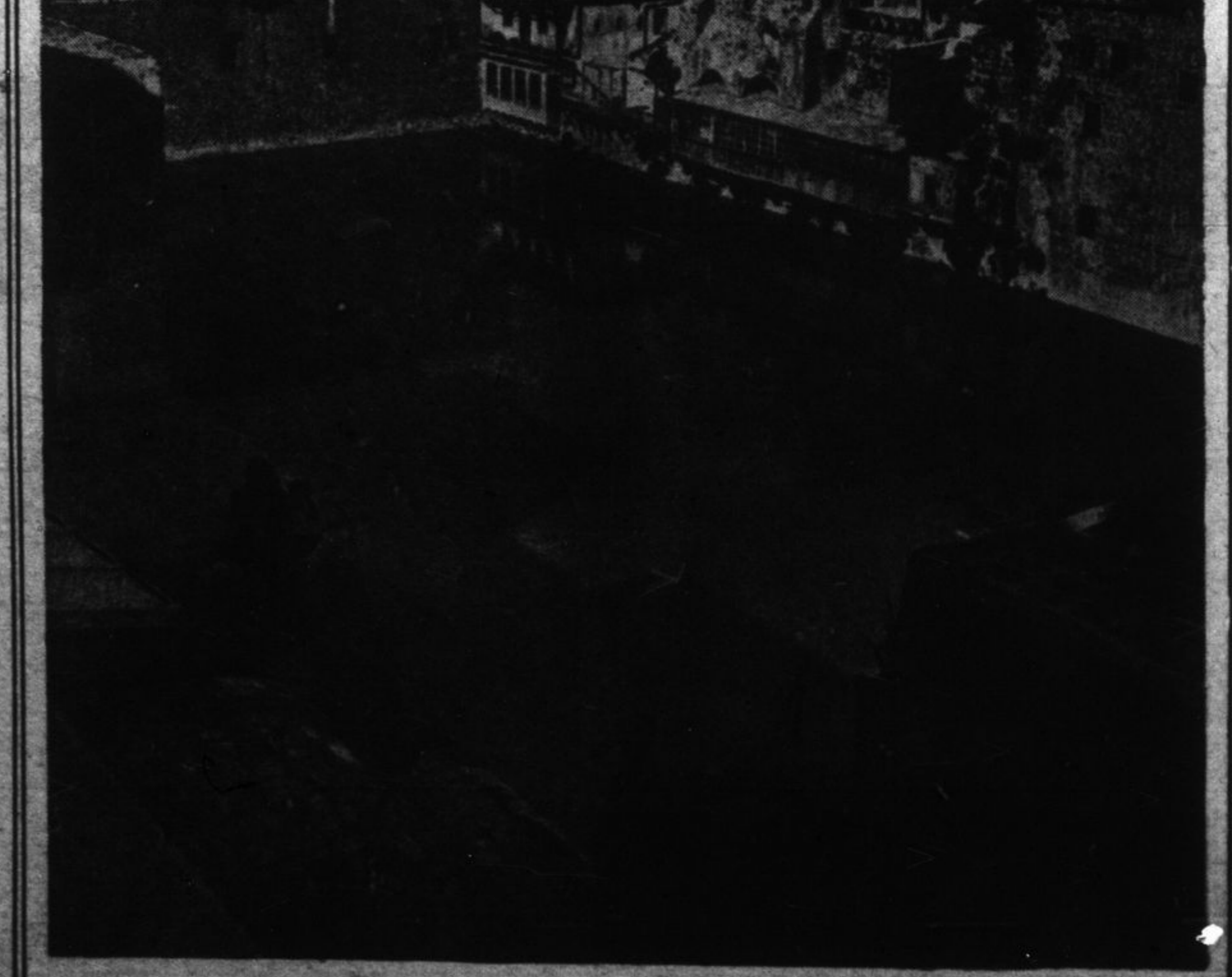
The Pool of Hezekiah, named in honor of the pious King of Judah, who prayed for divine intervention when the Assyrians attacked his city. The Lord answered his prayer by sending an angel who slew "a hundred and fourscore and five thousand" of the enemy.