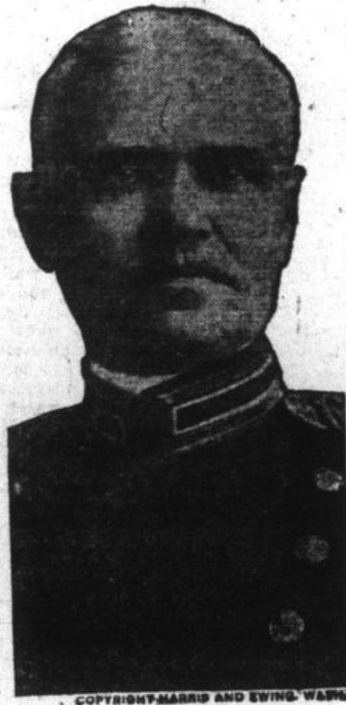
MAJOR-GENERAL GOETHALS has been recalled to active service and detailed as acting superintendent-general to succeed Major-General Sharpe, detached by Secretary Baker to serve as a member of United States war department's new war council.

Over 1,200 invalided Canadian soldiers who arrived at an American port Wednesday are on their way to Montreal by special trains.