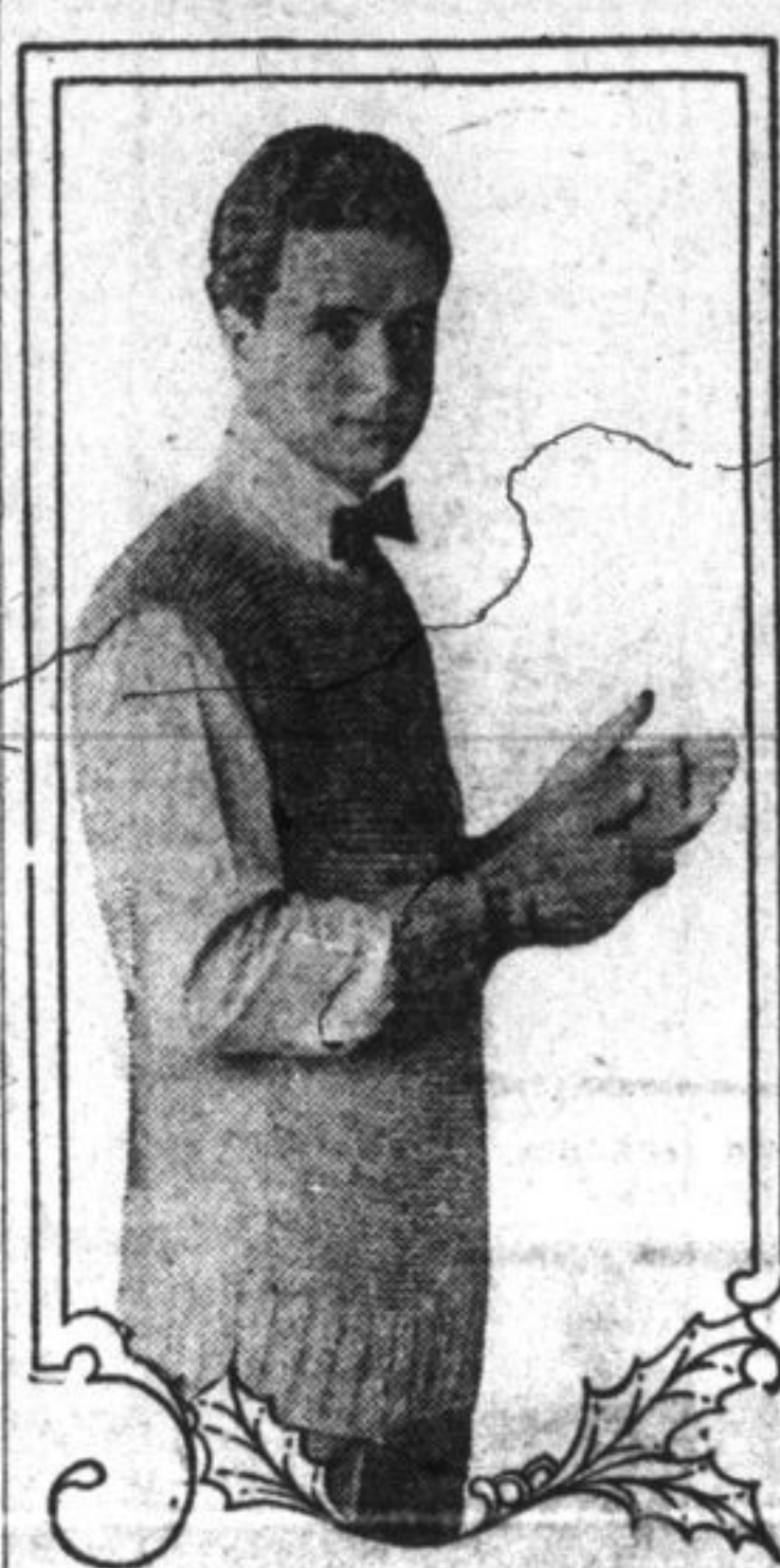
Body-Building Power of Bovril taken.

A CHRISTMAS gift that can't be used and enjoyed is a disappointment. The average man or woman would rather receive a post card with a cheerful "Merrie Christmas" on it than a gift that is just perfunctory. The war has made us all alert this year for the cheer and welfare of our