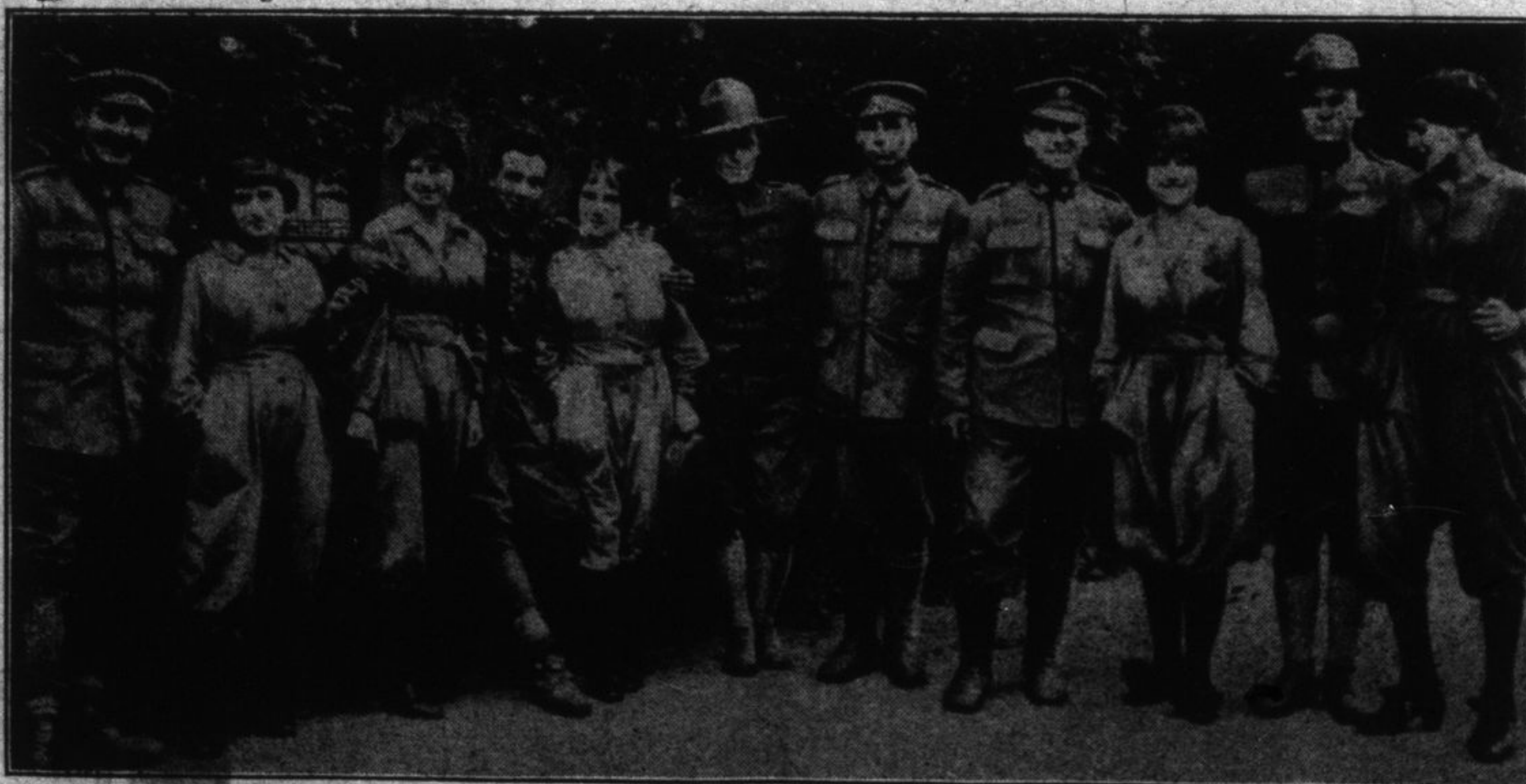
American and Canadian soldiers quick to make friends with fair 'Munitionettes' in one of the great ammunition-plants near Paris.