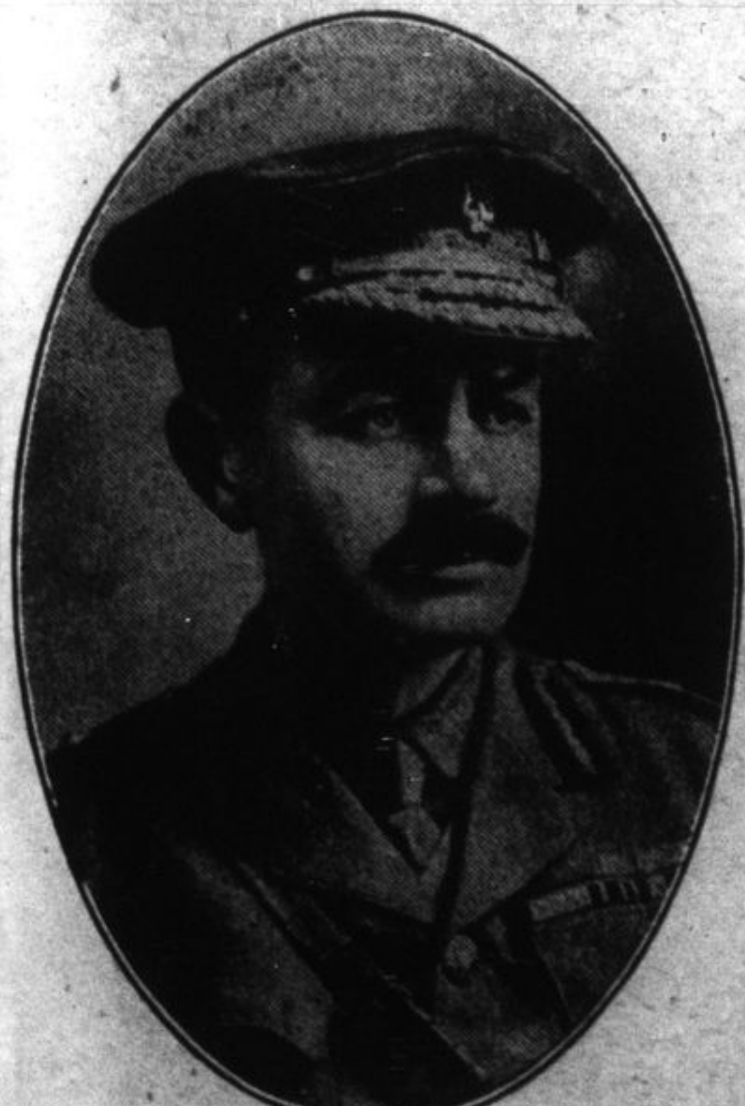
General the Honorable Sir Julian Byng, who commanded the British in their great victory over the German forces on a thirty-mile front before Cambrai, winning thereby the full rank of general.