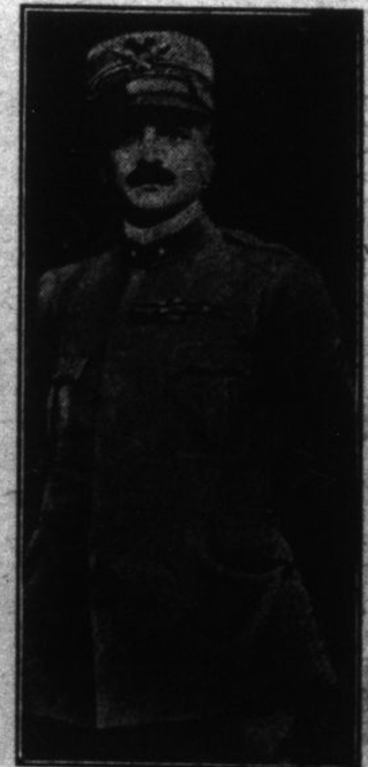
General Diaz, new commander-in-chief of the Italian Armies, succeeding General Cadorna.