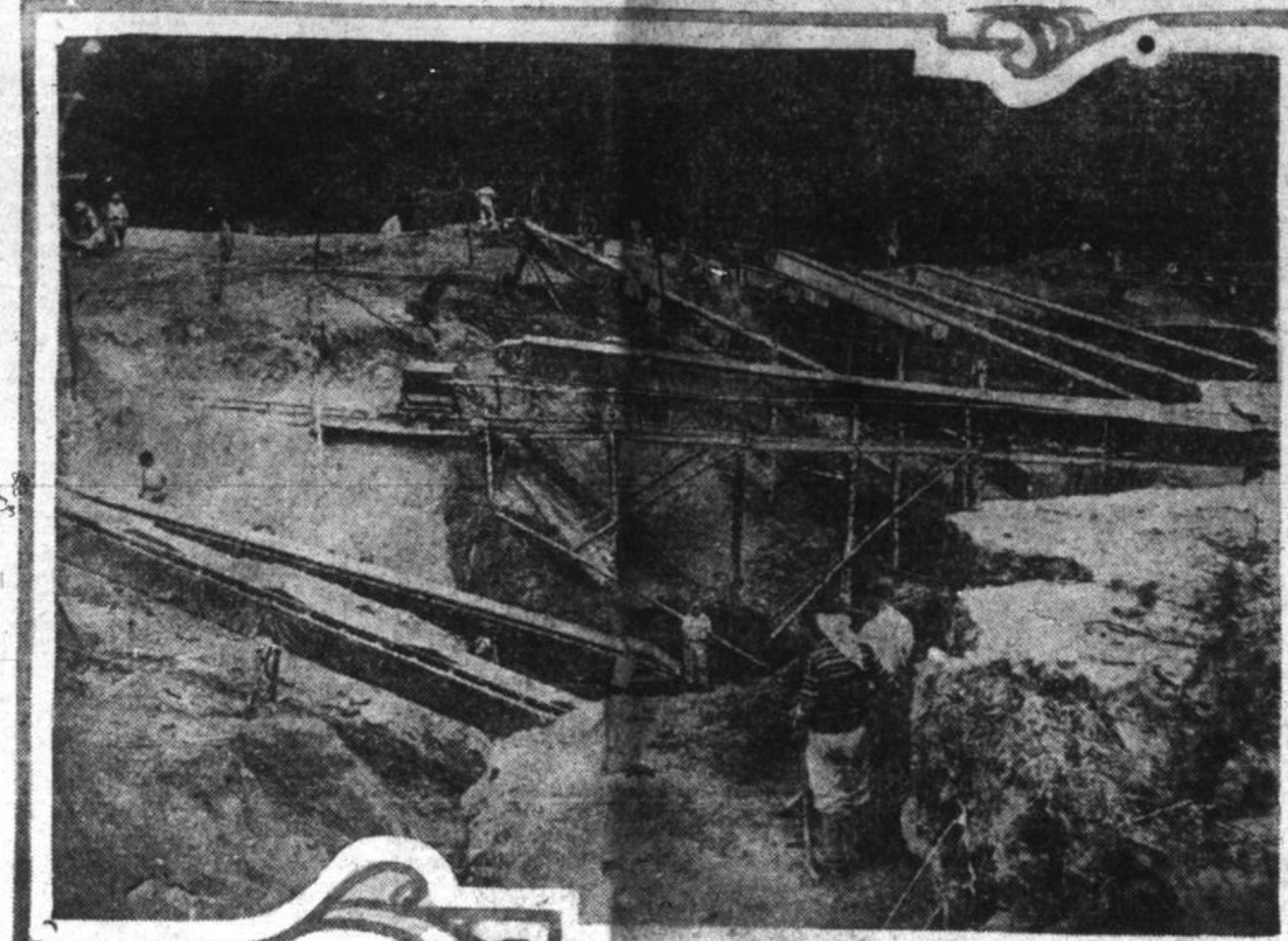
The enormous amount of sand used is made evident by the great machinery employed for its excavation.