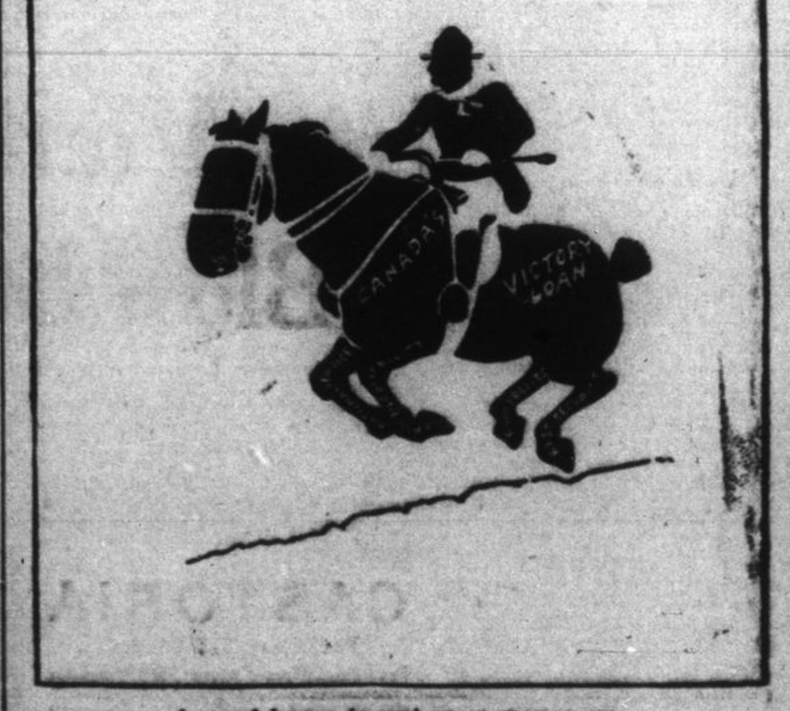
A good horse to put your money on.