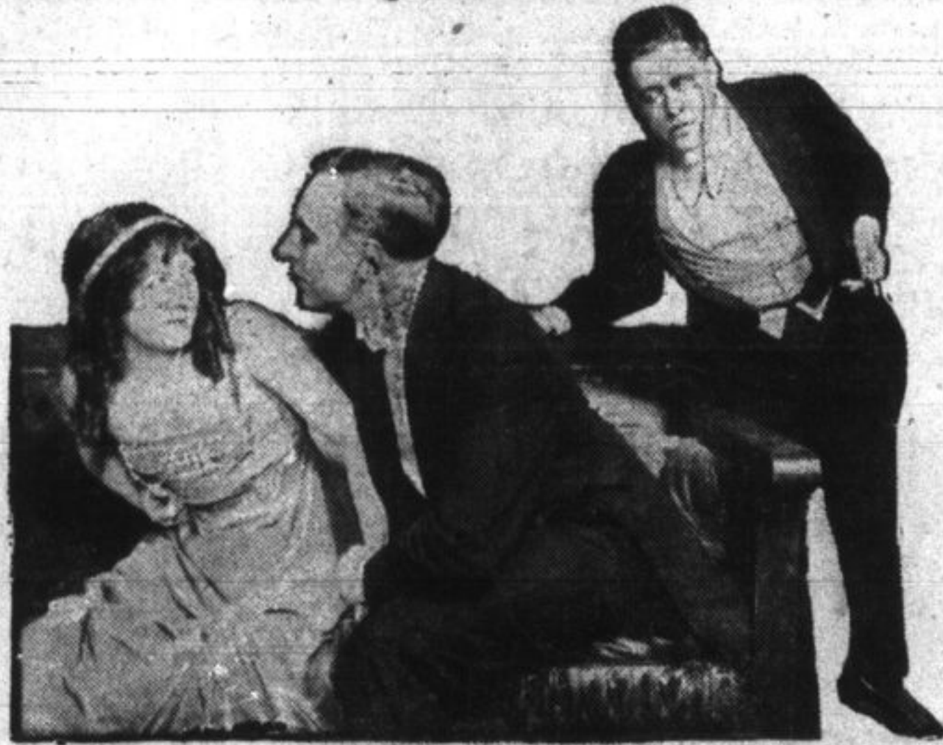
Scene in My Irish Cinderella at the Grand Opera House next Thursday, Nov. 8th.