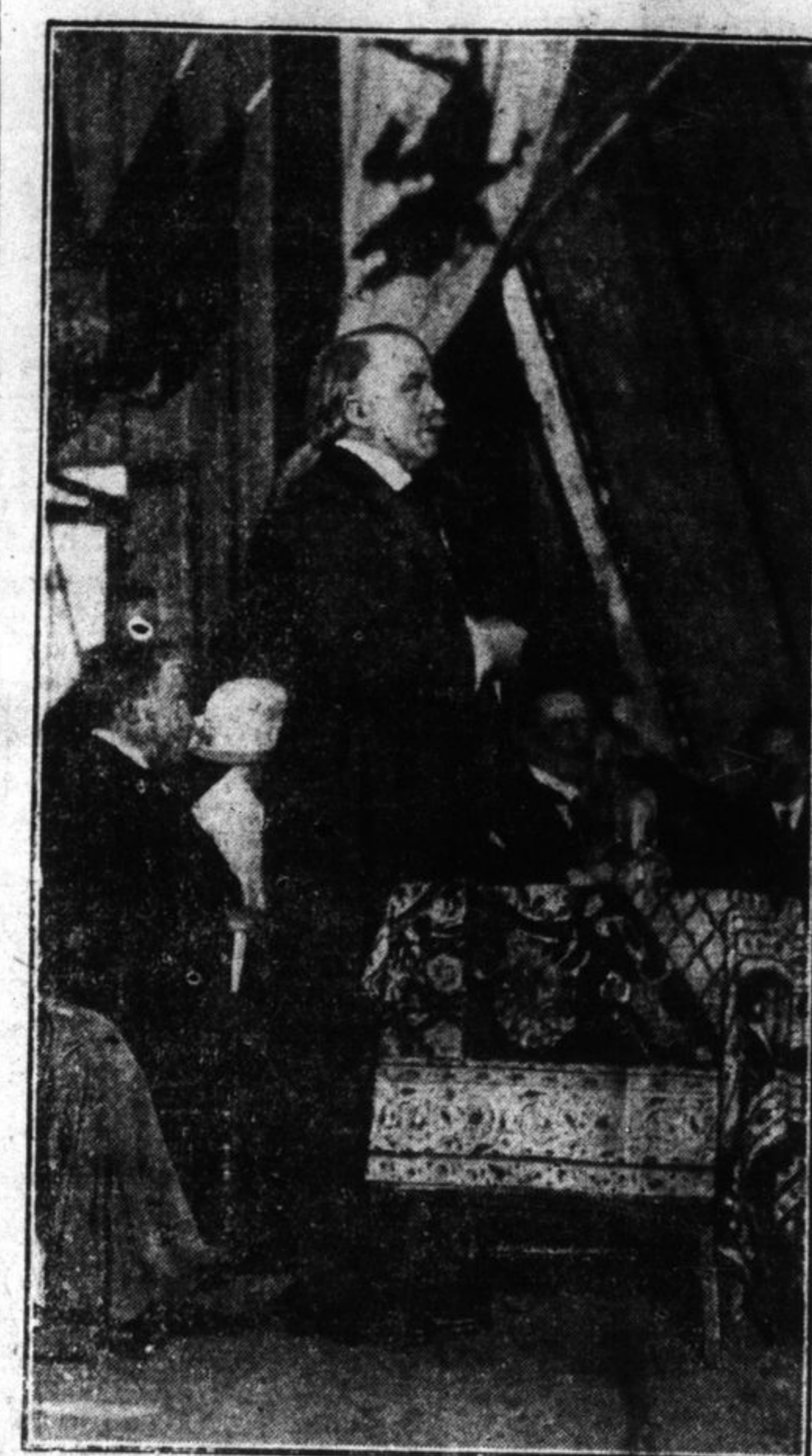
Lloyd George drew a moral from the Eisteddodfod which he addressed at Birkenhead, Sept. 6th. The first condition for the work of this ancient institution, he said, was that all differences should be sunk and that it had a lesson for this tremendous hour of fate...