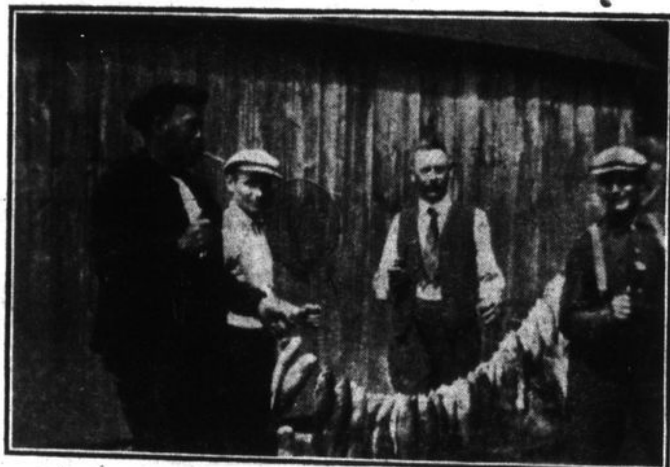
ARE THE BASS BITING ?