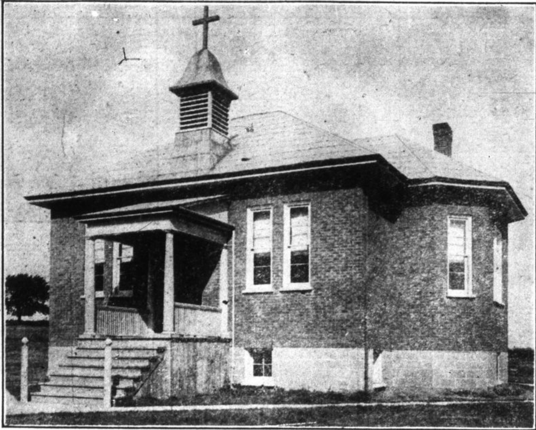
St. Joseph's School, No. 8, Otonabee, winner of the Thompson Trophy for school agriculture and horticulture.

Having been won three years in succession, the trophy is now the property of St. Joseph's School.