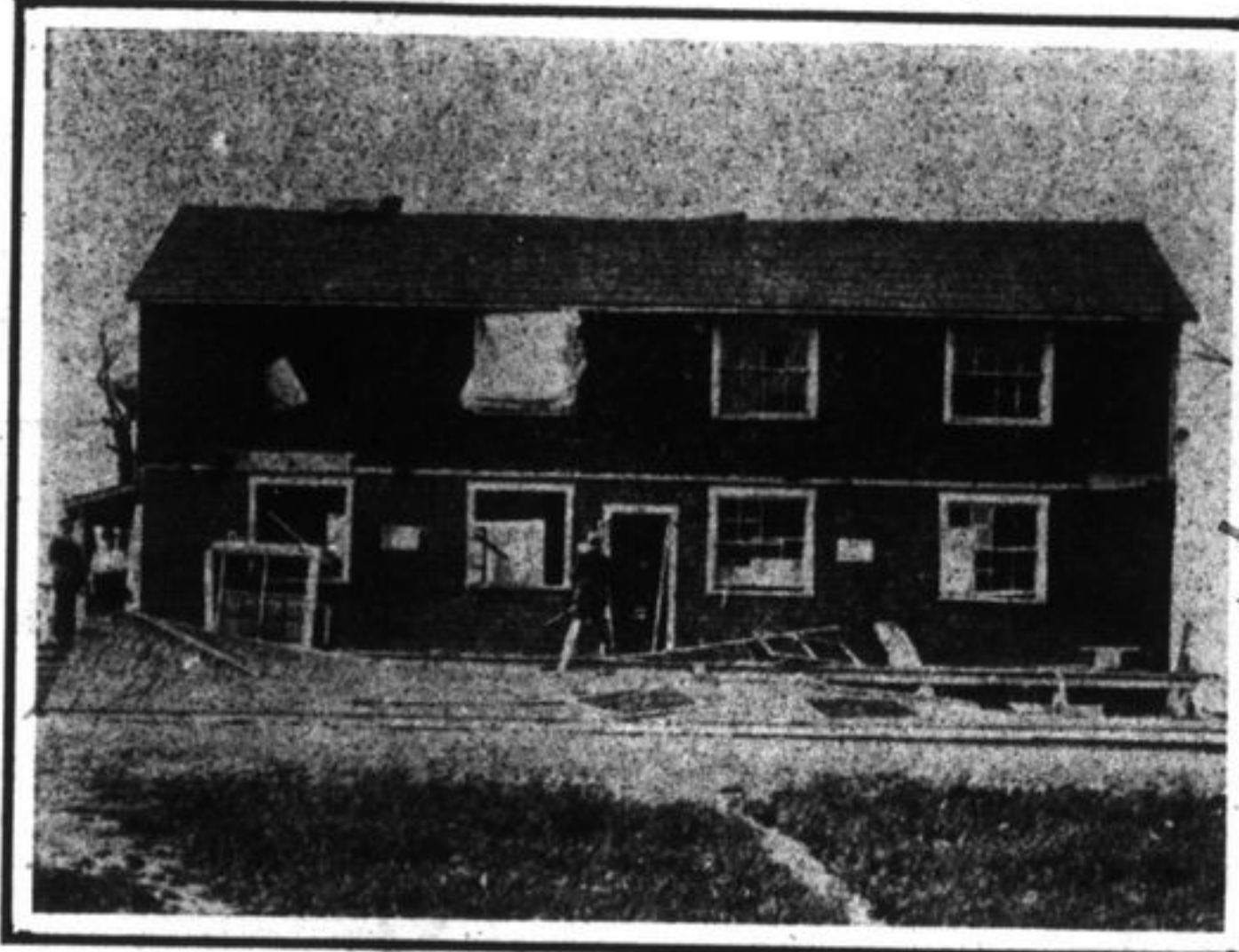
Building wrecked half a mile distant from the explosion at Rigaud, Que.