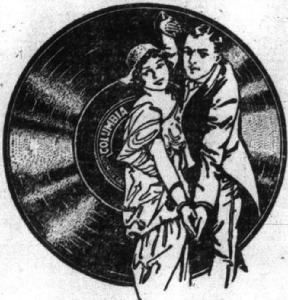
These are the evenings you enjoy