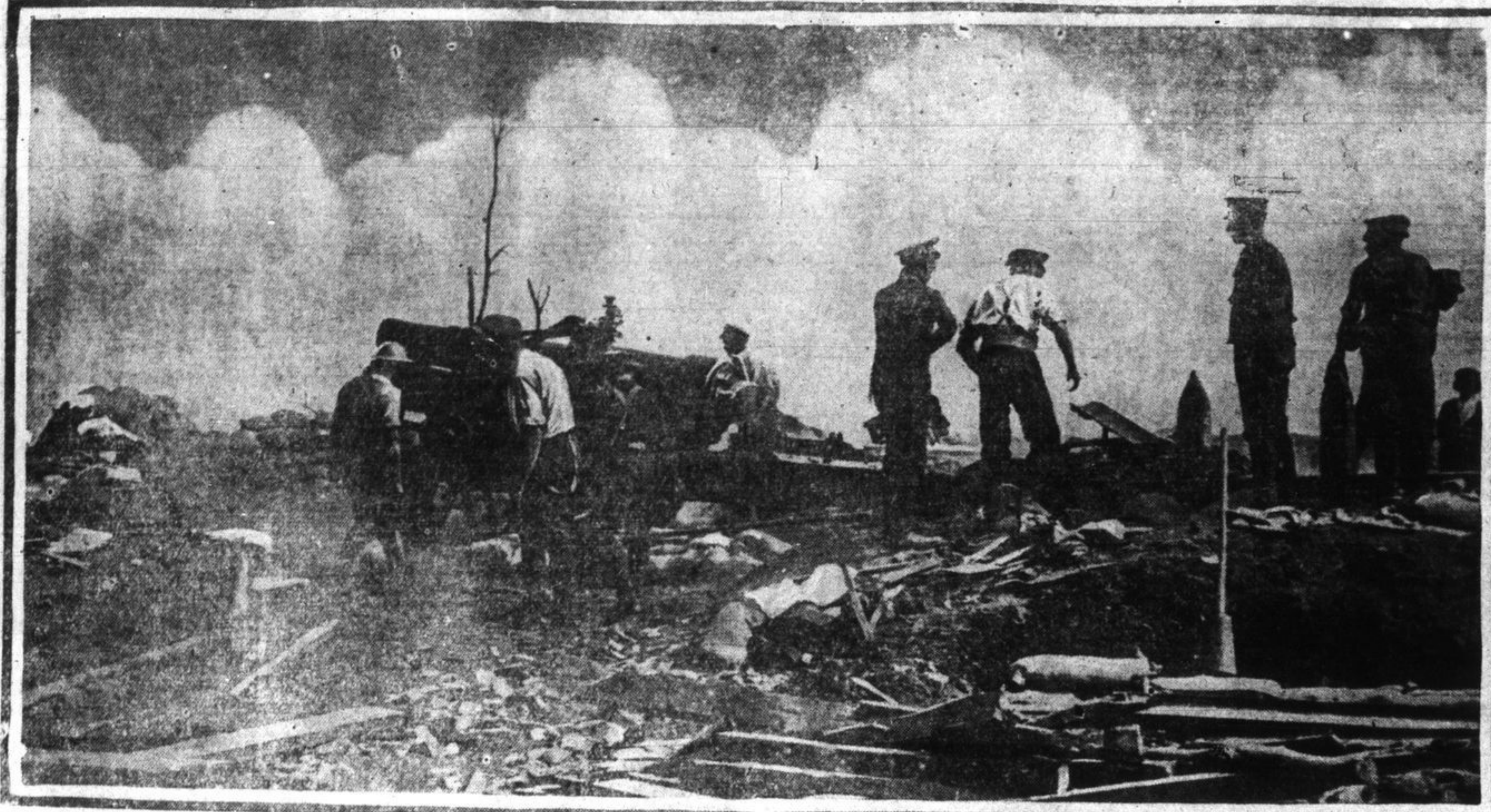
This photograph was taken immediately after the discharge of one of the French heavy howitzers in action at Lys. Many of these guns fired at one time and in a continuous volley are the cause of the gradual retirement of the German infantry. The guns also paved the way for the advance of the allied infantry, which has had such remarkable success.