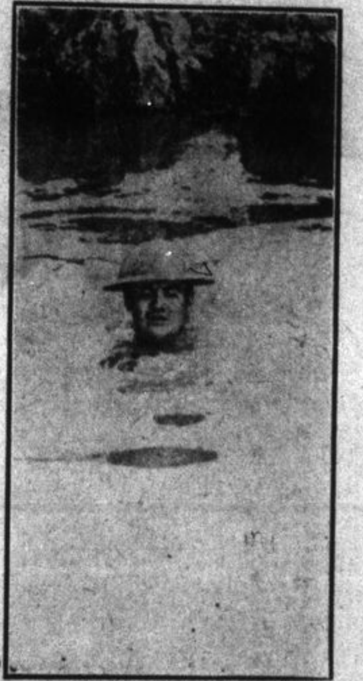
Helmeted against shrapnel bullets: A Canadian soldier's swim in a shell-crater.