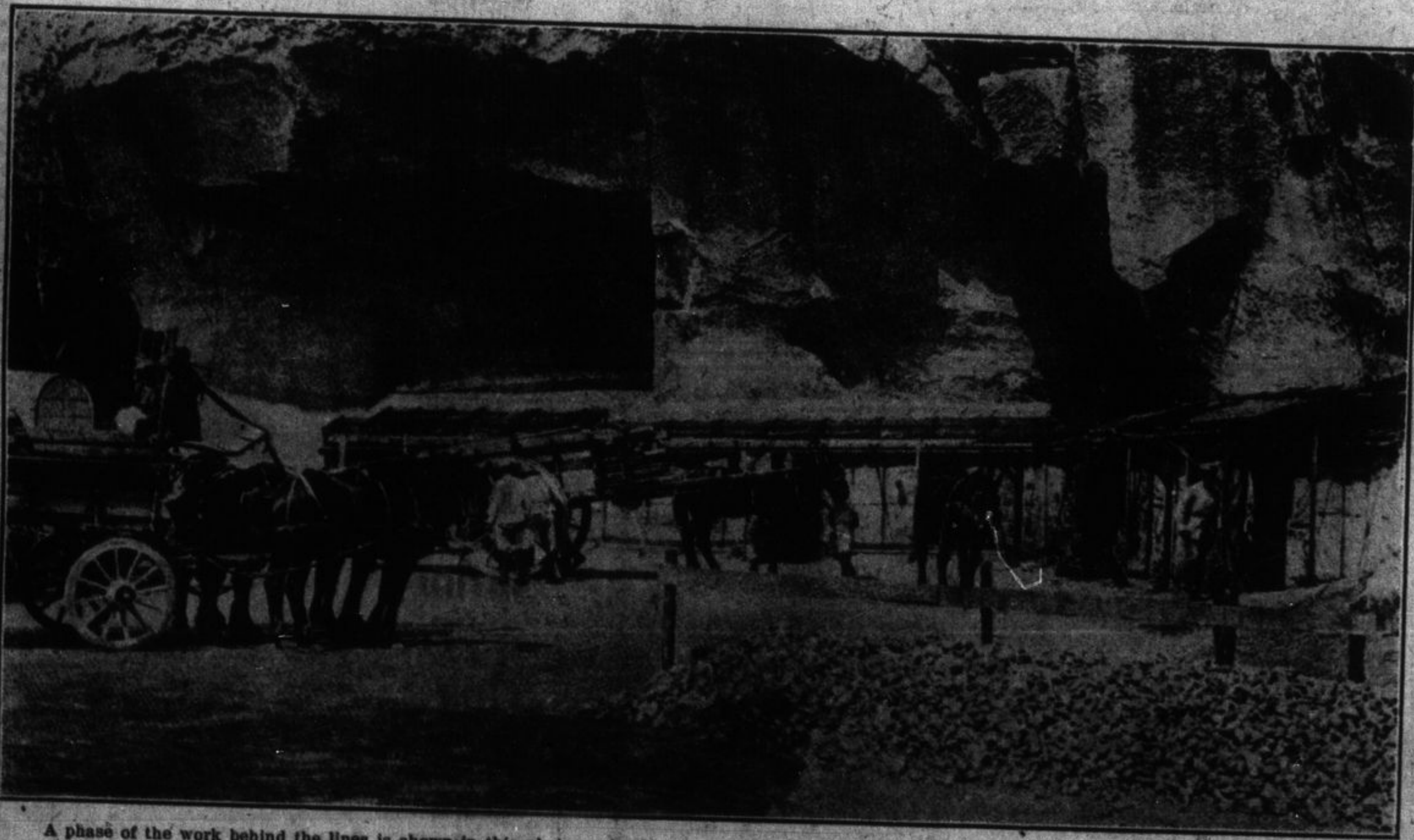
A phase of the work behind the lines is shown in this photograph of a cantonment in the Meuse region. Advantage has been taken of the caves in this region to provide well-sheltered store-rooms for the large variety of supplies which must be kept as handy as possible to the trenches.