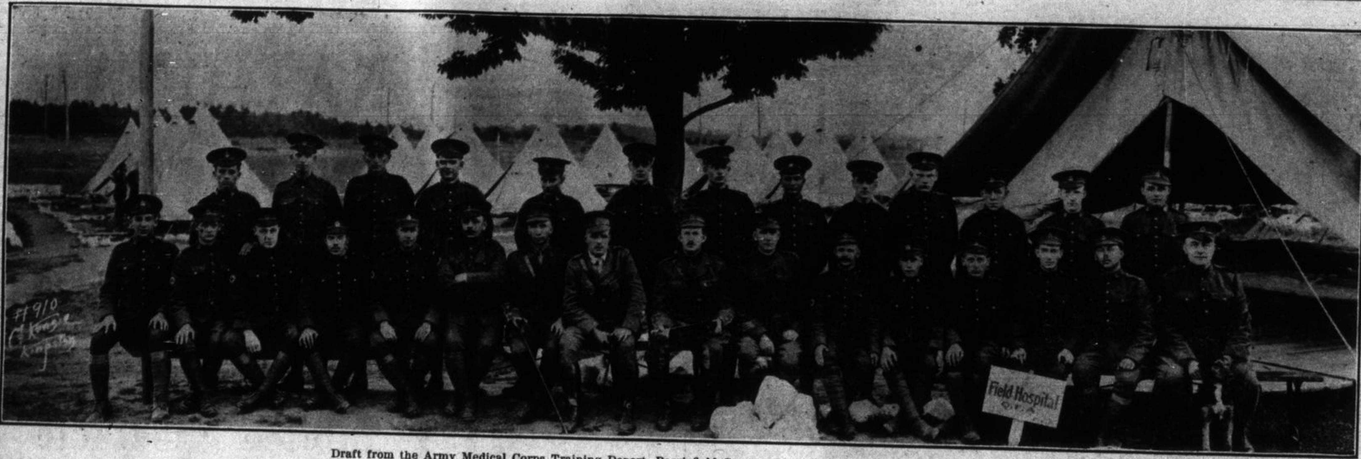
Draft from the Army Medical Corps Training Depot, Barriefield Camp, which recently left for overseas.