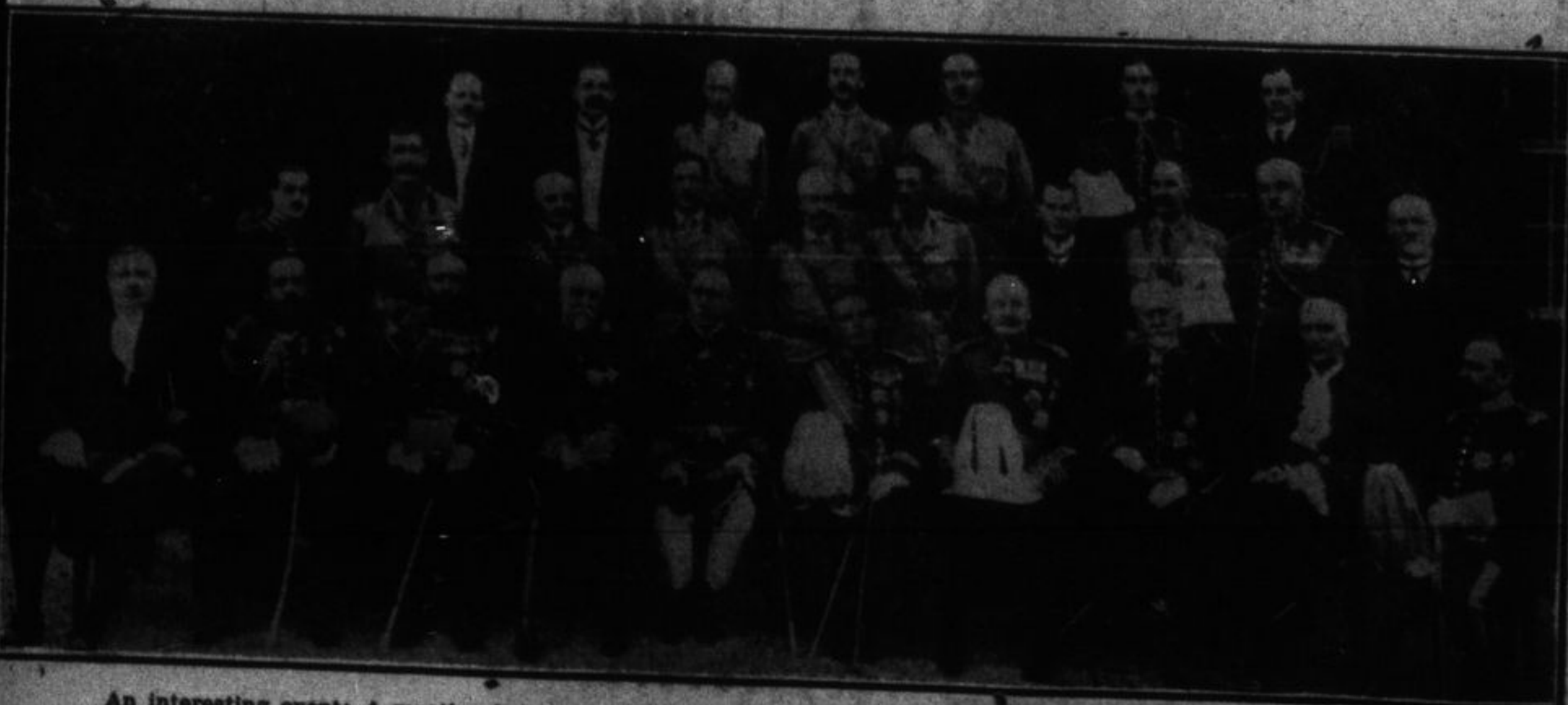
An interesting event: A meeting between the Governor of Algiers and the Commander-in-Chief at Gibraltar.