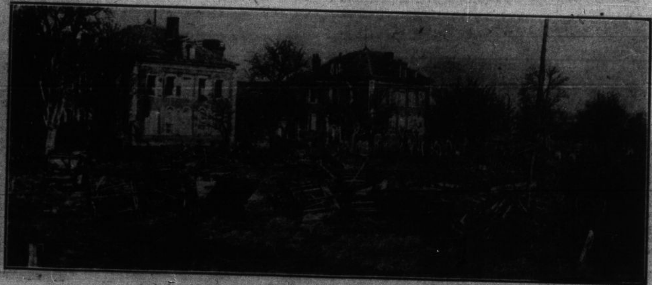
Agricultural machinery destroyed by Germans before abandoning French territory.