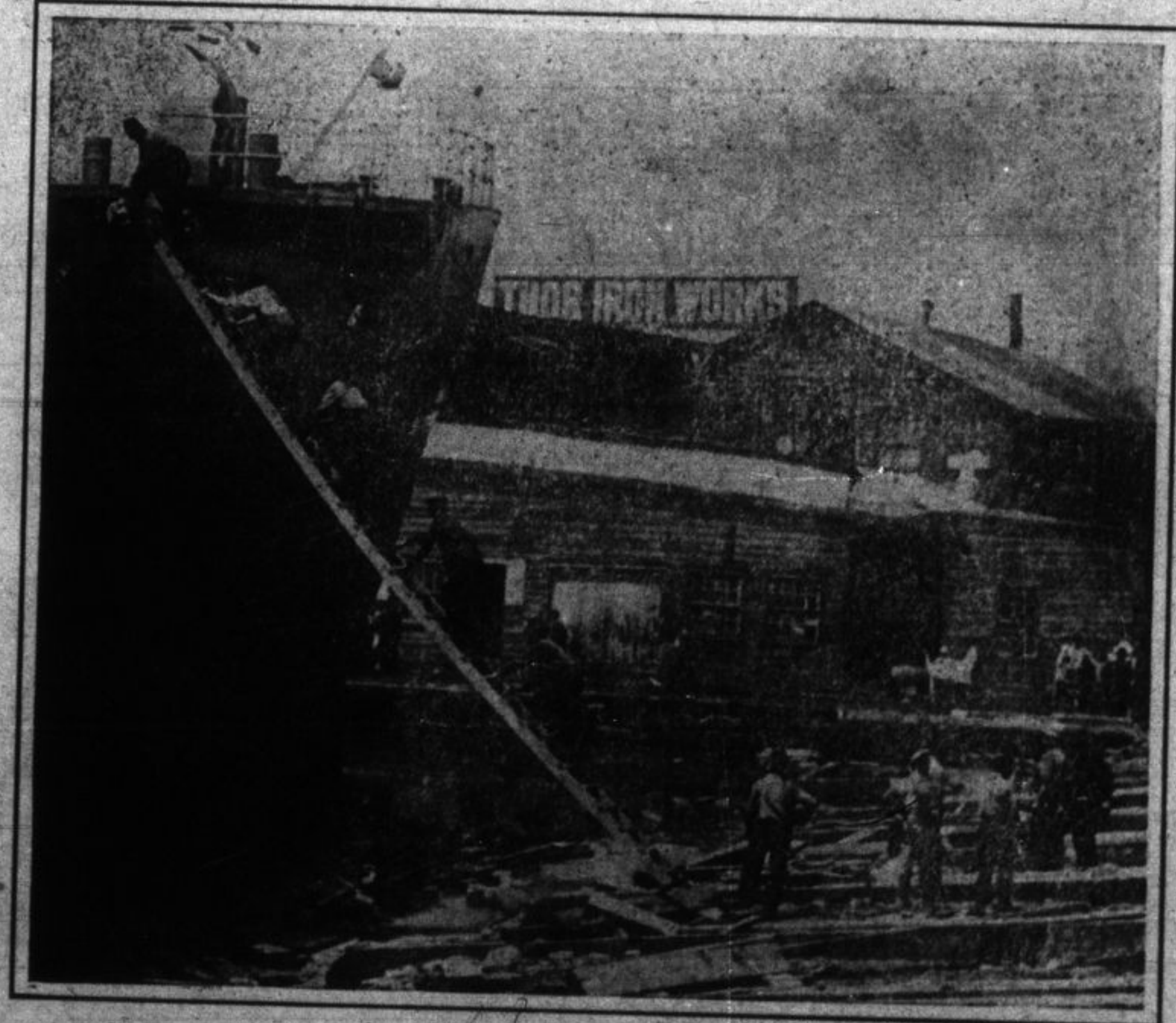
A preliminary scene to the launching of the Or'eans, a new ocean freighter turned out a few days ago from a shipyard in Toronto. The tonnage of this boat is 4,600; her dimensions are 261 feet overall, beams 43 ft. 6 in., depth 28 ft. 6 in. She is expected to be on the Atlantic some time this fall.