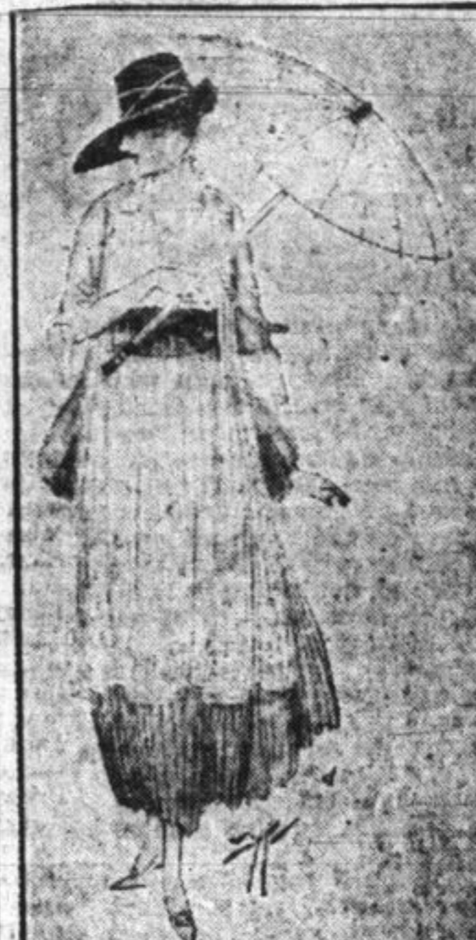
A PRETTY PINAFORE DRESS. This pinafore dress shows the new loose side line and is made of embroidered roses in shades of rose and yellow with green leaves. The pleated underkirt is of primrose yellow crepe georgette.