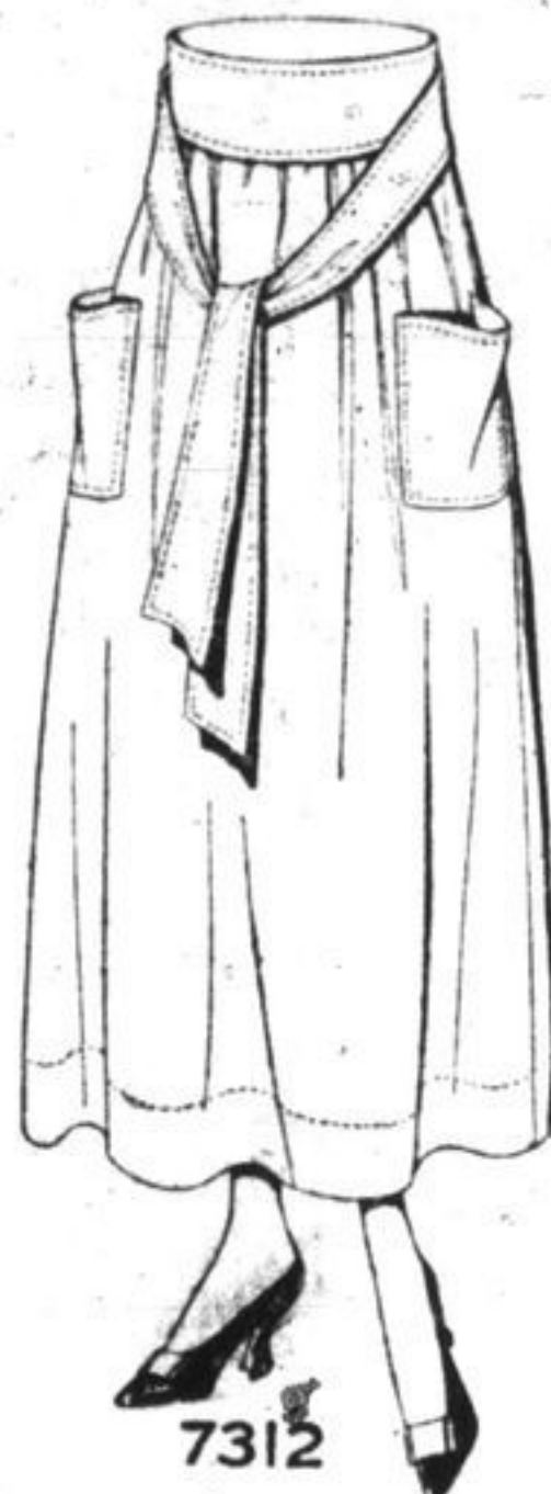
A two-piece skirt designed for development in silk, satin or the smartest materials of the season. One has two choices in the finish of the waistline, a straight belt with a sash or a shirred effect with beading.