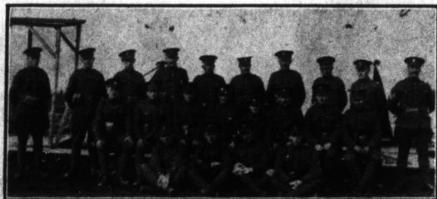
14th Regiment Detachment of Kingstonians guarding Germans at Kapuskasing Internment Camp, New Ontario. Some of the prisoners were formerly at Fort Henry, Kingston.