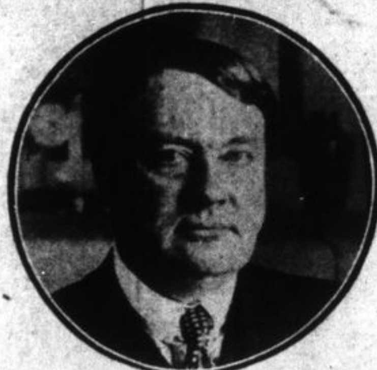
Lord Northcliffe, the well-known British newspaper proprietor, who has been sent by his Government to act as head of the war mission in the United States and co-ordinate the work of the various British official representatives outside the diplomatic sphere.