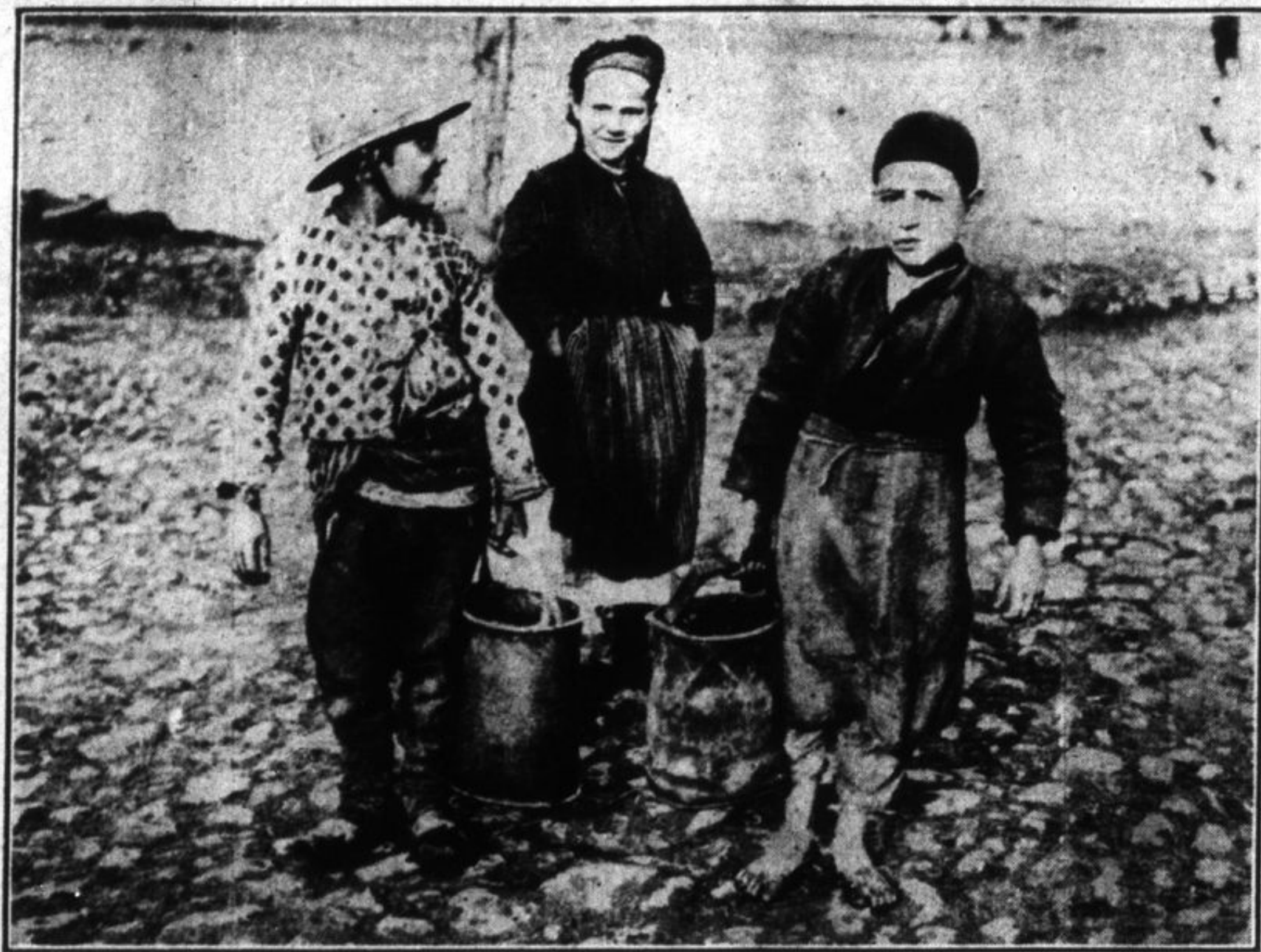
Children who Know Little of Peace.—These children of Monastir, who have been growing up during the two Balkan wars and now the European war, are far more accustomed to an atmosphere of armed conflict than of peace. They are fetching water for the soldiers, from whom one of them has apparently received the helmet which he proudly wears.