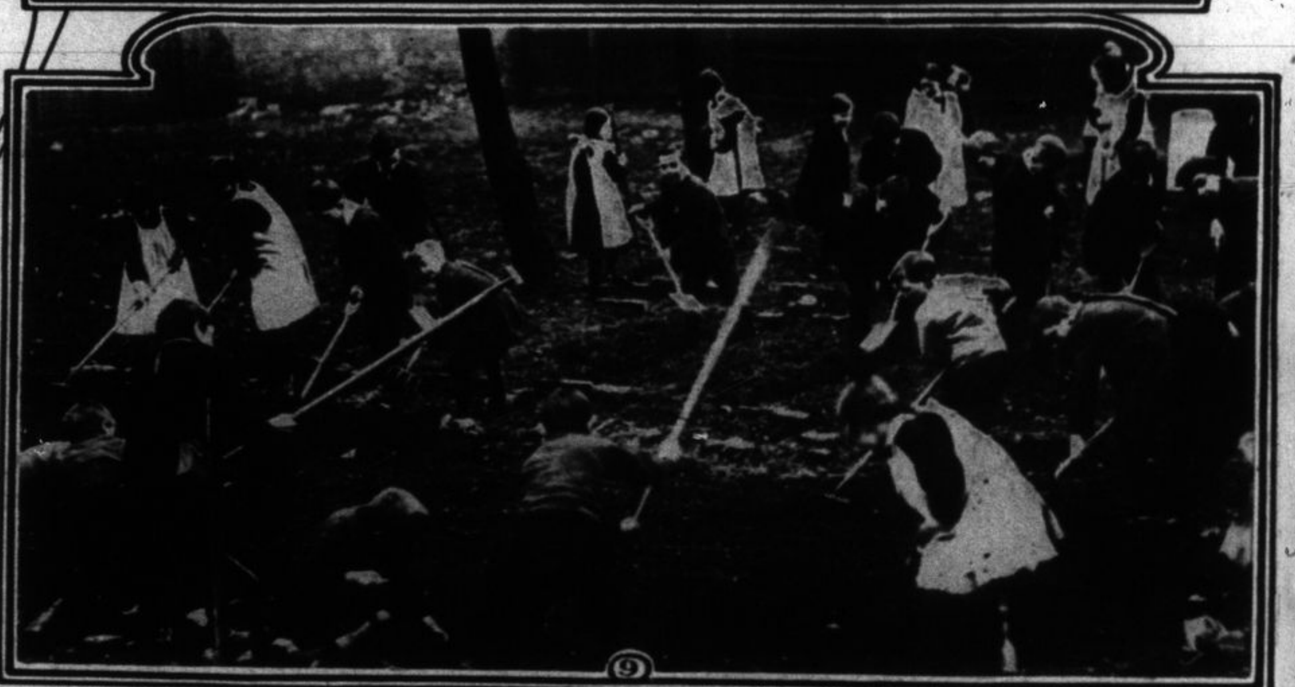
1.—Bapaume ruins from the Tower of the Mairie. 2.—Mules quartered amid the ruins. 3.—The destroyed Church (interior) at Bapaume—the Altar. 4.—Review of Sphais at Salonica. The Sphais Standard Bearer with its guard, who wear long hair. 5.—Australian transport passing a house in Bapaume, which has been blown up leaving the four walls standing. This picture shows how the Germans destroyed all the houses by explosion. 6.—Young Canada in line—"and if we could only get to the front, we would show the Germans how to fight." 7.—"Minnie" is the prize pachyderm of the Brookside Zoo, Cleveland, Ohio. When it was first suggested that "Minnie" be conscripted into the agricultural army to aid the war garden campaign, her keepers expressed doubts. They said she would never submit to being harnessed to a plow, but she fooled the keepers, when five girls, dressed in overalls and "armed" with a plow, appeared at Brookside Park, and proceeded to make "Minnie" acquainted with her new duties. Their report and the photographic evidence presented to the Park Commissioner, convinced that official that the plan was feasible, and so "Minnie" will join the land contingent of our industrial army. 8.—Red Triangle Club, Toronto, Y. M. C. A. Club of Soldiers. The Cafeteria—the longest bar in Toronto. 9.—The cripple children of the John Ruskin School, West Newington, are cultivating a plot of ground opposite the school, to grow their own vegetables.