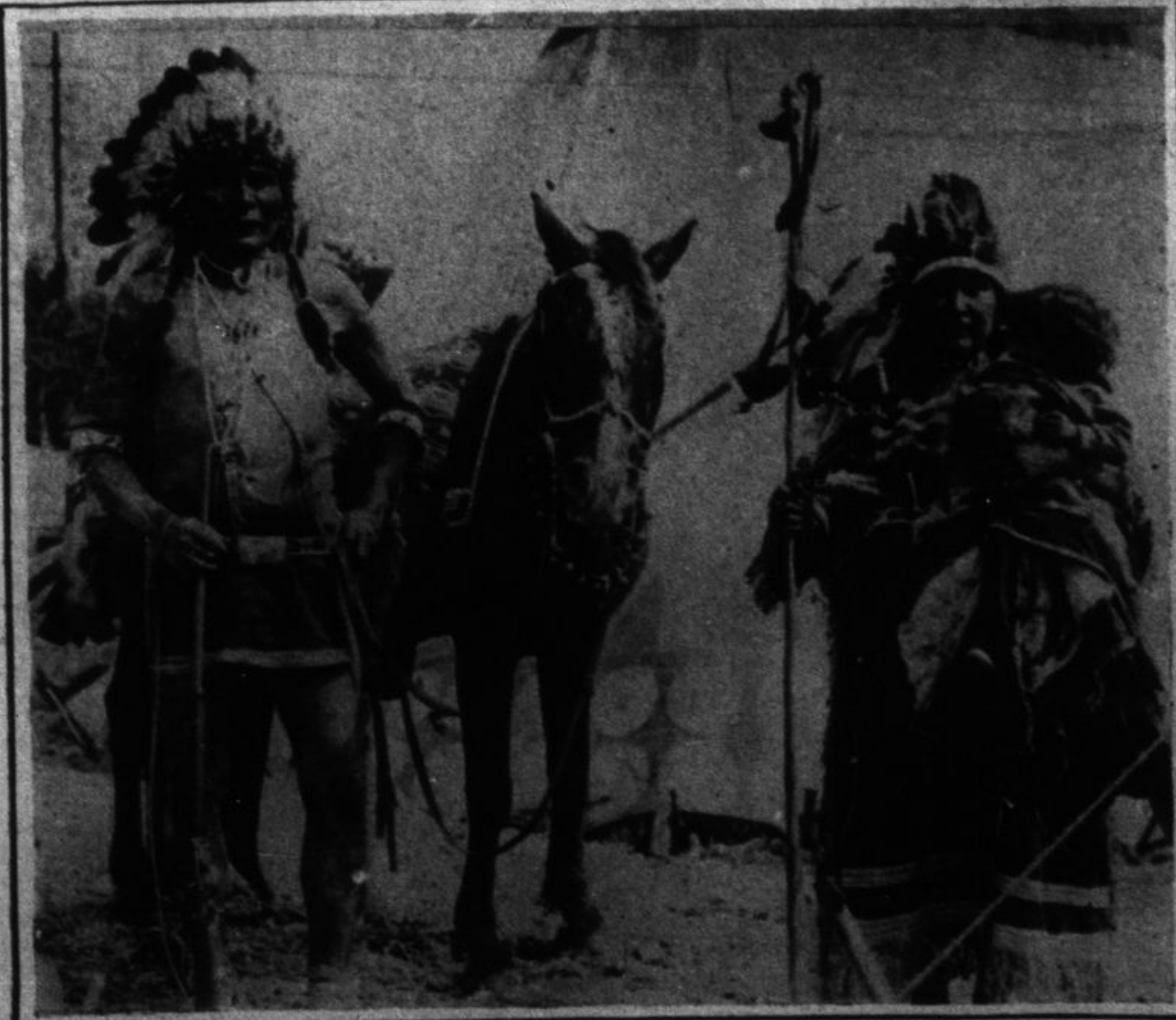
A brave in scanty clothing, his squaw and papoose, with their Indian pony form the usual family group.