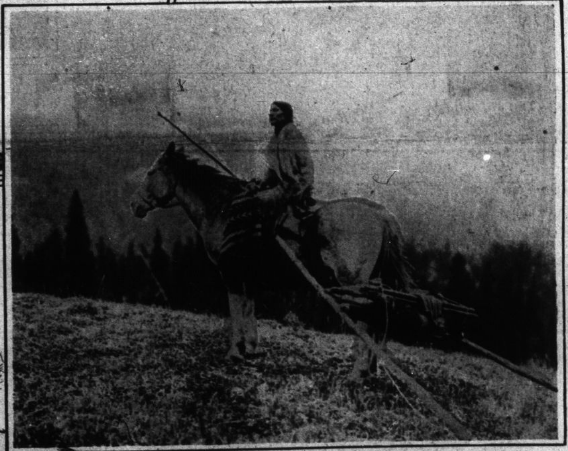
A very picturesque and natural pose of an Indian on the Blackfeet Indian Reserve in Western Canada.