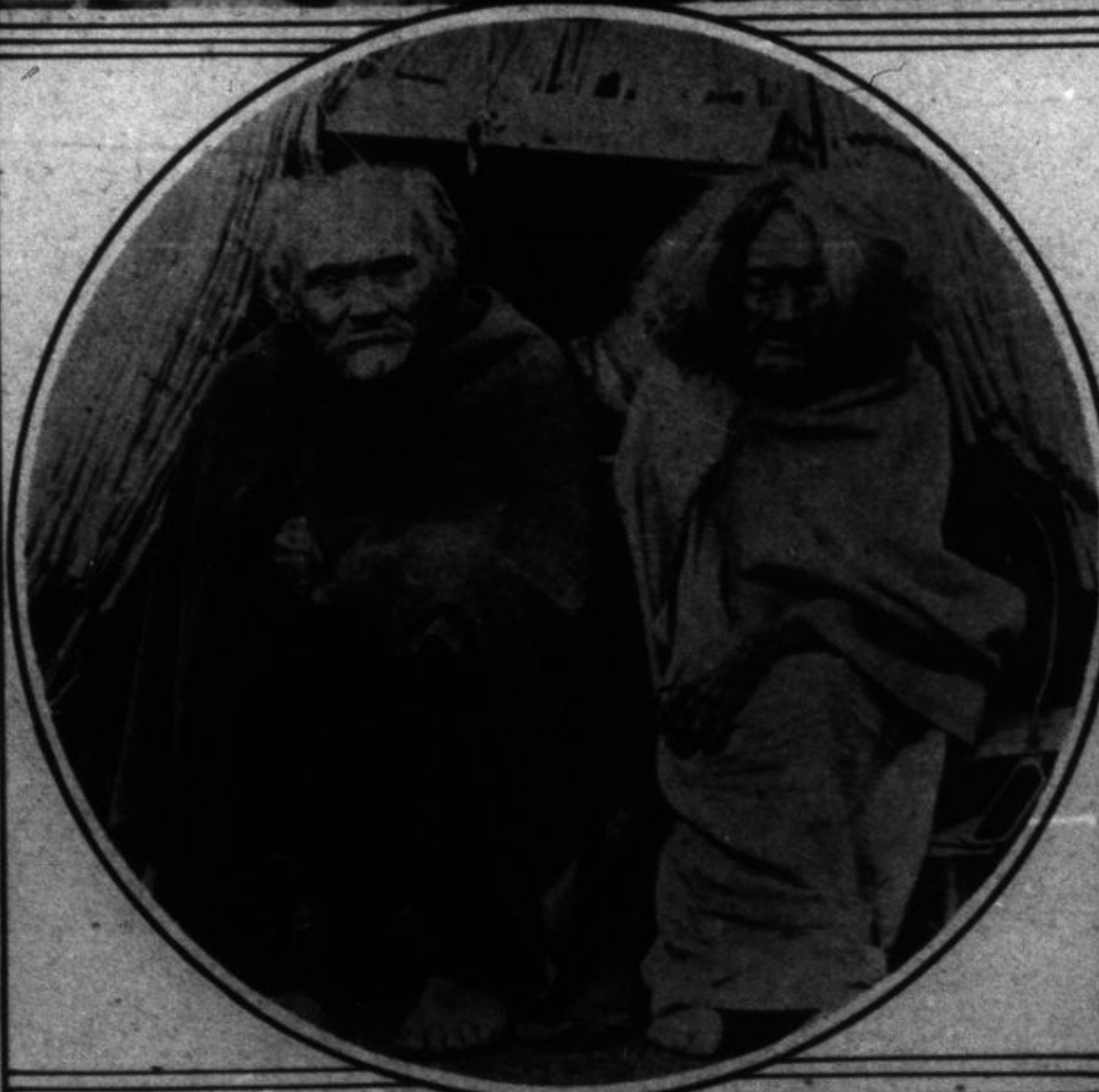
Indian and squaw of the Cowichan tribe of Flatheads at Anko-meanum, British Columbia. The man is 112 years old and the woman 108 years.