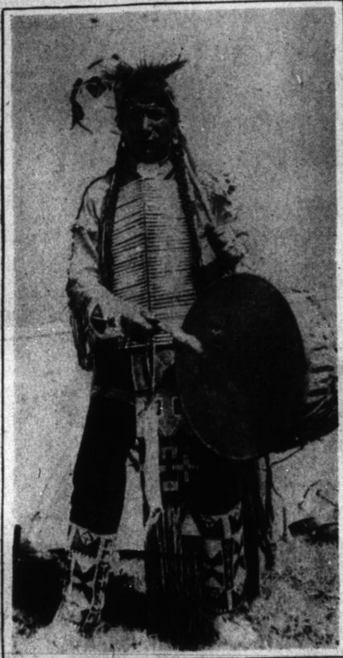
A real "Injun" on the western plains, dressed in his holiday attire, sounding the tom-tom.