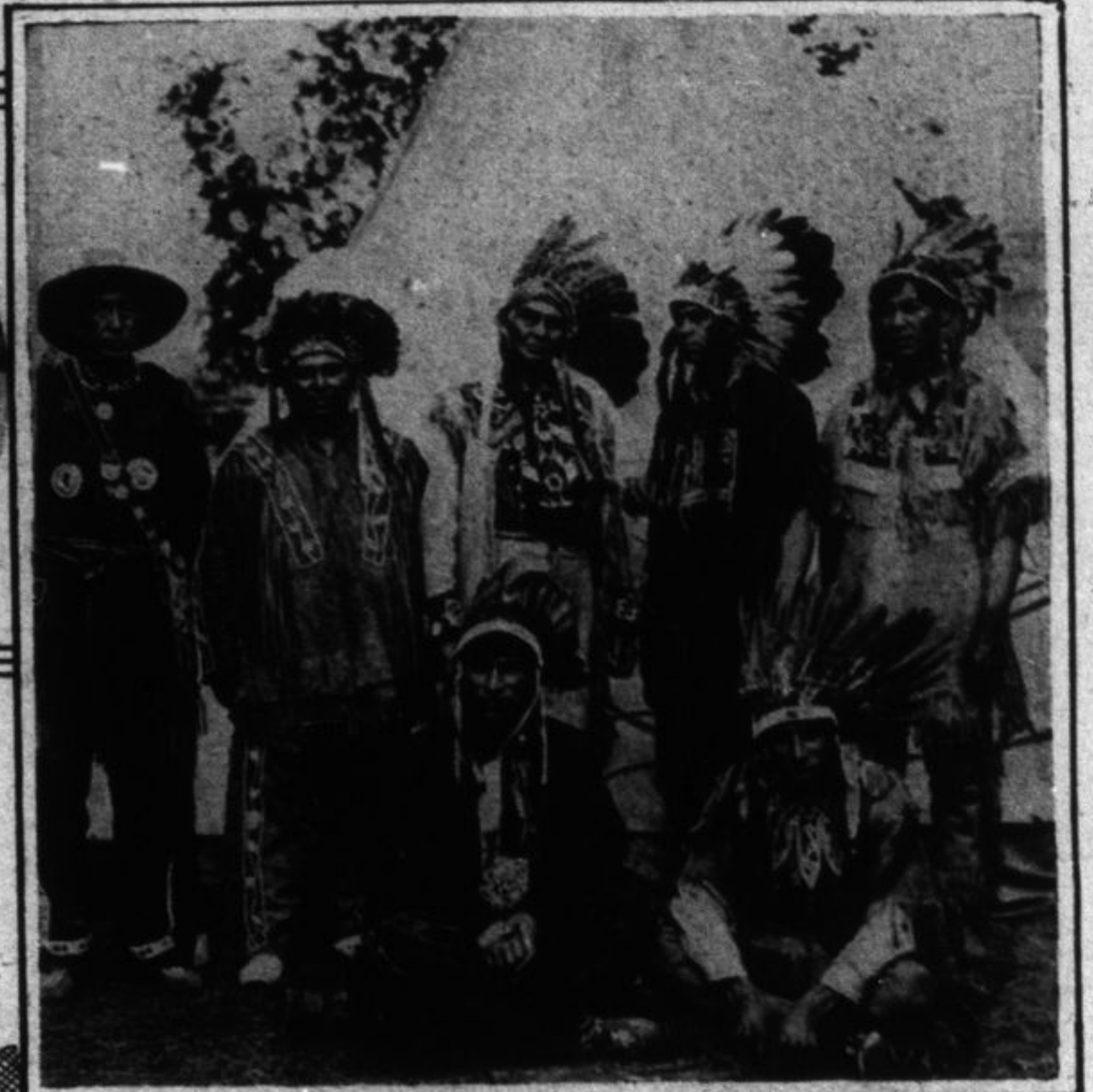
A scene which brings to mind the early days in Canada's history, when the land was at the mercy of the red man. Now these few members of the Caughanaway tribe pose readily for the photographer.