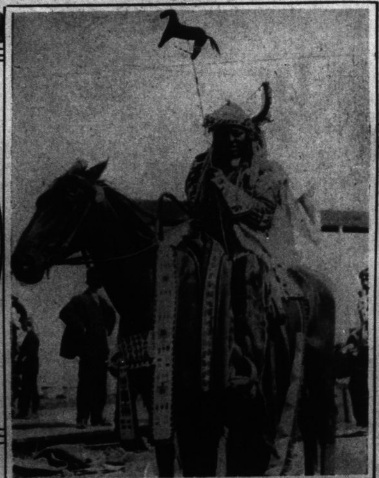
An Indian from the Calgary Hills in full costume.