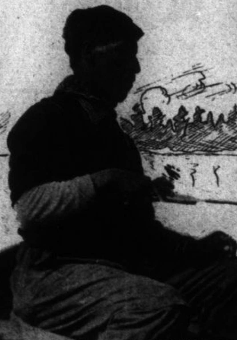
A study in concentration. Note the intent look on the face of this Ojibway as he fishes for mid-day meal. (Photo below.)