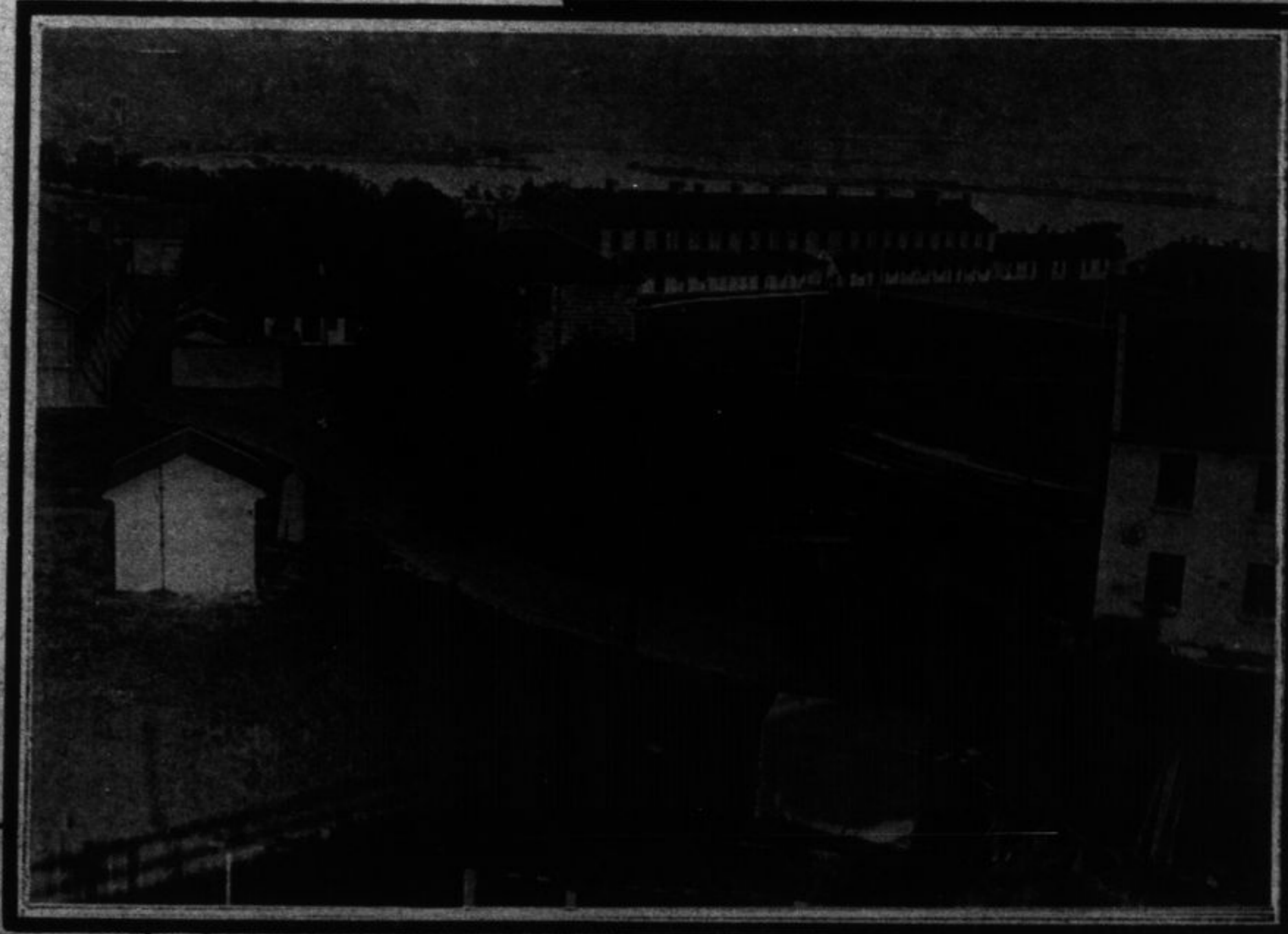
General view of Fort, Toronto, from Exhibition Park. Toronto Island and Bay in the distance. Pergola made of Tombstones erected at Galt by the L.O.D.E. They were taken from a cemetery converted in a public park. (Below.)