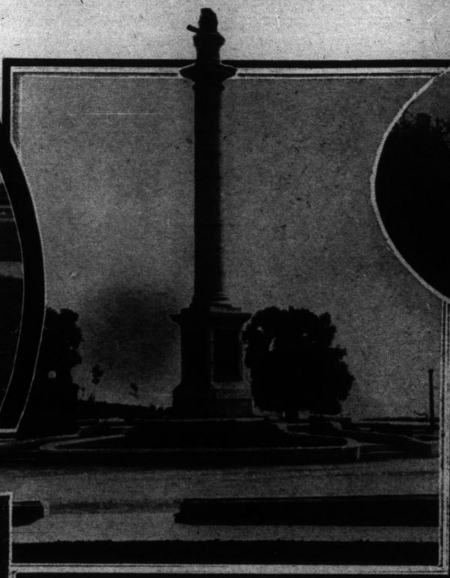
Wolfe's Monument on the Plains of Abraham, Quebec. This is the fourth monument erected to this great soldier, the first being set up in 1763, and the other in 1832, 1849 and 1912, the last being the one here pictured. The Plains of Abraham are now undergoing a transformation under the supervision of the Dominion Battlefields Commission.