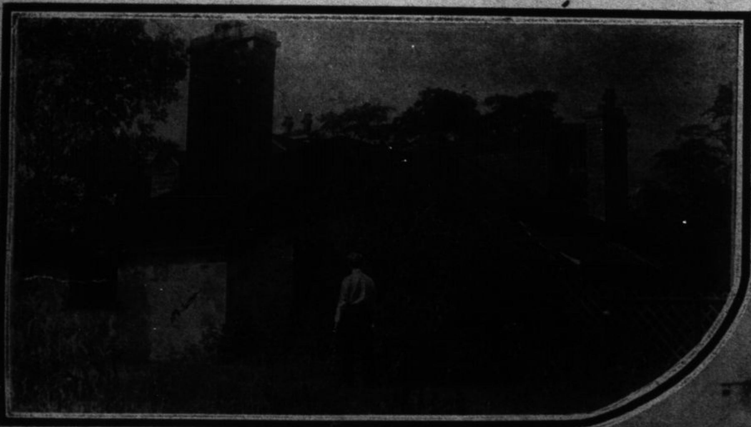
Tete de Pont Barracks, Kingston, now in active use by the R.C.H.A. They were built originally in 1672 and known then as Fort Frontenac, changed in 1788 to Tete De Pont and reconstructed in 1845 into present condition.