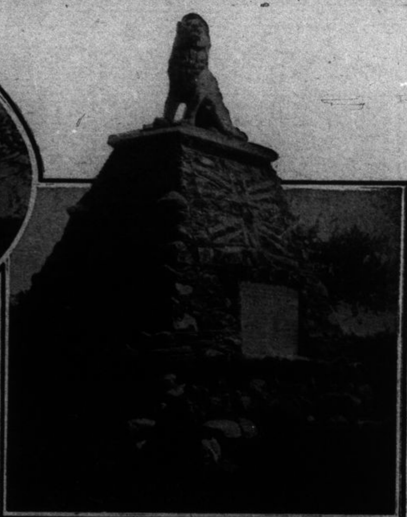
Another scene from Stoney Creek. This shows a cairn on the battlefield, to mark the last resting place of those slain in the battle of June 30th, 1812. (To the right.)