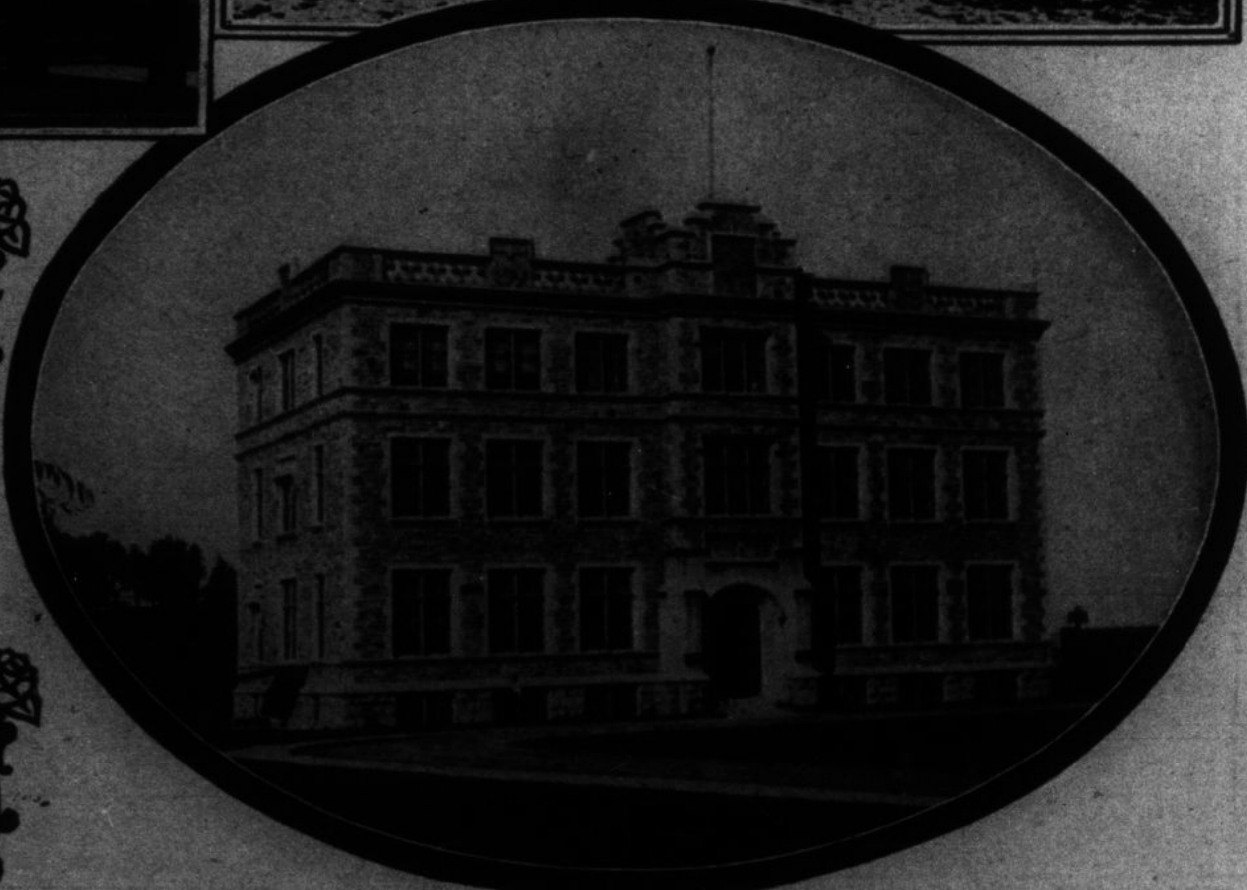
The Government Archives Building at Ottawa, which is the centre of historical lore of the Dominion.