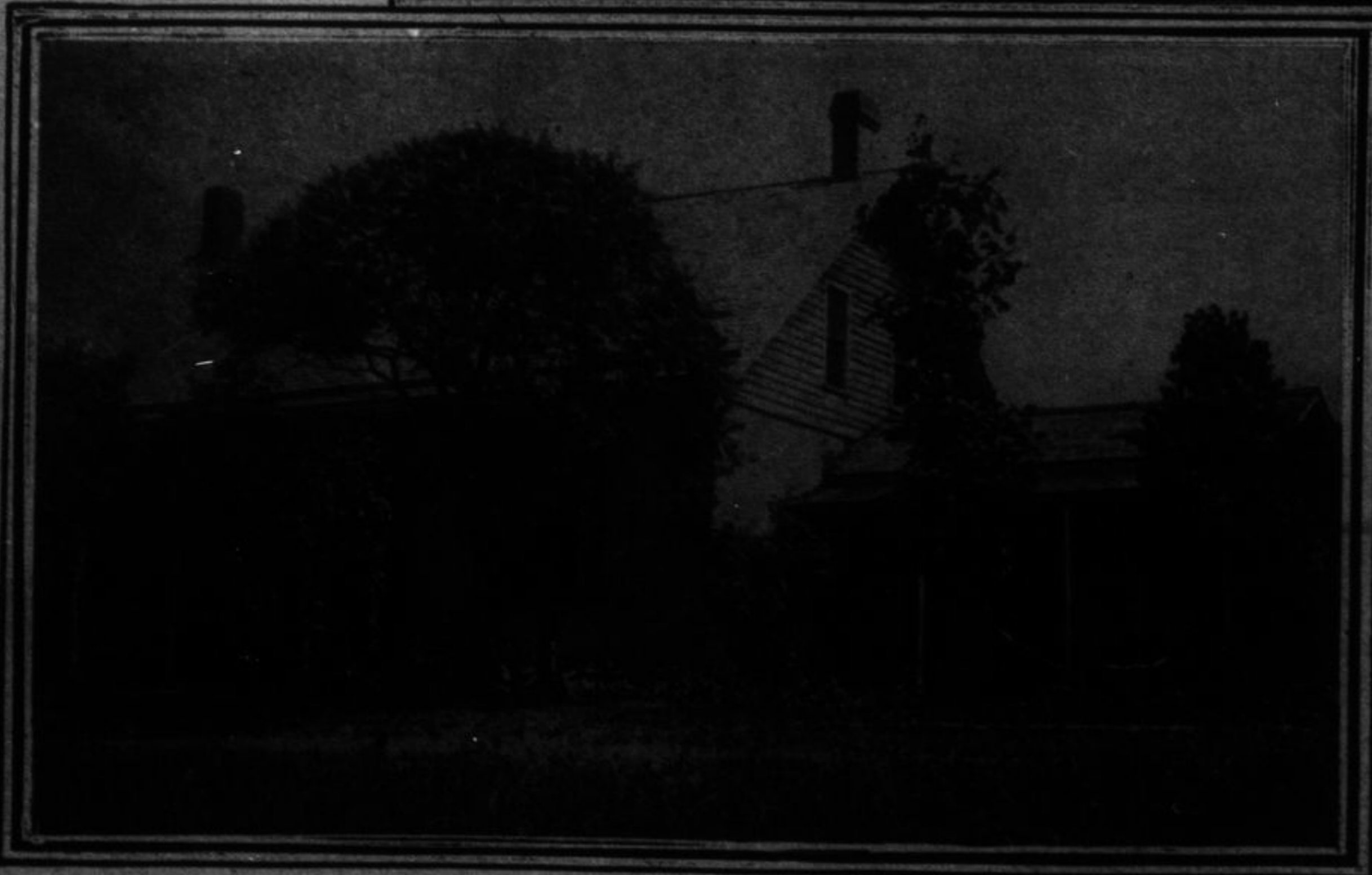
A view of the historic home of Laura Secord at Chippewa.