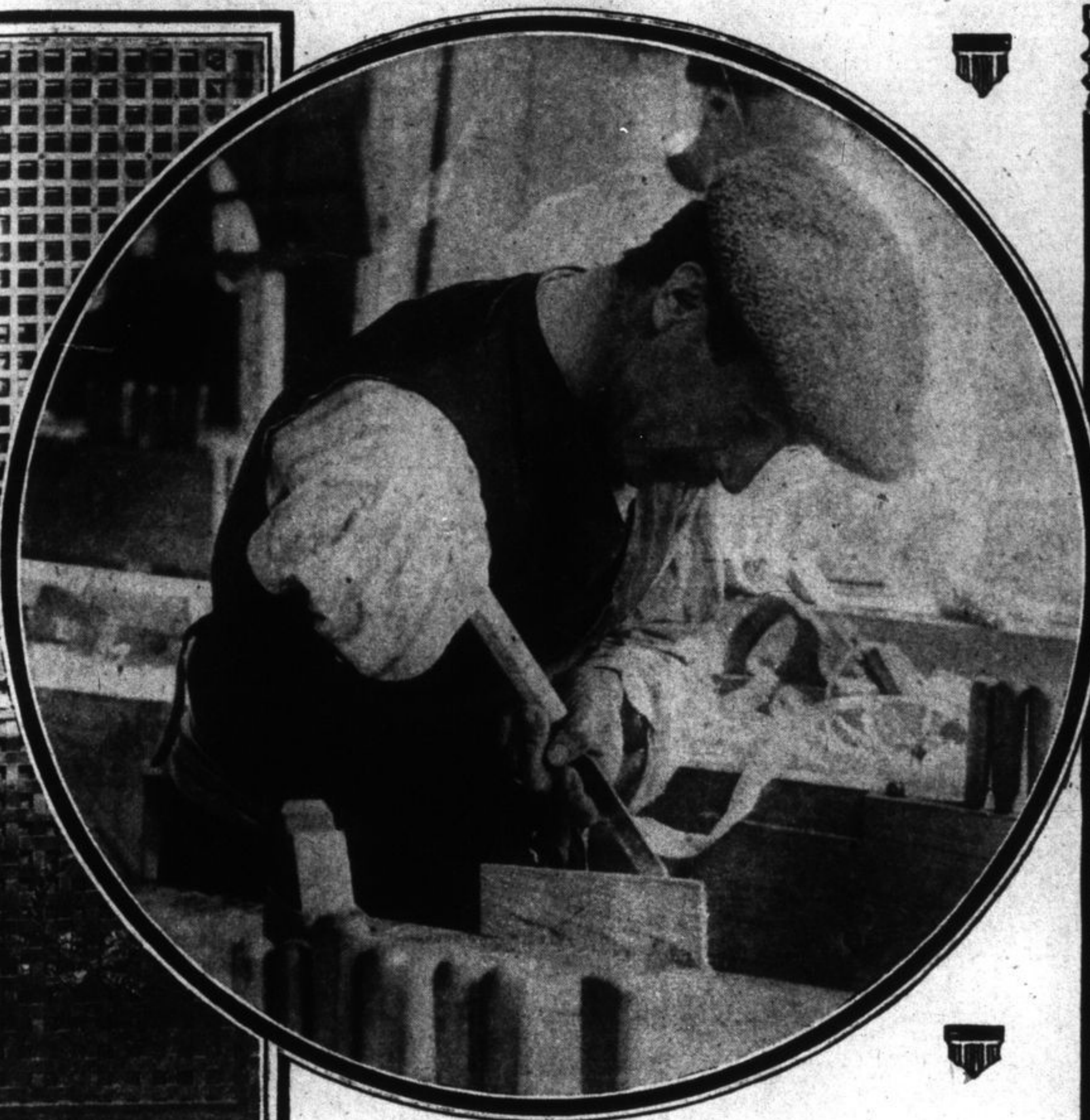
Much discussion has arisen over the maimed soldier problem. That it is rapidly losing all its difficulties is apparent from the reports of those in charge. France has done exceedingly well in this line, and the photograph shows a French soldier learning the carpenter's trade.