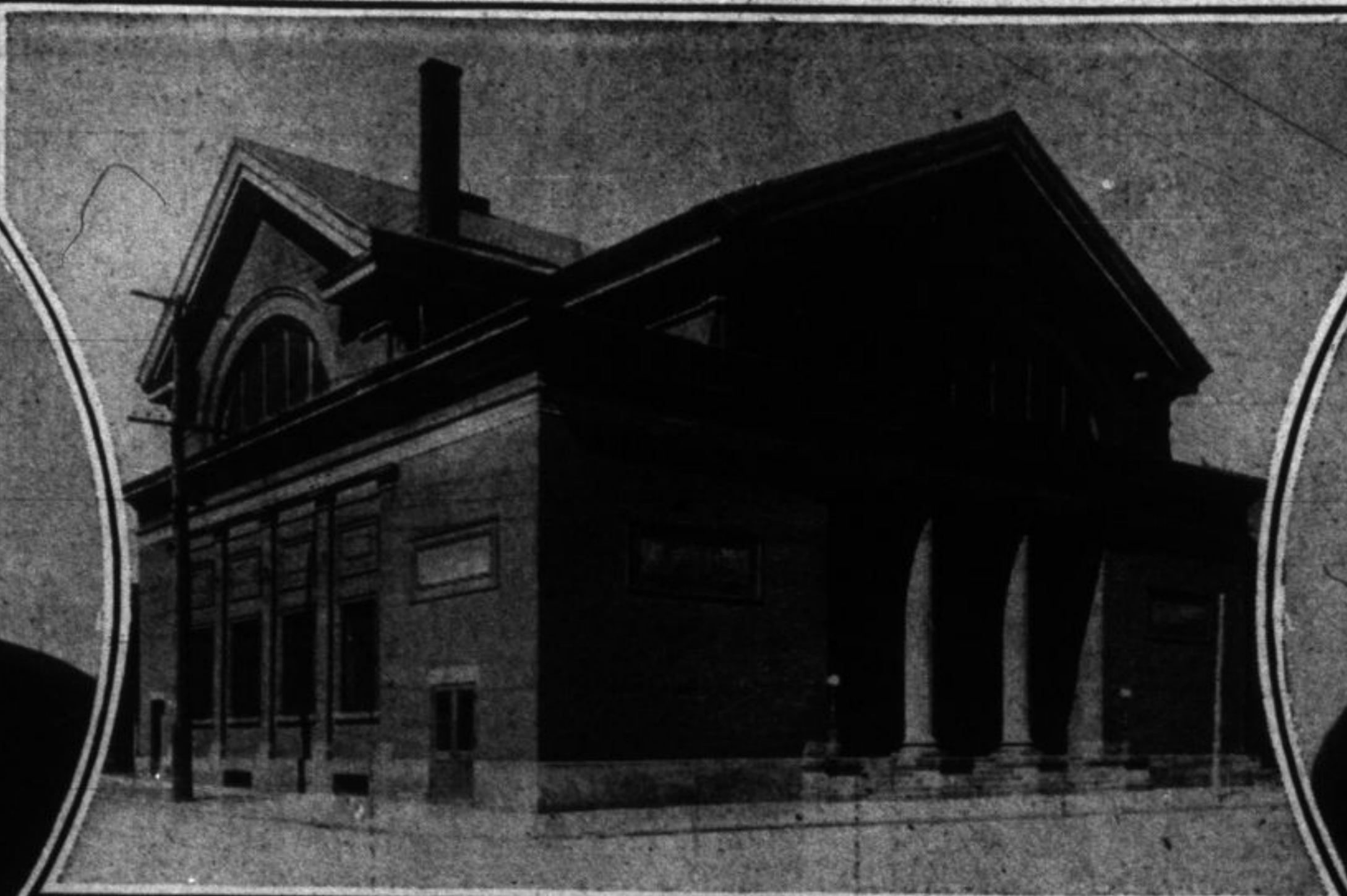
Gospel Tabernacle, Hamilton, Ont.