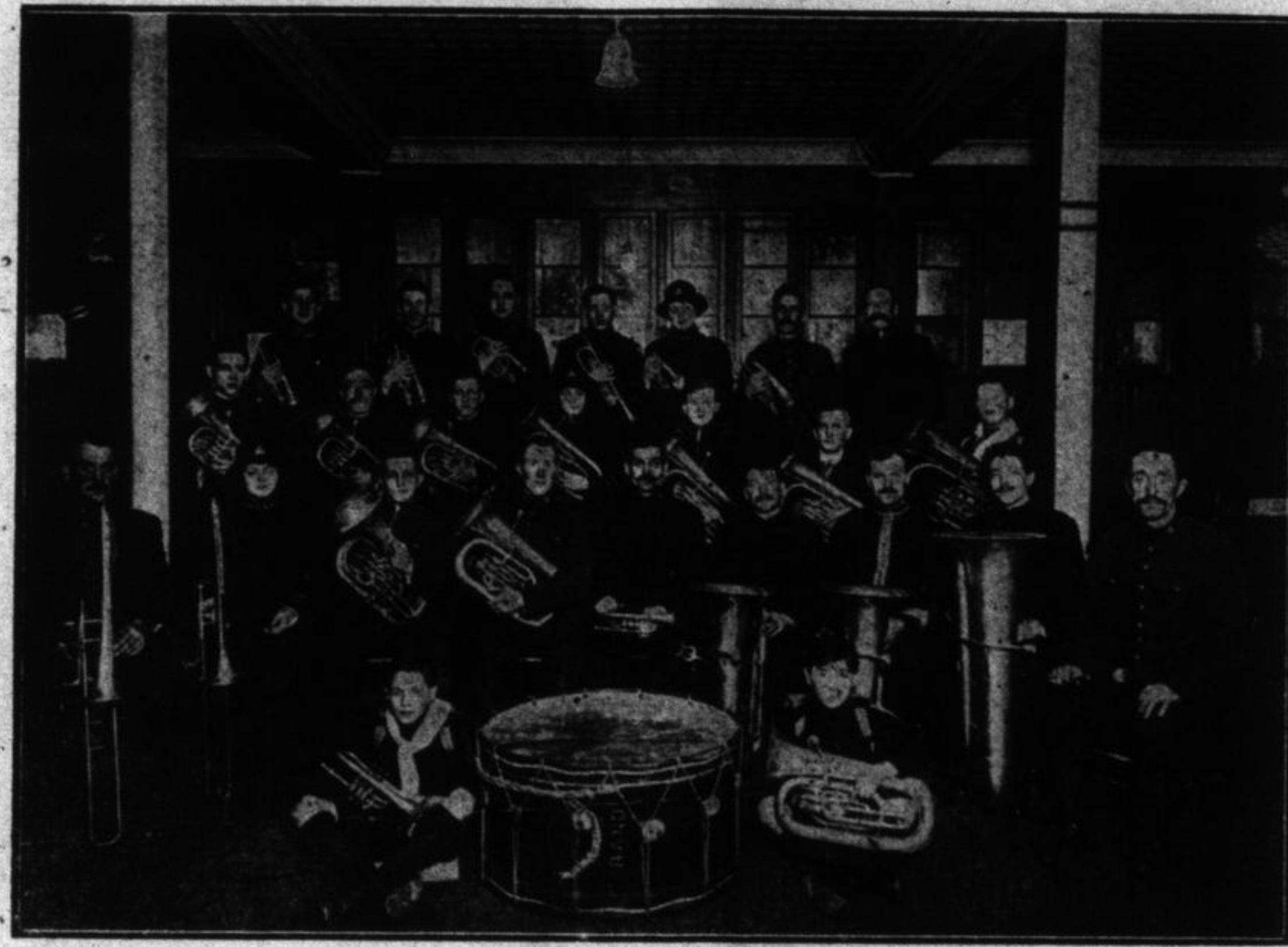
SALVATION ARMY BAND, KINGSTON.