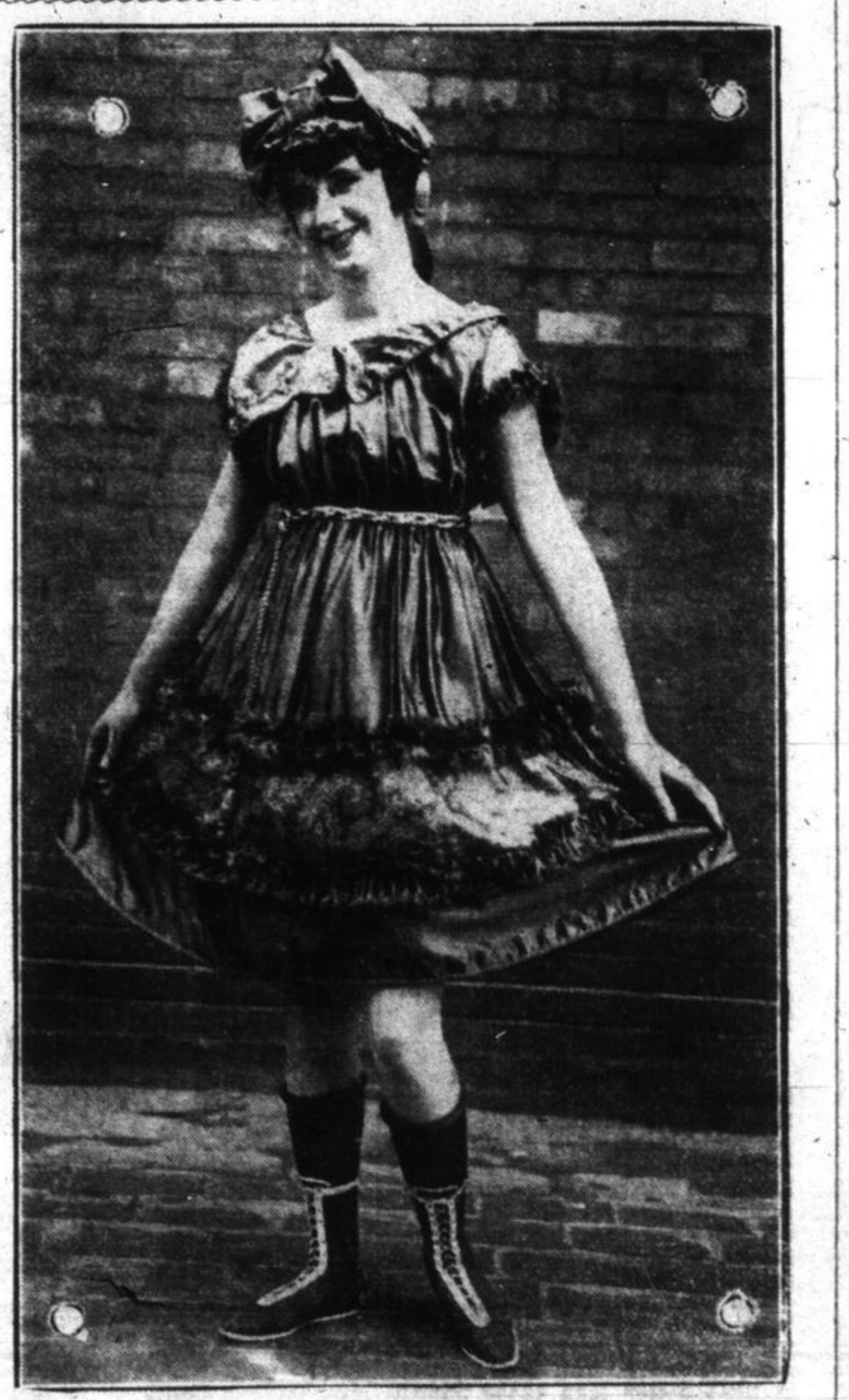
PRETTY BATHING COSTUME. Many pretty bathing suits were on exhibition at the Fashion Show, in Madison Square Garden, New York, but the one that would win the prize, if there were one, is this abbreviated bathing suit. Red satin is quite a new color for a bathing costume, and it created a sensation. The suit is quite tastefully trimmed with gold brocade. It is extremely doubtful if any of the fair sex will venture out on any of the public beaches in the socks and red canvas shoes together with the rest of the creation.

cups milk, 2 eggs, 1 teaspoon salt, 1/4 pound bacon. Utensils—Double boiler, two measuring cups, teaspoon, large spoon, bowl and platter, eggbeater, casserole dish, small frypan. Directions—Put the milk and 2 cups of water on in top of double boiler; when boiling add the cornmeal slowly, stirring all the time until it thickens; add the salt, cover and let it boil 1 hour. Separate the eggs and add the well-beaten yolks and the whites that have been beaten until light; brush casserole or earthen dish with drippings, pour in the mush and bake in hot oven 35 to 40 minutes. Garnish top with fried bacon. Serve with spoon from the dish in which it is baked. A milk gravy made from the bacon drippings makes a good hearty addition.